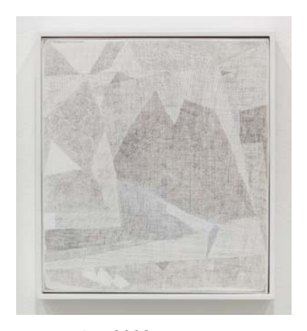
suppression 2008 tempera on panel 35 x 31 cm