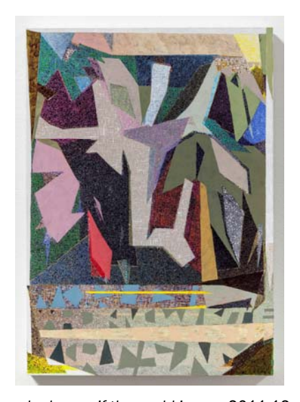
who knows if the world is one 2011-12 egg tempera on wood 49.75 x 35 cm