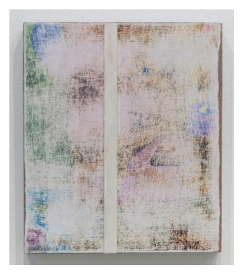
untitled 2009 egg tempera and wood on panel 14 x 12 cm