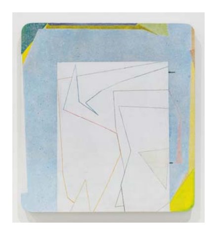
all suppression is a substitution 2011 egg tempera on wood 45 x 41 cm