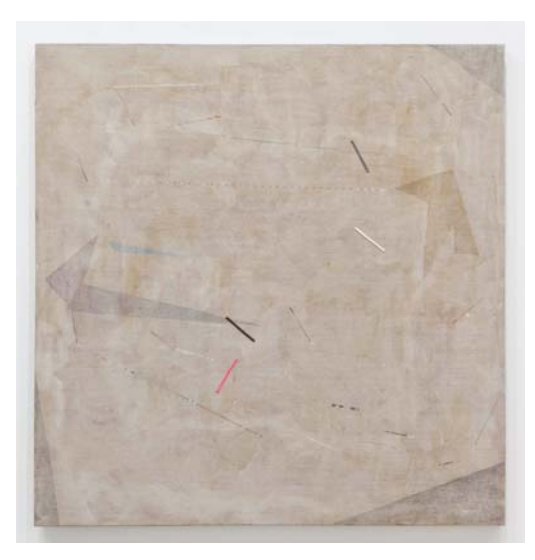
you may gather pencil crayon, pencil, shellac and piping on linen 167.5 \times 162.5 \text{ cm}