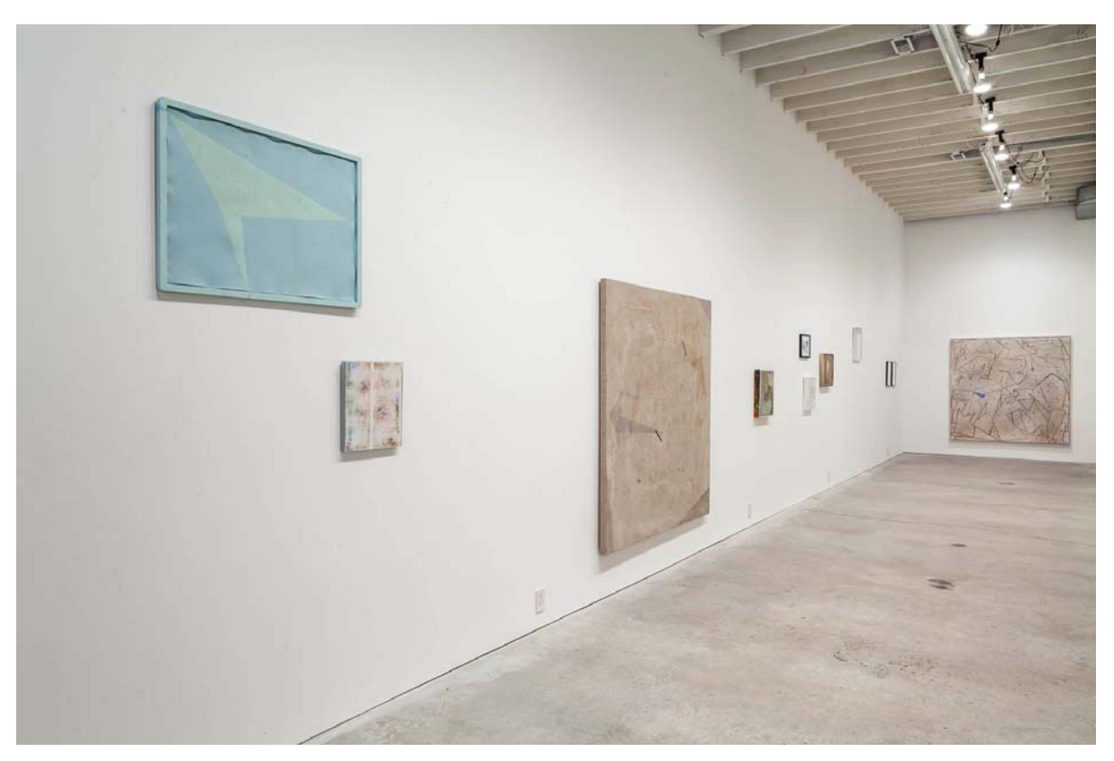
Patrick Howlett: How Hummingbirds Choose Flowers Installation view