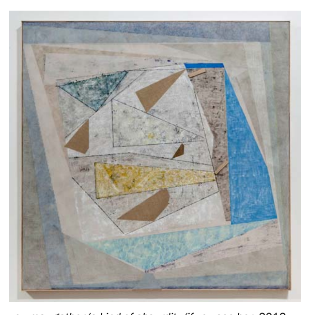
you may gather/a kind of absurdity/if you see her 2012 pencil crayon, distemper, oil, oil stick, linen and wood on linen 169 \times 169 \text{ cm}