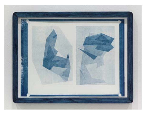
chrysanthemums 2008-12 cyanotype 24.75 x 33 cm