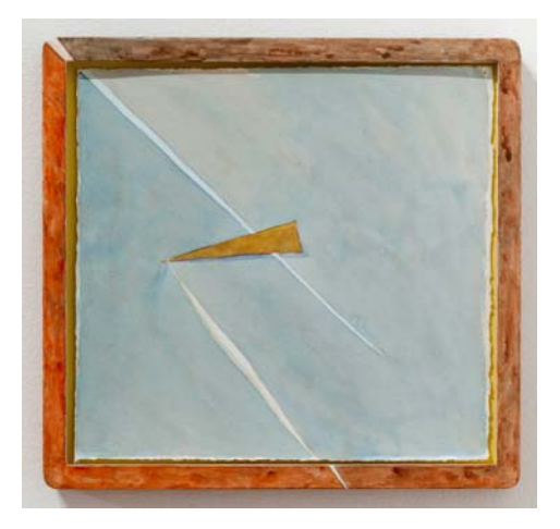
the gap 2004-12 watercolour on paper 30.5 x 32.75 cm