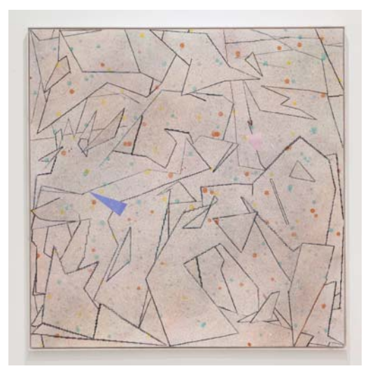
how hummingbirds choose flowers 2012 charcoal, watercolour, pencil, collage on linen 171 \times 168.25 cm