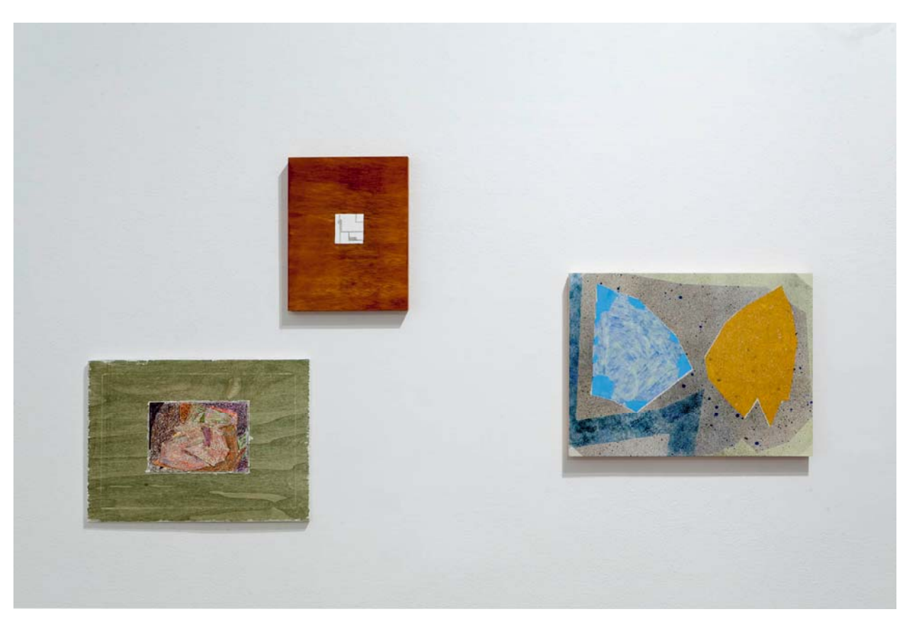
left: Untitled 2012, crayon on masonite, stain on wood, 29.25 \times 40 \text{ cm} centre: design exercise 2009, silverpoint on wood, 28 \times 21.5 \text{ cm} right: reaching out somewhere 2012, egg tempera on wood, 50 \times 35 \text{ cm}