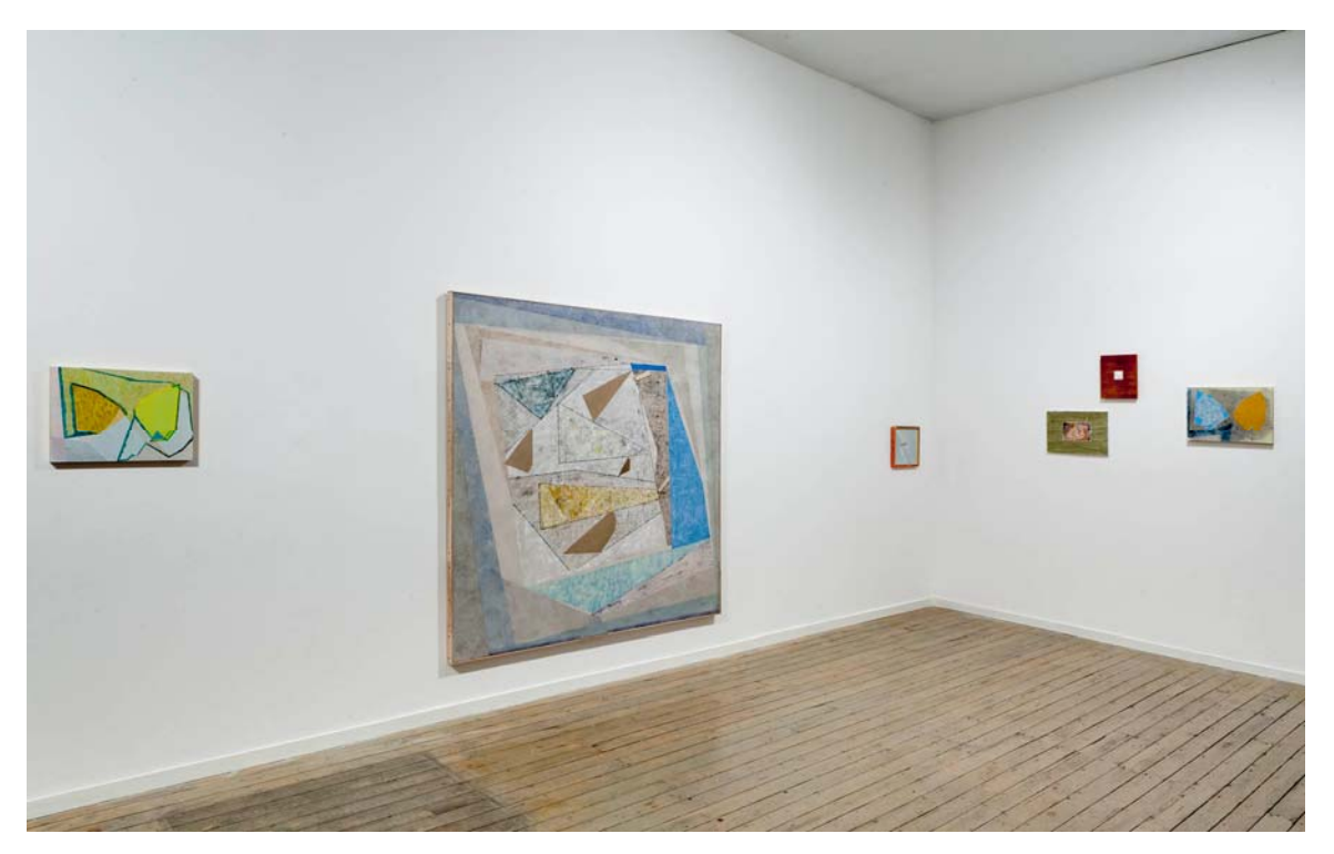
Patrick Howlett: How Hummingbirds Choose Flowers Installation view (upstairs)