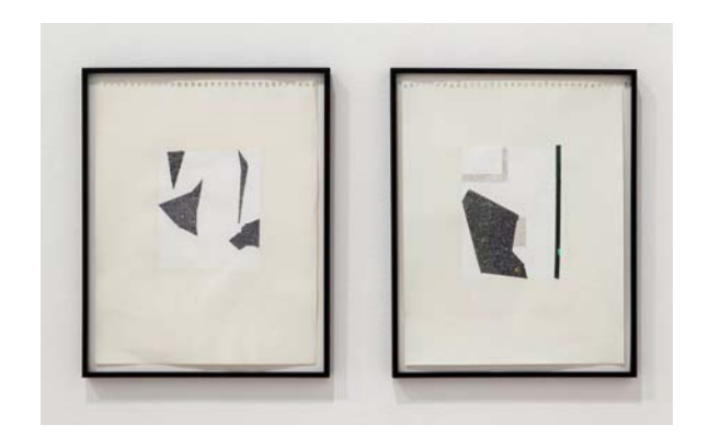
cut out 2010-11 egg tempera on tape on paper (left), egg tempera on tape, silverpoint on paper (right) 38.5 \times 30.75 \text{ cm} each