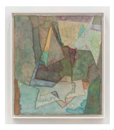
how hummingbirds choose flowers 2012 pencil, watercolour on linen, watercolour on wood 45.5\ x 38.5\ cm