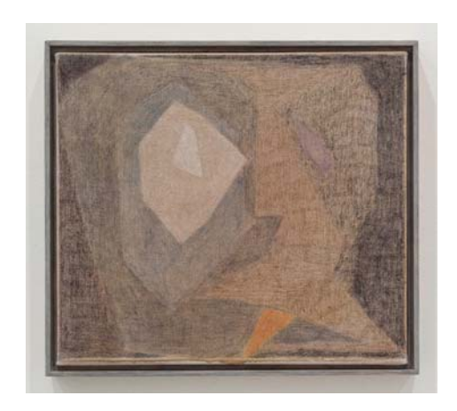
a kind of absurdity 2012 coloured pencil on linen, watercolour on wood 38.75 x 43 cm