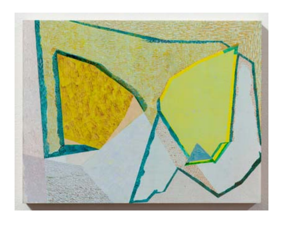
reaching out somewhere 2012 egg tempera and paint on masonite 33 x 43.25 cm