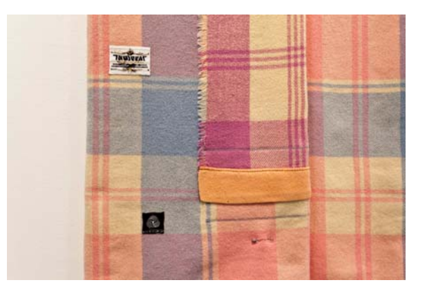
Liz Magor Eatonia , 2011 wool, fabric, metal, and thread 145 x 62 x 6 cm

Liz Magor Kenwood (salmon) , 2011 wool, fabric, plastic, and polymerized gypsum 116 x 54 x 13 cm