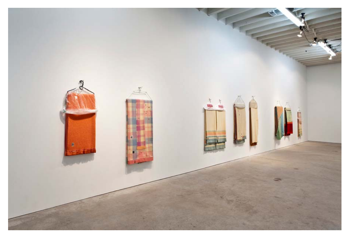
Liz Magor installation view at Susan Hobbs Gallery, 2011