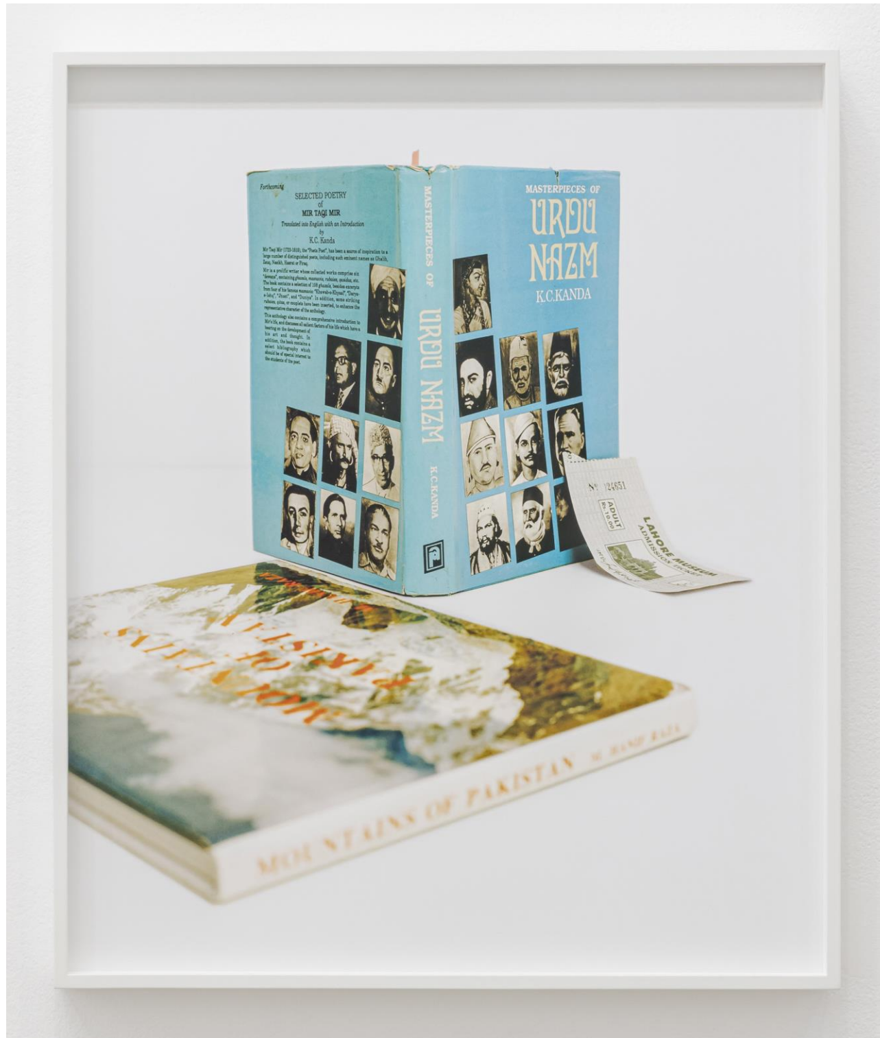
Zinnia Naqvi Masterpieces of Urdu Nazm , 1/5 2026 inkjet print 24 ½ x 20 ½ in. (62 x 52 cm)