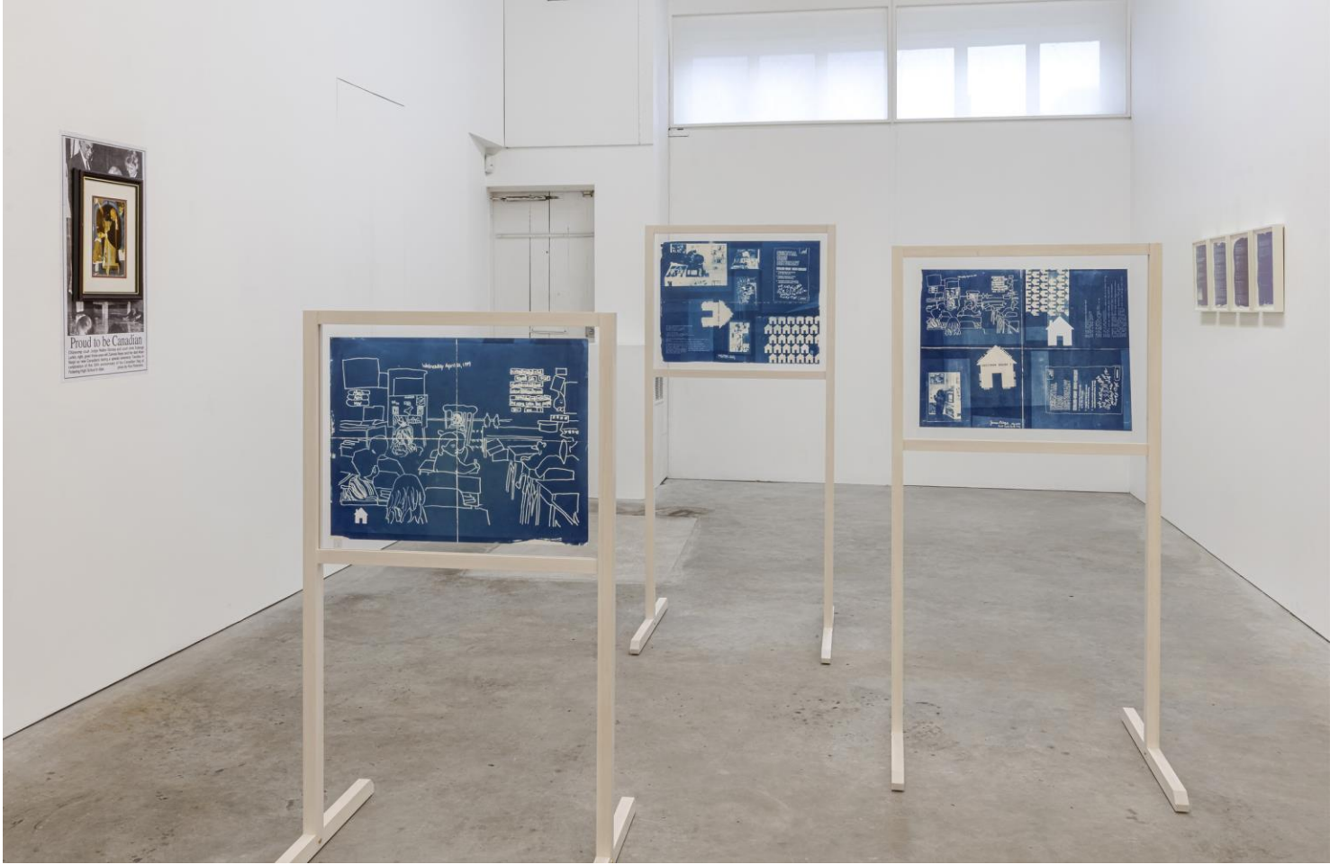
Zinnia Naqvi Island of Strangers installation view, 2026