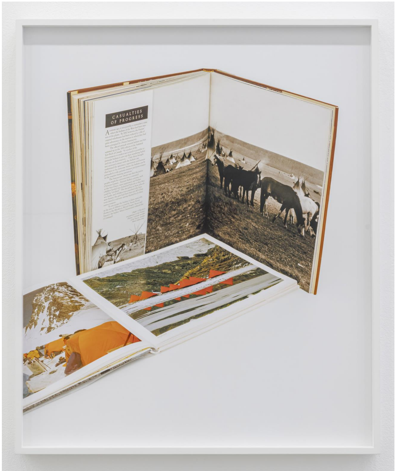
Zinnia Naqvi Casualties of Progress , 1/5 2026 inkjet print 24 ½ x 20 ½ in. (62 x 52 cm)