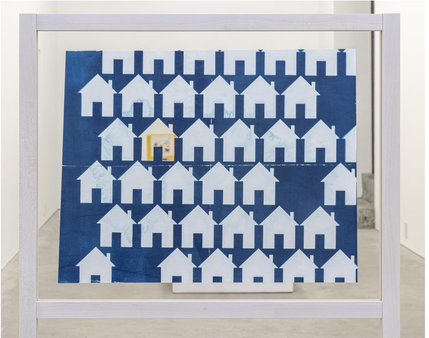
Zinnia Naqvi The girl looking towards the back, 2024 cyanotype on watercolour paper, custom wood stands 55 x 28 x 26 in. (138 x 71 x 66 cm)