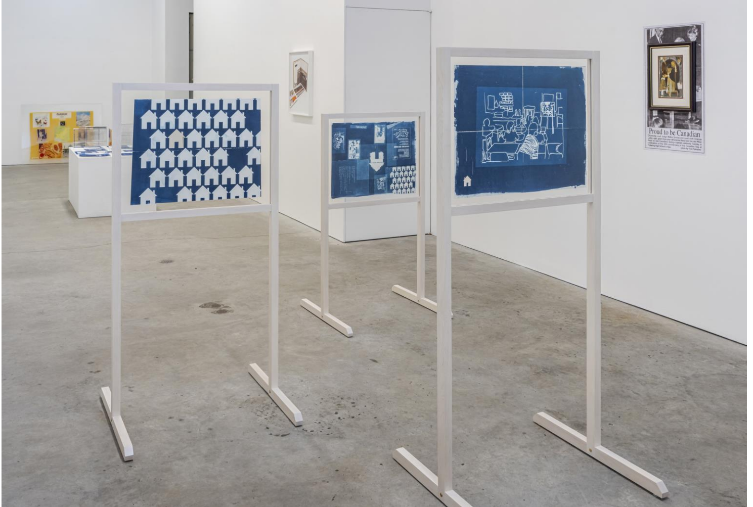
Zinnia Naqvi Island of Strangers installation view, 2026