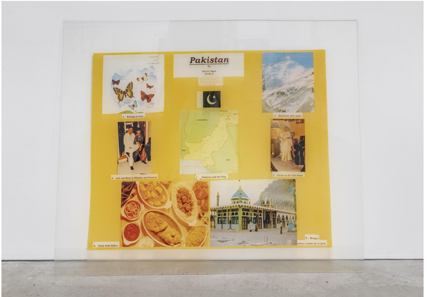
Zinnia Naqvi Pakistan and the Flag , 1999, 2026 UV print on plexi 38 ½ x 48 in. (98 x 122 cm)