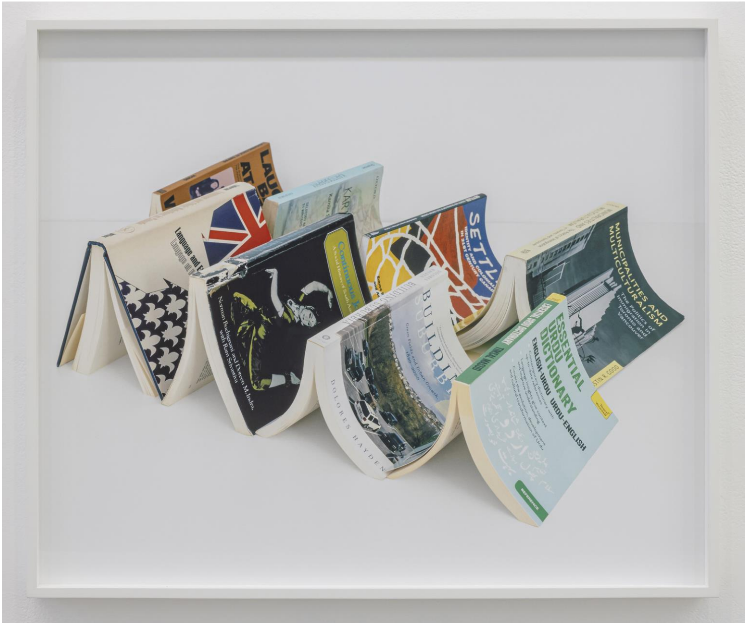
Zinnia Naqvi The Roof of the World, 1/5 2026 inkjet print 20 ½ x 24 ½ in. (52 x 62 cm)