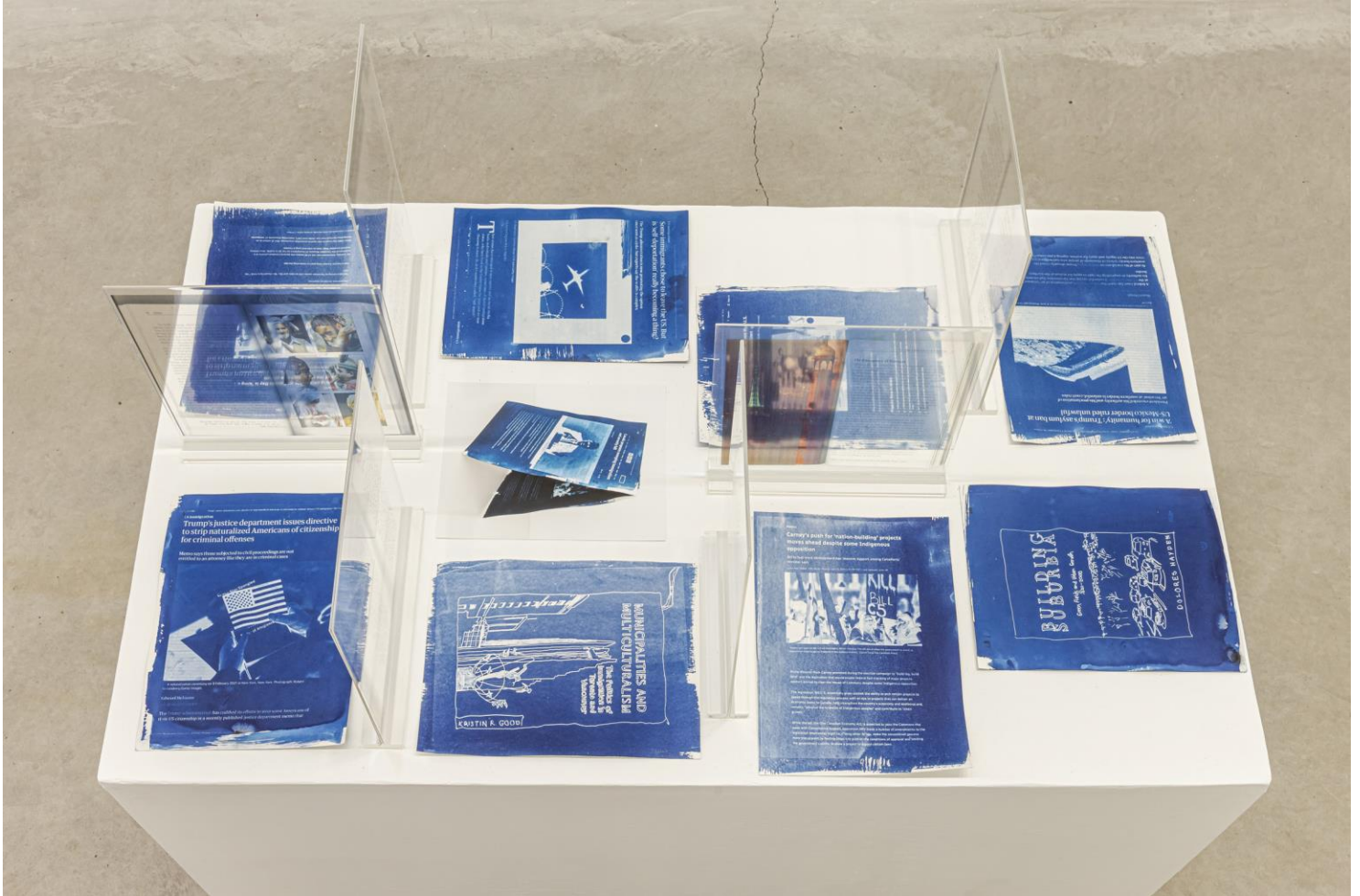
Zinnia Naqvi Studio Desk , 2026