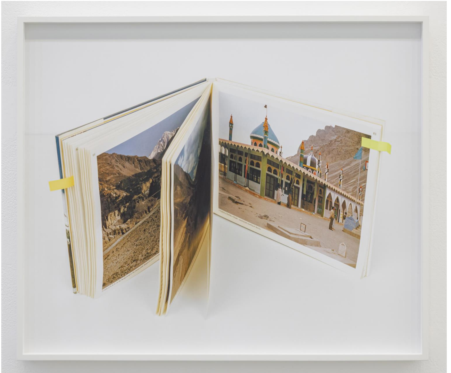
Zinnia Naqvi Mountains of Pakistan by M. Hanif Raza, 1/5 2026 inkjet print 20 ½ x 24 ½ in. (52 x 62 cm)