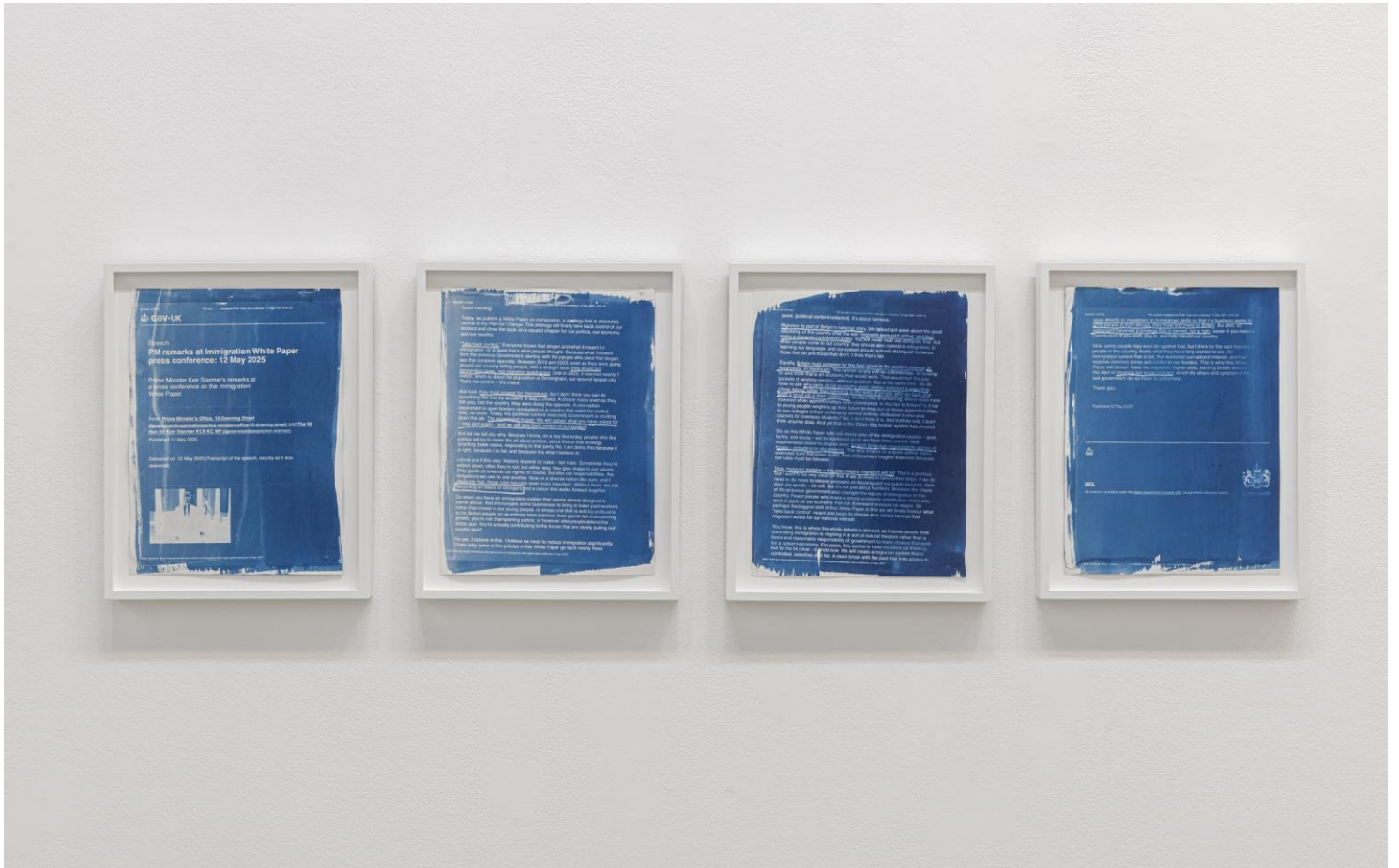
Zinnia Naqvi Transcript of Immigration White Paper press conference: 12 May 2025, 2026 cyanotypes on watercolour paper 14 x 50 in. (35.5 x 127 cm)