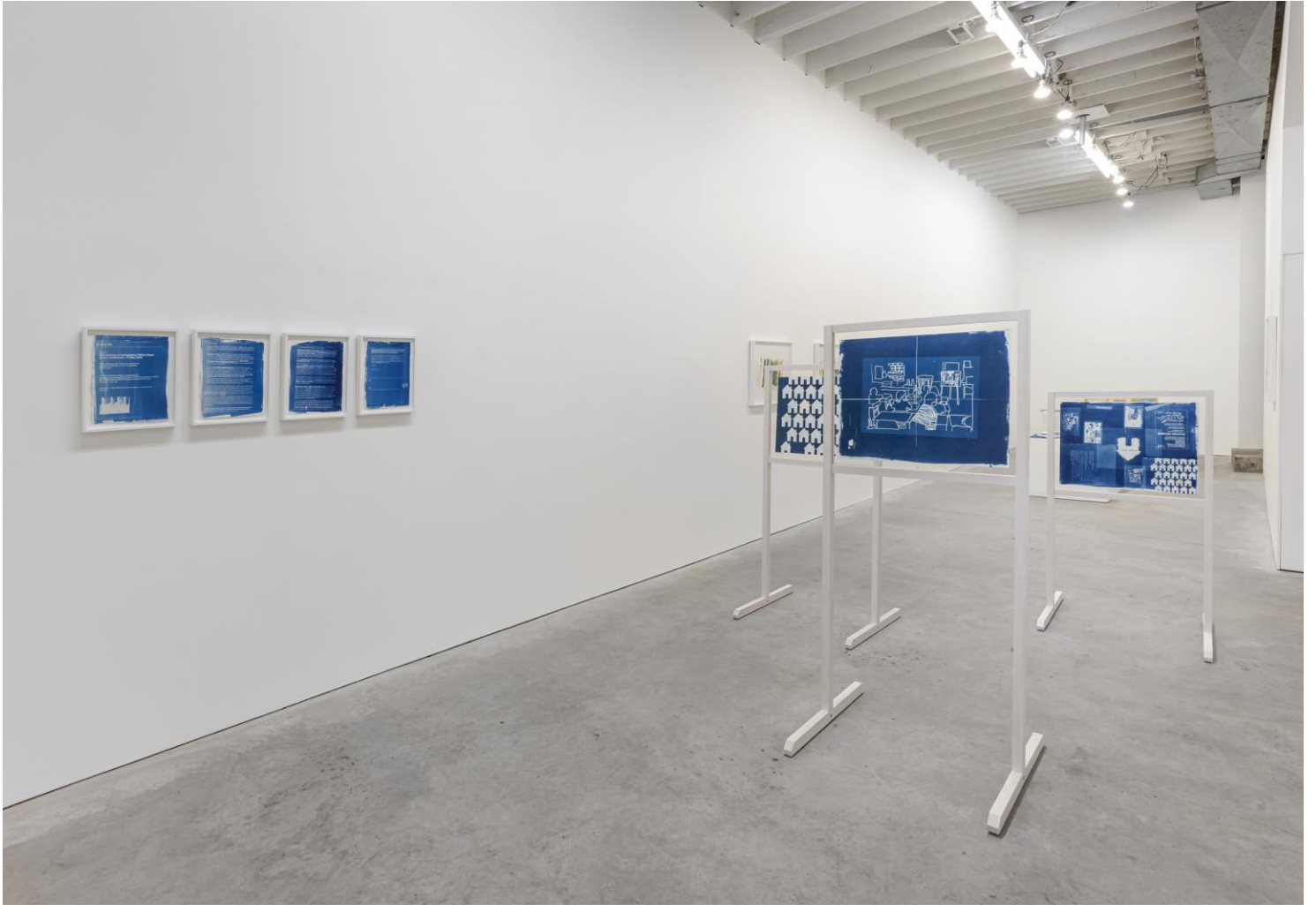
Zinnia Naqvi Island of Strangers installation view, 2026