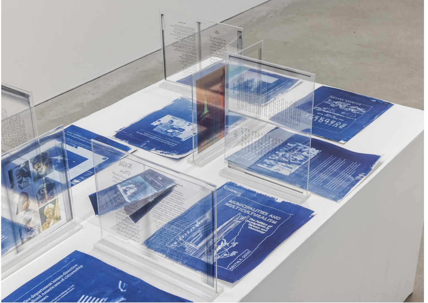
Zinnia Naqvi detail of Studio Desk , 2026