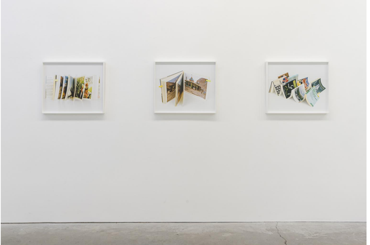
Zinnia Naqvi Island of Strangers installation view, 2026