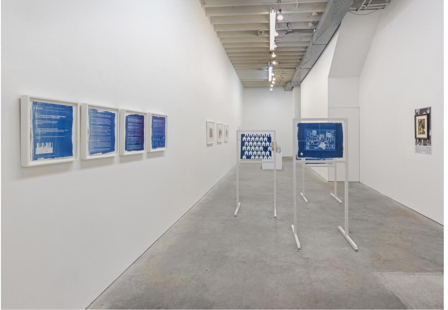
Zinnia Naqvi Island of Strangers installation view, 2026