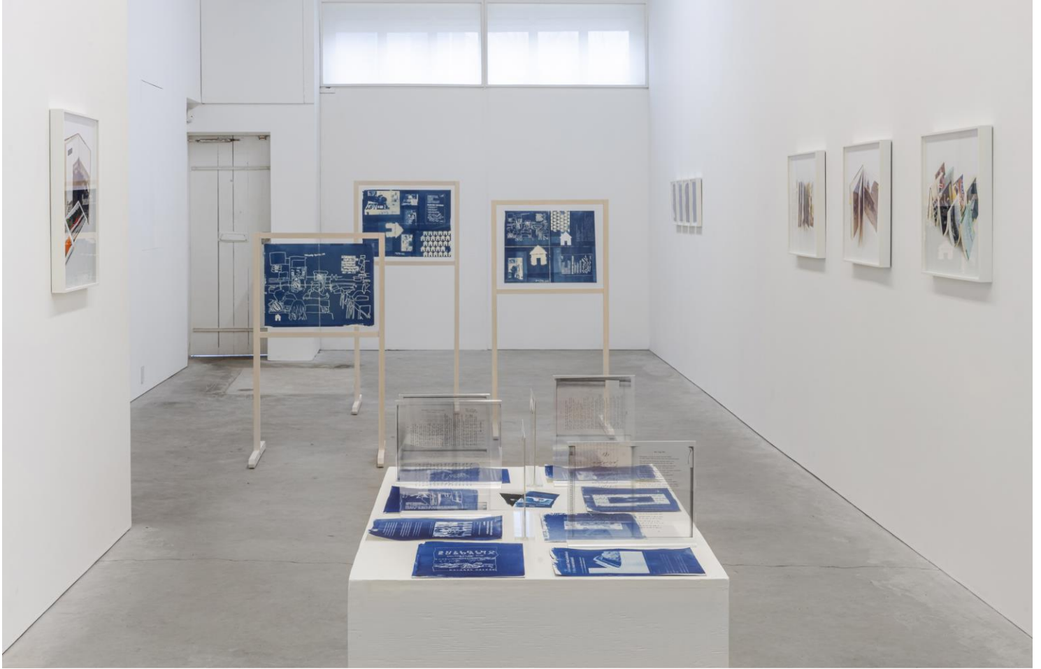
Zinnia Naqvi Island of Strangers installation view, 2026