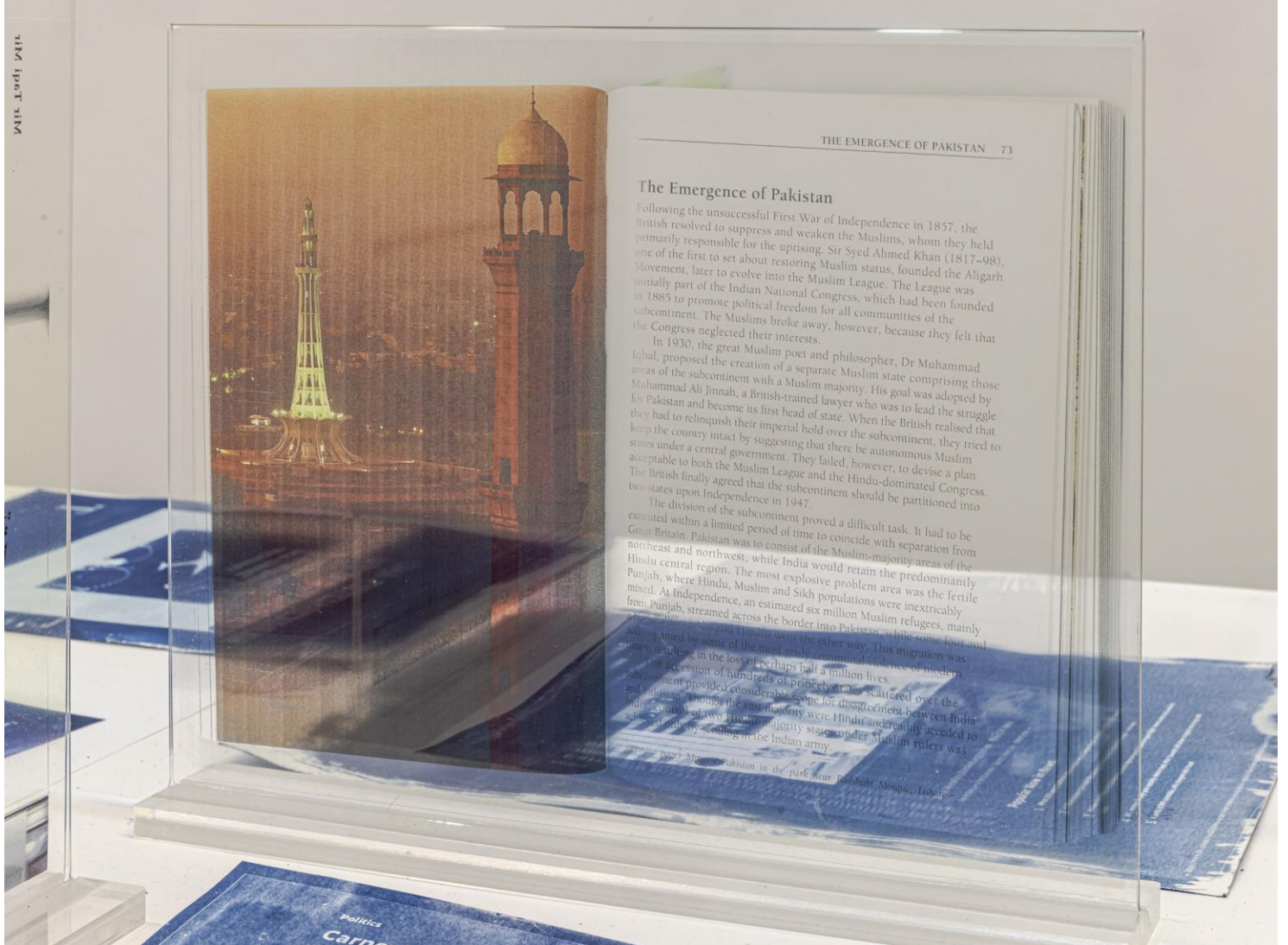
Zinnia Naqvi detail of Studio Desk , 2026