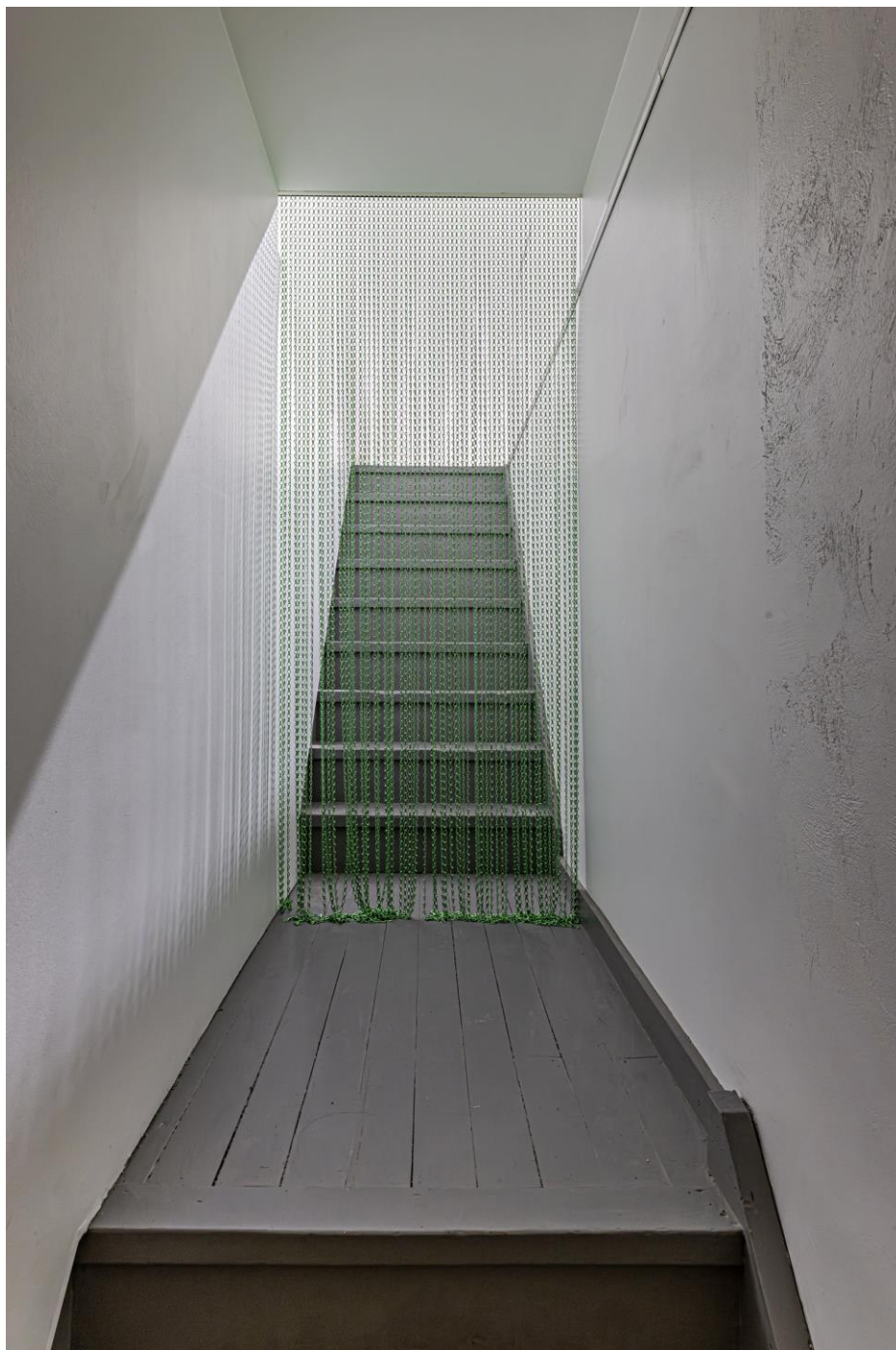
Jeremy Laing Emergence (Green) , 2025 anodized aluminum 80 ½ x 33 ½ x 4 ½ in. (204.5 x 85 x 11.5 cm)