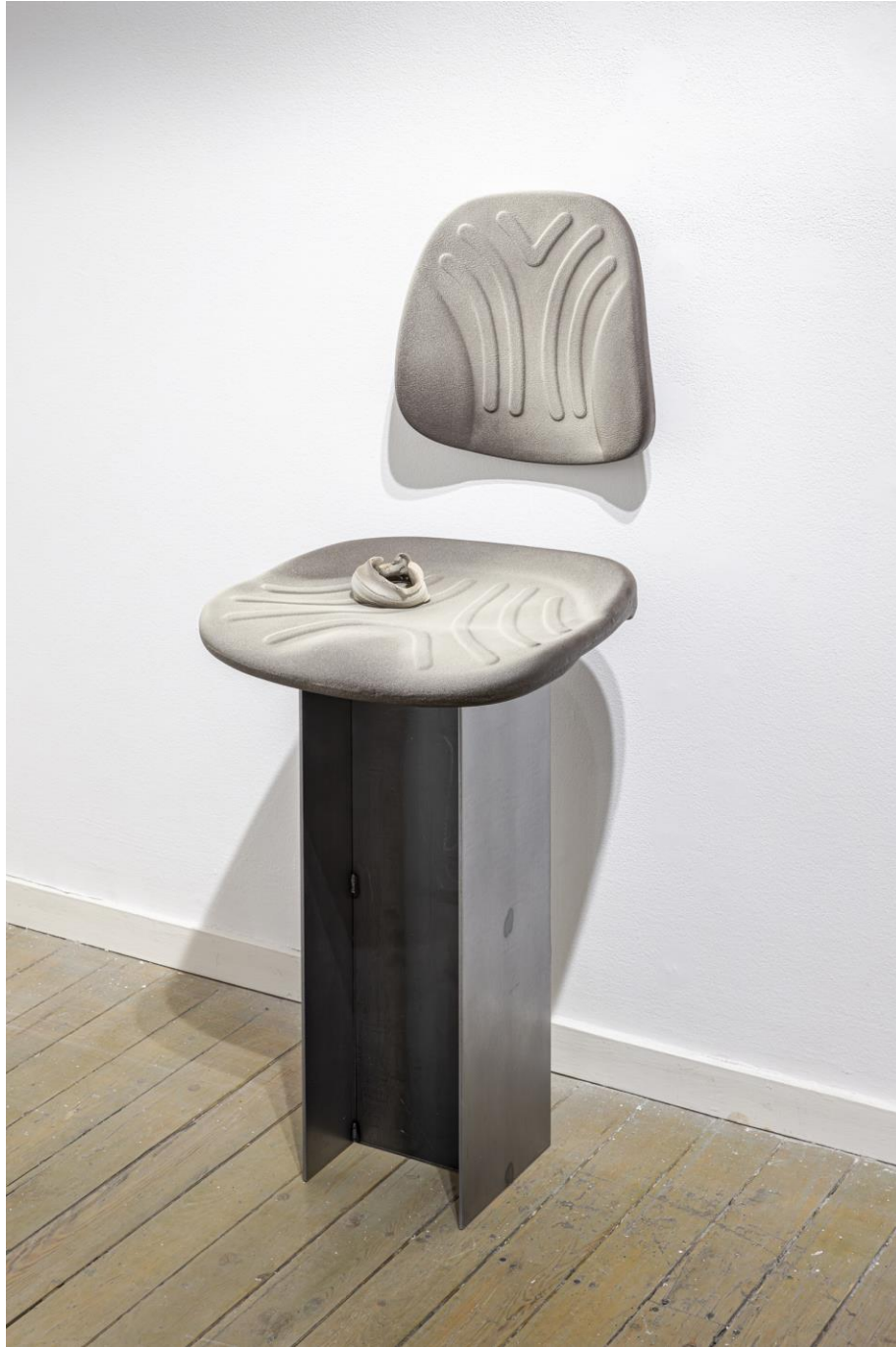
Jeremy Laing Mutuality (Seated Ghost) , 2025 pigmented engobe on stoneware, lacquered hot-rolled steel 43 x 17 ½ x 18 ½ in. (109 x 44.5 x 47 cm)