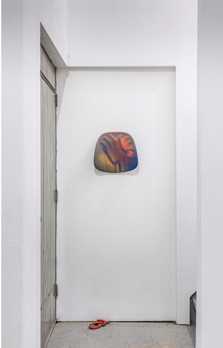
Jeremy Laing Mutuality (Fragments/Shadows) , 2025 pigmented engobe on stoneware seat: 12 ½ x 13 ½ x 3 ½ in. (32 x 34 x 9 cm) fragments: 2 x 7 x 5 in. (5 x 18 x 13 cm)