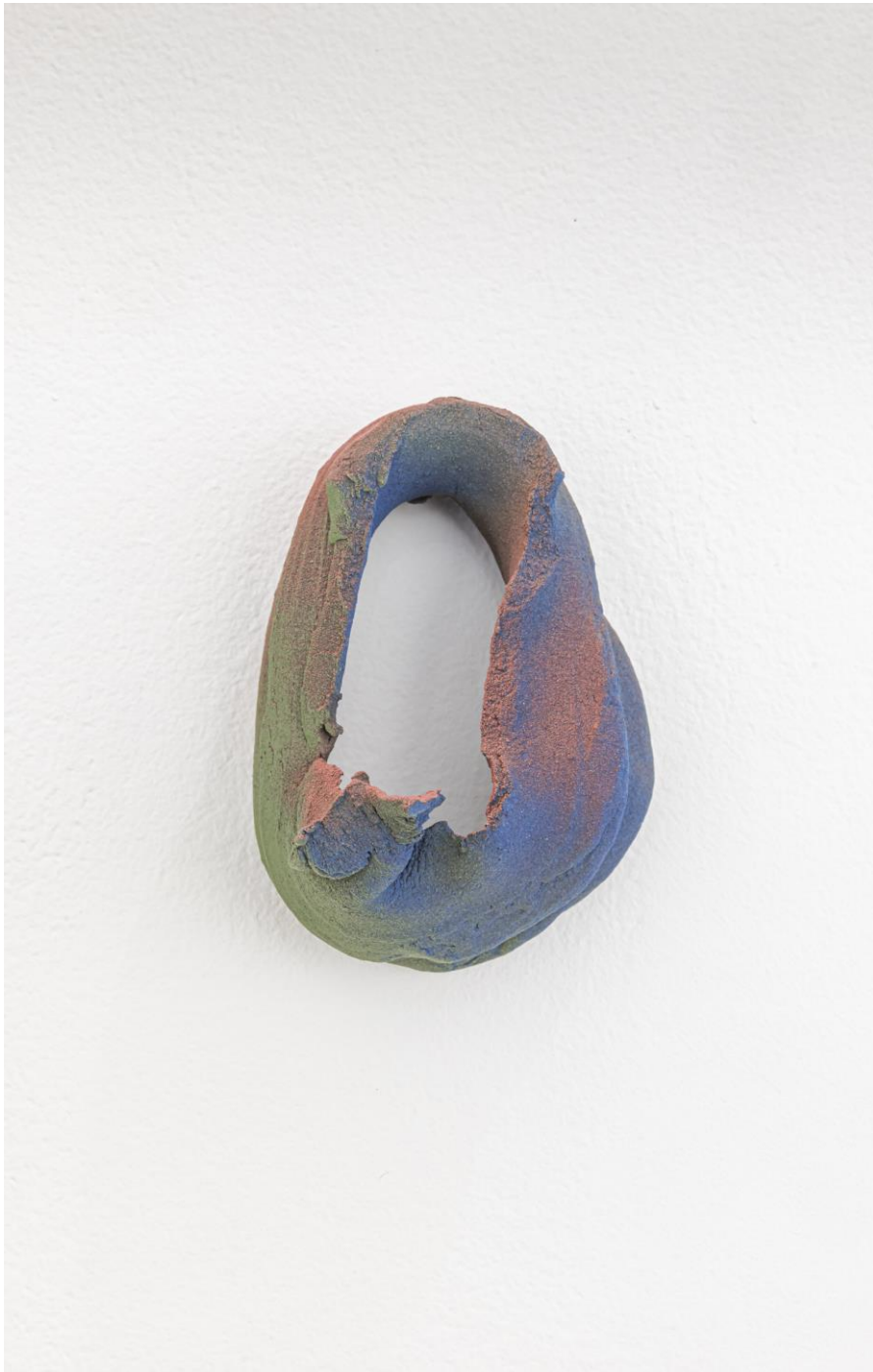
Jeremy Laing Agape (RGB) , 2025 pigmented engobe on stoneware 4 ½ x 3 ½ x 3 in. (11.5 x 9 x 7.5 cm)