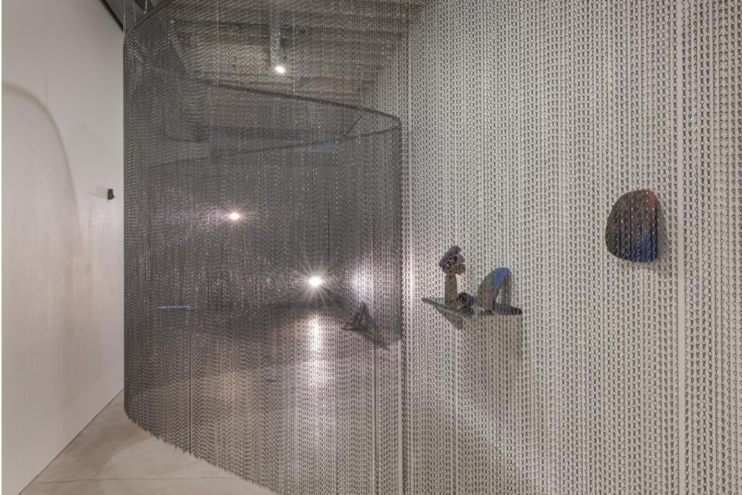
Jeremy Laing Mutuality installation view, 2025