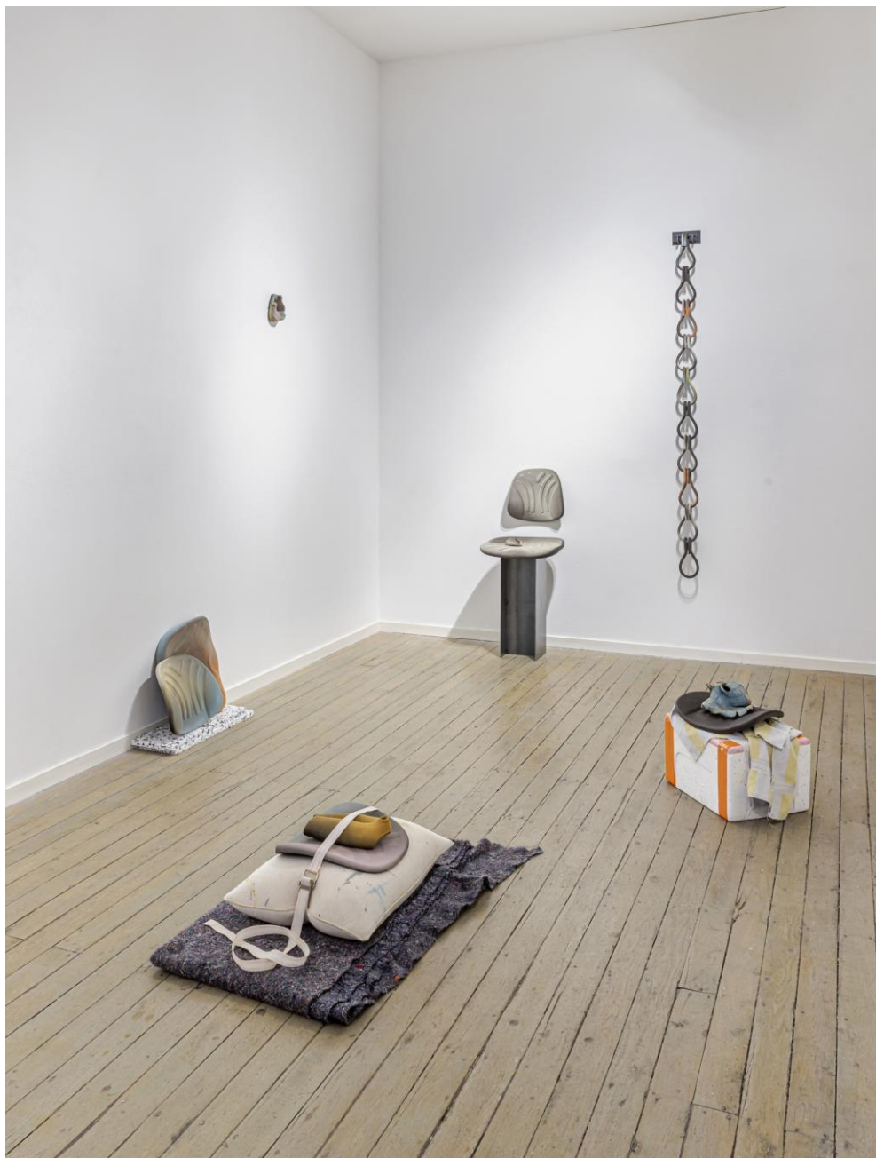
Jeremy Laing Mutuality installation view, 2025