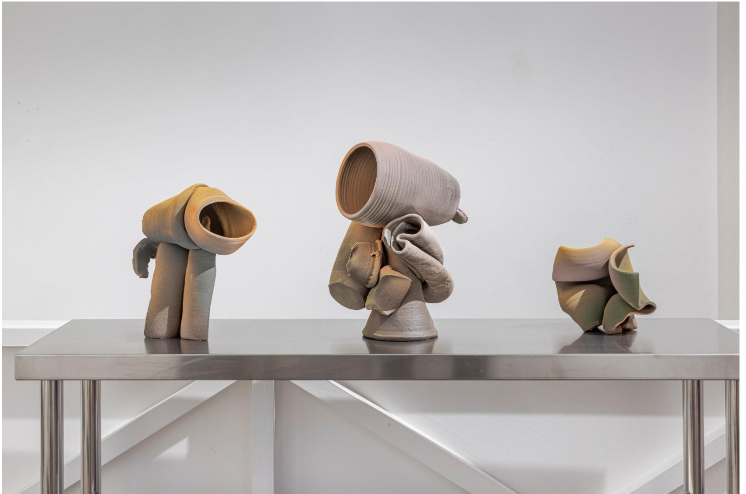
Jeremy Laing Sighting Device , 2025 pigmented engobe on stoneware 10 ½ x 9 x 8 in. (26.5 x 23 x 20 cm)