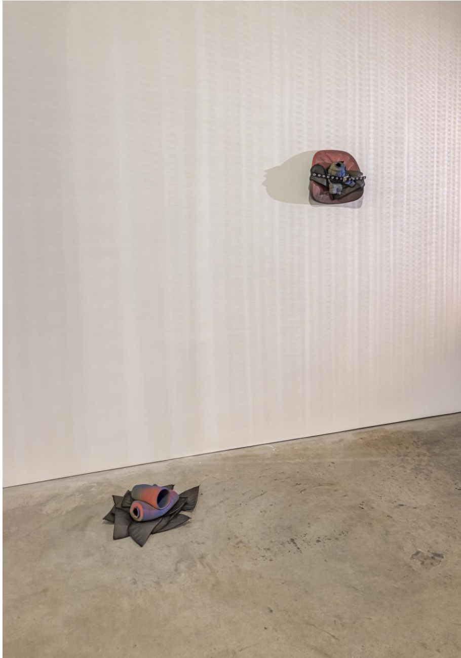
Jeremy Laing Mutuality (Slump) , 2025 pigmented engobe on stoneware, deadstock shoulder pads 6 x 17 x 15 in. (15 x 43 x 38 cm)