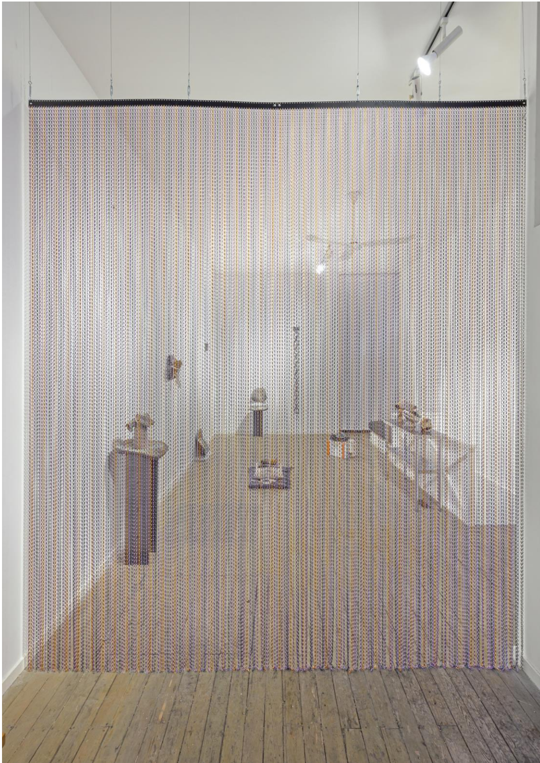
Jeremy Laing Emergence (Striped) , 2025 anodized aluminum, airplane cable, ferrules, turnbuckles, hooks 121 x 105 x ½ in. (307 x 267 x 1 cm)