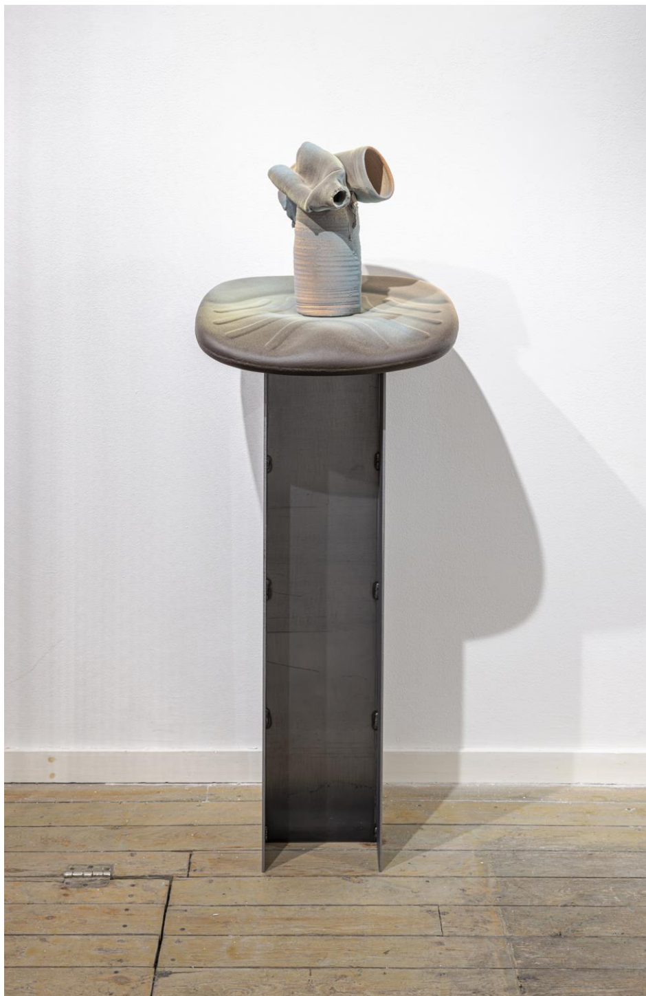
Jeremy Laing Mutuality (Platform) , 2025 pigmented engobe on stoneware, lacquered hot-rolled steel 50 x 17 ½ x 15 ½ in. (127 x 44.5 x 39 cm)