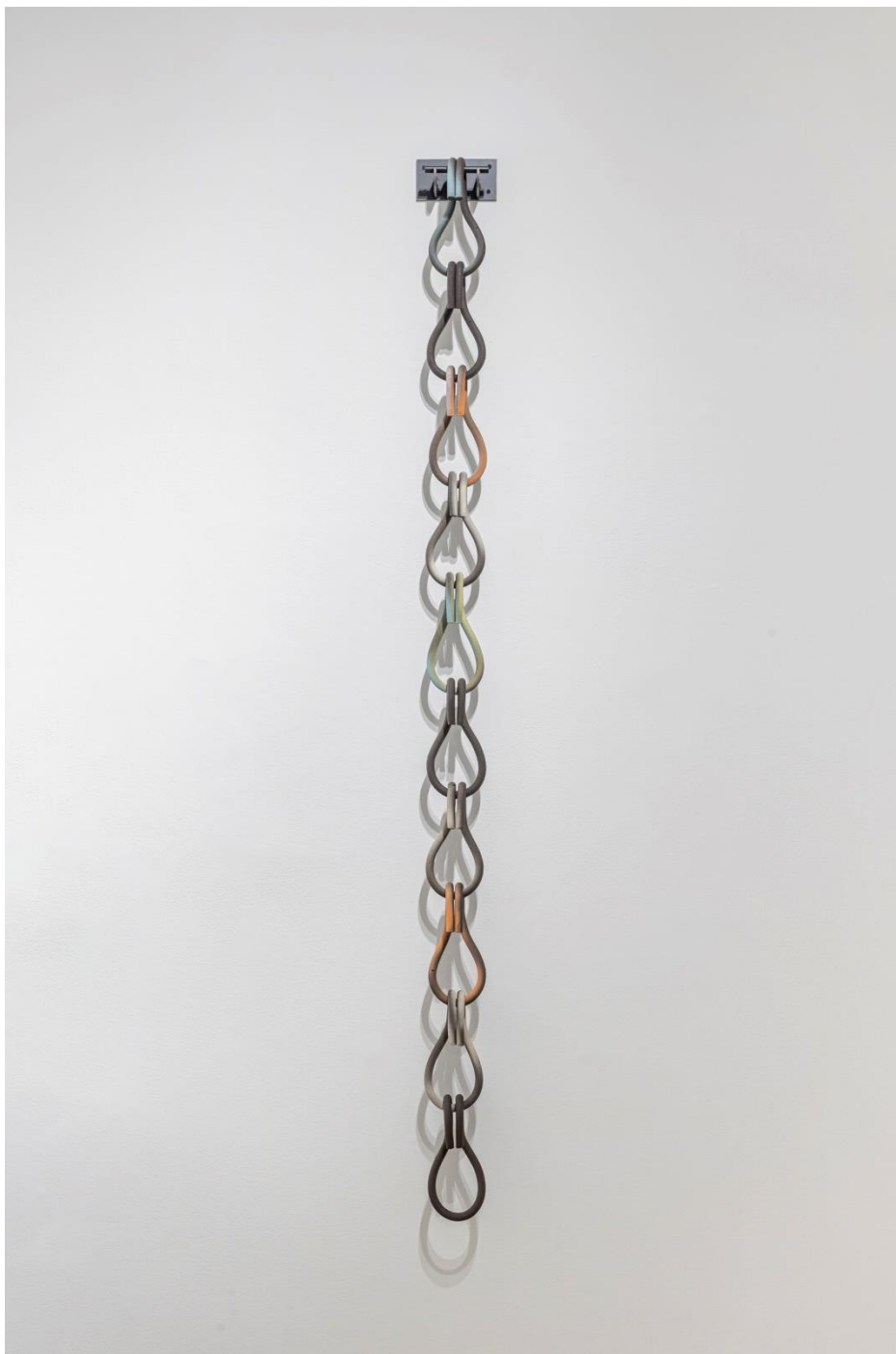
Jeremy Laing Mutuality (Holding and Being Held) , 2025 pigmented engobe on stoneware, lacquered hot-rolled steel 79 x 7 x 3 ½ in. (200.5 x 18 x 9 cm)