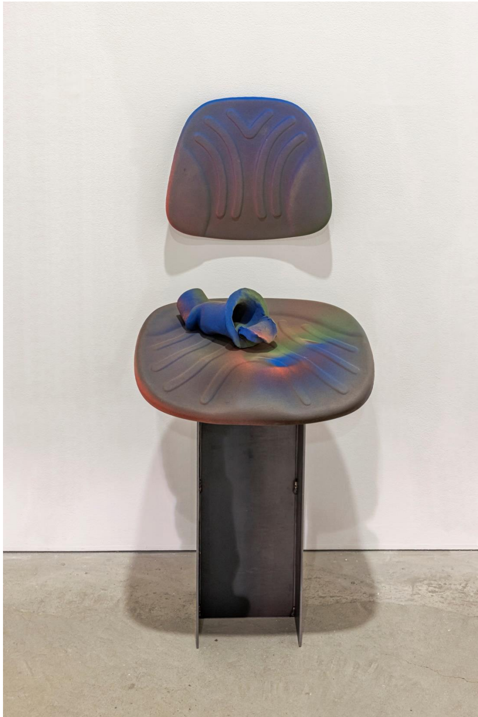
Jeremy Laing Mutuality (Seated RGB) , 2025 pigmented engobe on stoneware, hot-rolled steel 43 ½ x 17 ½ x 19 in. (110.5 x 44.5 x 48 cm)