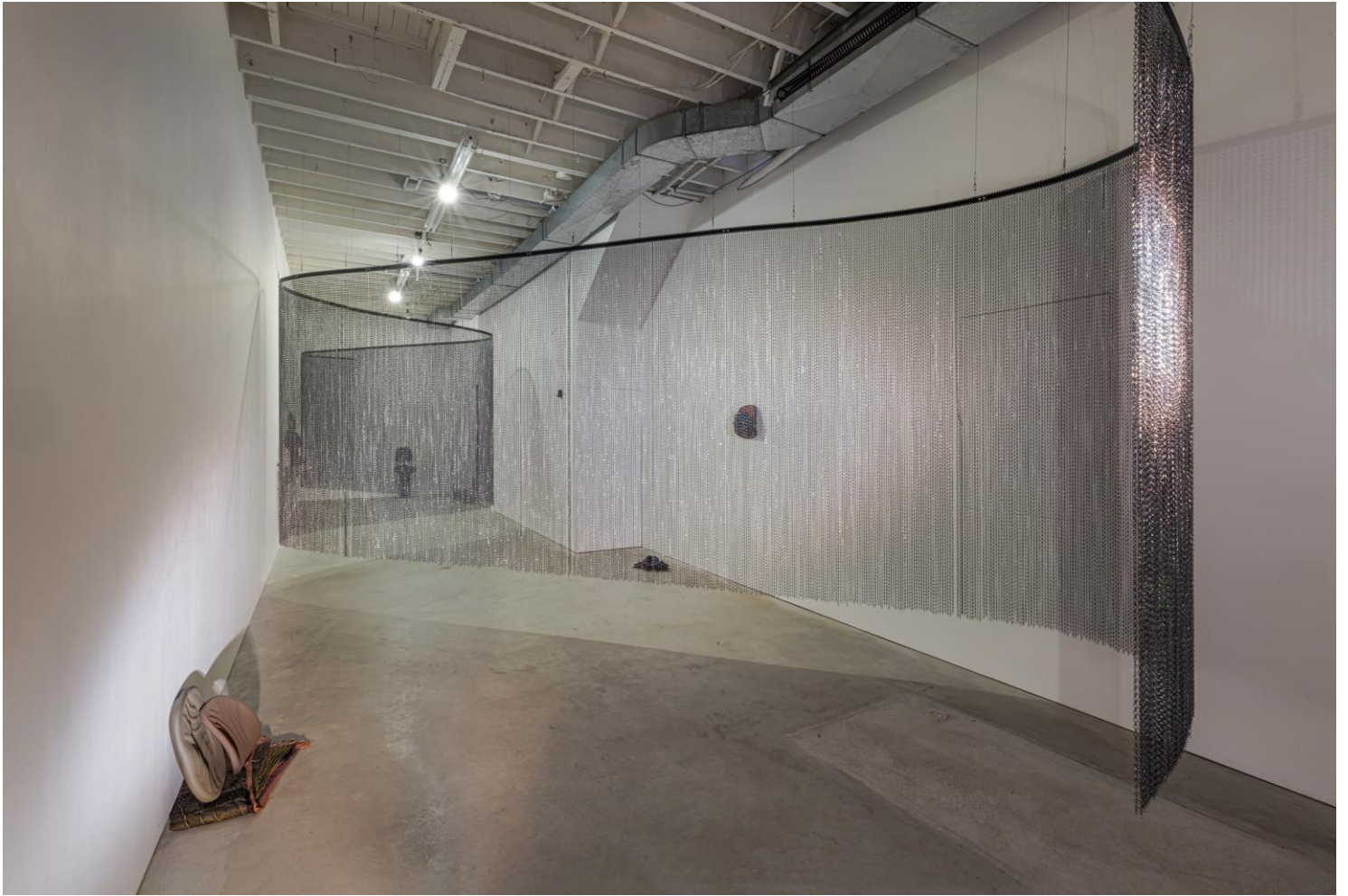
Jeremy Laing Mutuality installation view, 2025

Emergence (Squiggle) , 2025 anodized aluminum, airplane cable, ferrules, turnbuckles, hooks, theatre lights, boom plates and stands, extension cord, power bar dimensions variable