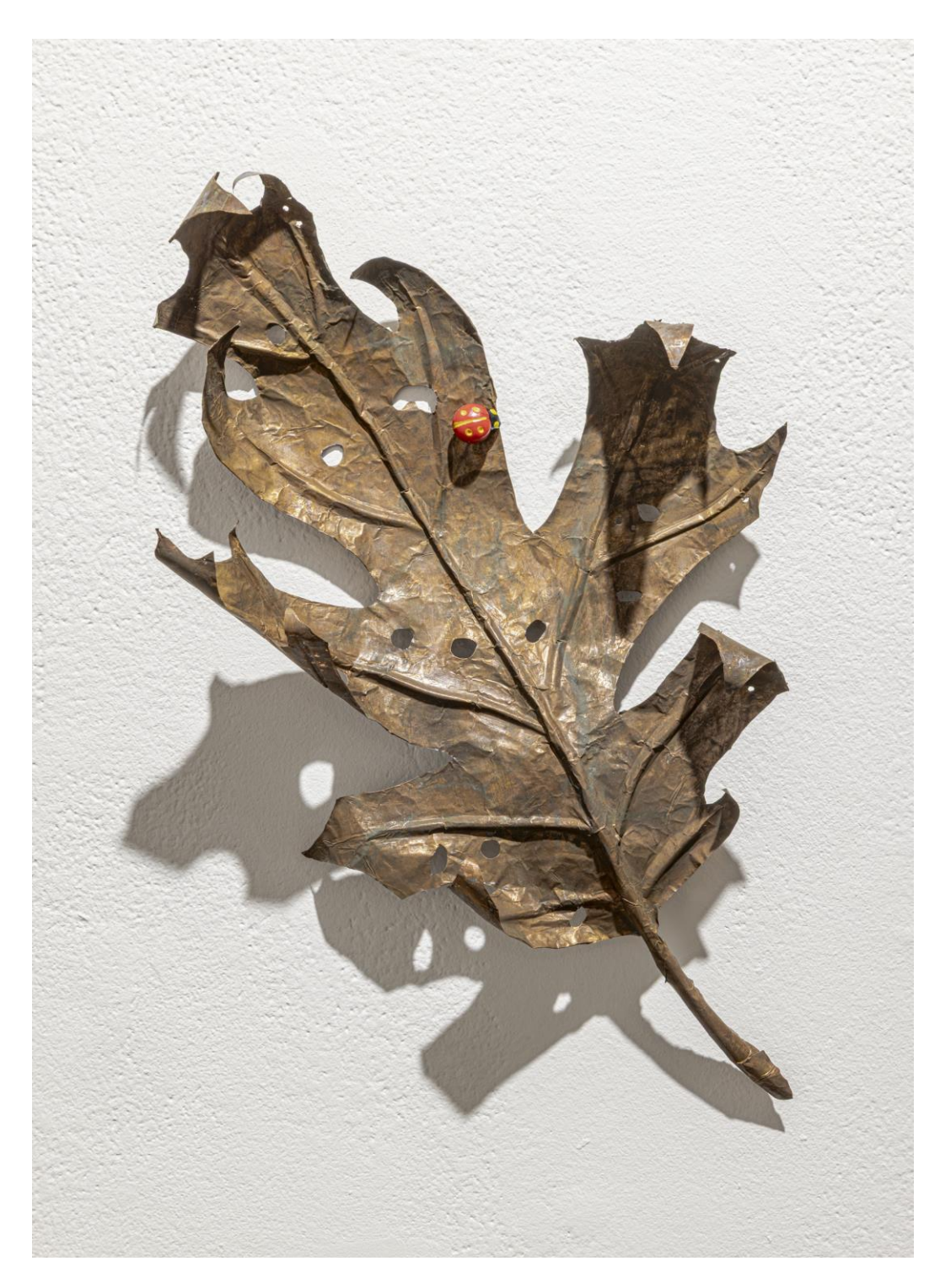
Rhonda Weppler and Trevor Mahovsky Against the Wind, 2025 copper foil, found object 10 \frac{1}{2} \times 8 \times 3 in. (26.5 x 20 x 7.5 cm)