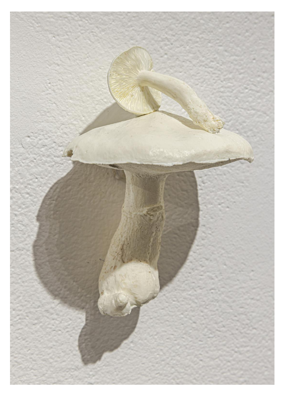
Rhonda Weppler and Trevor Mahovsky Soft Landing 5, 2024