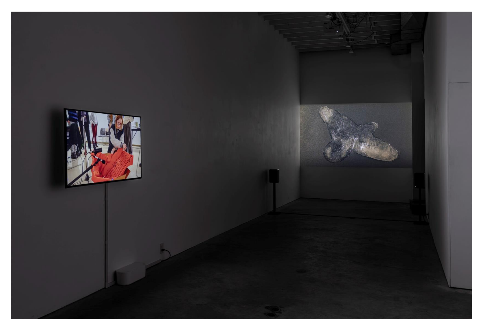
Rhonda Weppler and Trevor Mahovsky Passing Resemblance installation view