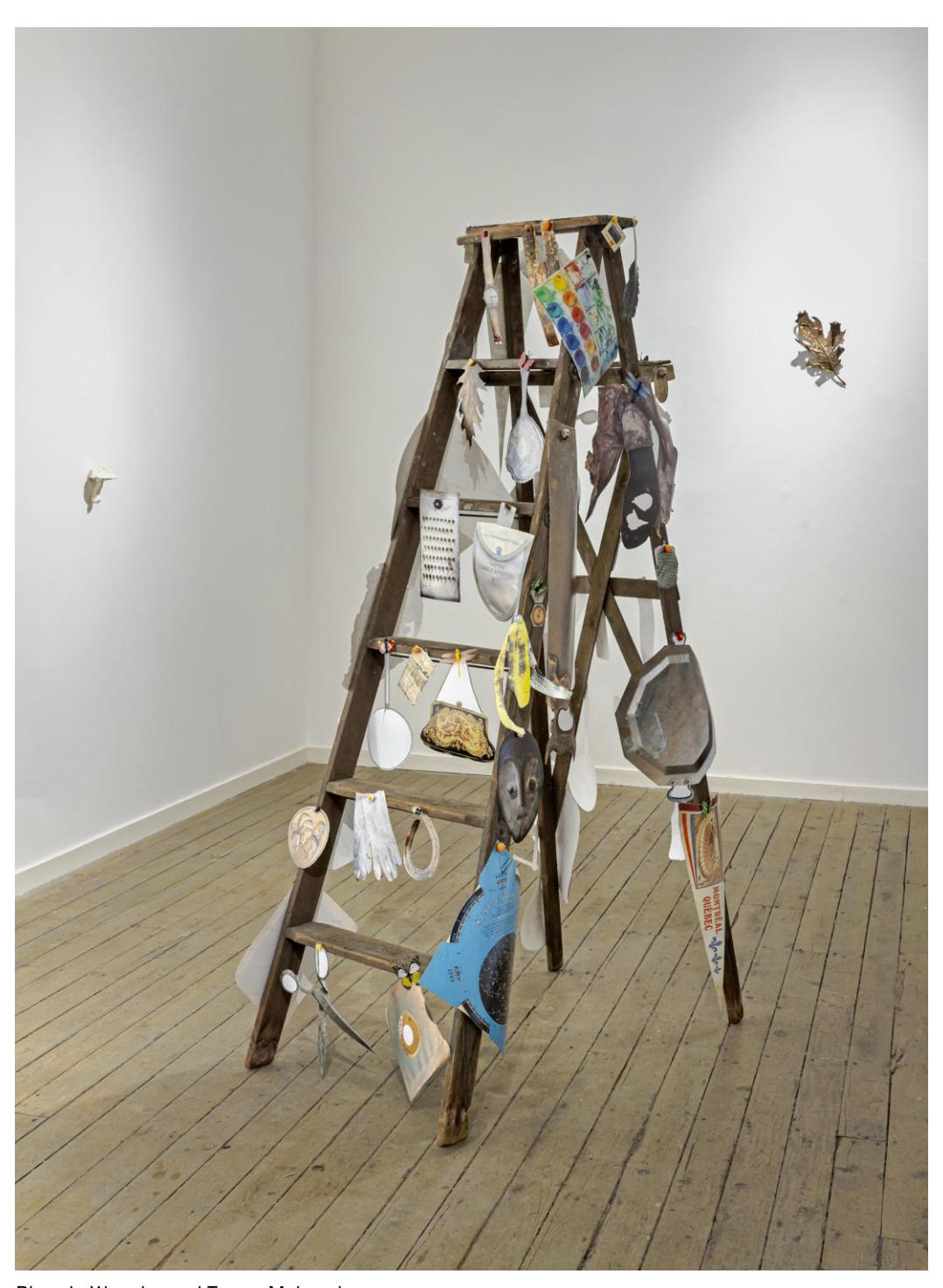
Rhonda Weppler and Trevor Mahovsky Rack, 2025 found objects, photographs 68\frac{1}{2} \times 41 \times 21\frac{1}{2} in. (174 x 104 x 54.5 cm)