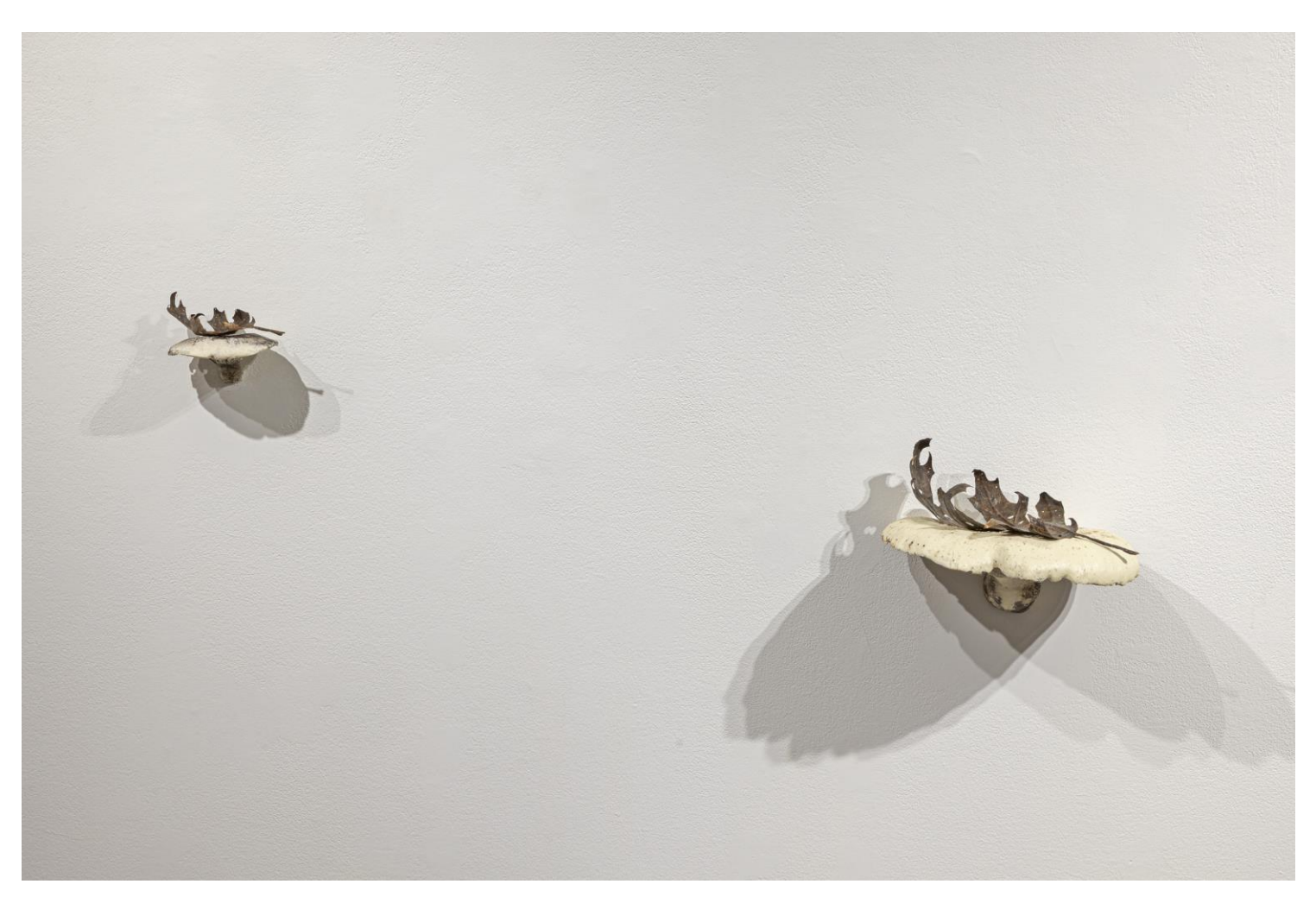
Rhonda Weppler and Trevor Mahovsky Mushroom does not know that leaf is sticking on it. Leaf does not know that it is on mushroom., 2025 copper foil, plastic resin installed: 53 \frac{1}{2} \times 47 \times 9 \frac{1}{4} in. (136 x 119.5 x 23.5 cm)