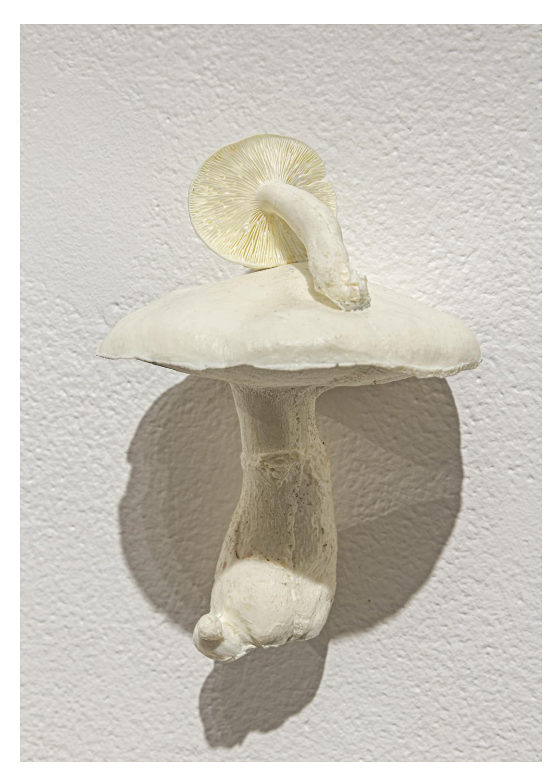
Rhonda Weppler and Trevor Mahovsky Soft Landing 5, 2024 plastic resin 5 \times 3 \frac{1}{2} \times 3 \frac{1}{4} in. (12.5 x 9 x 8 cm)