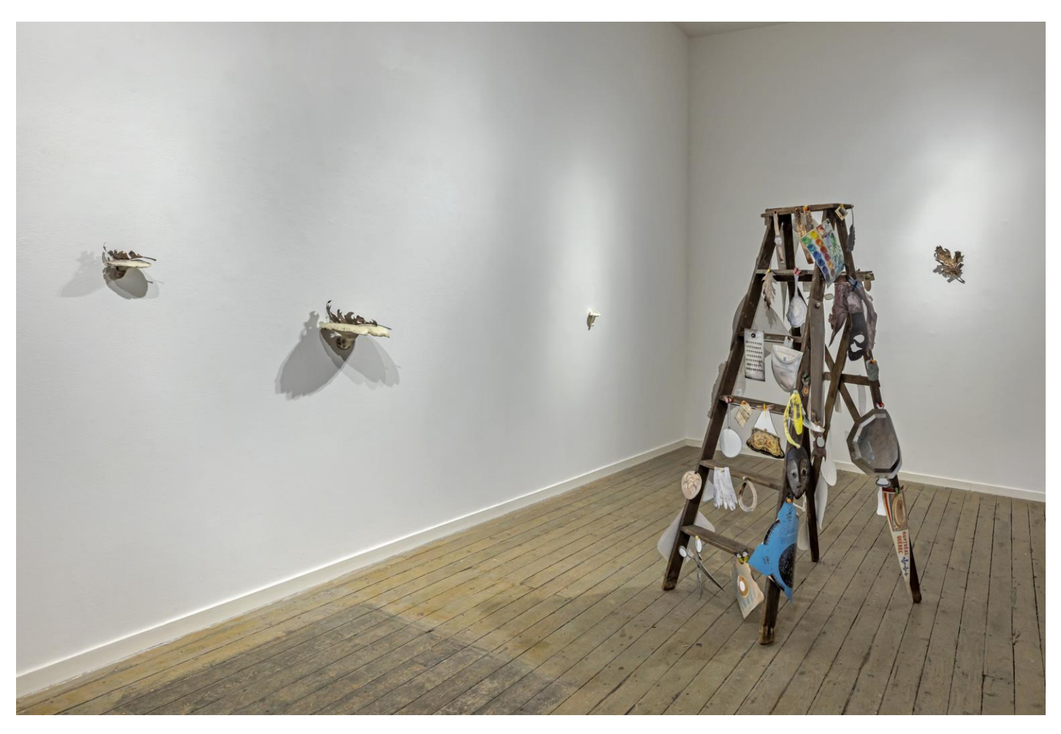
Rhonda Weppler and Trevor Mahovksy installation view