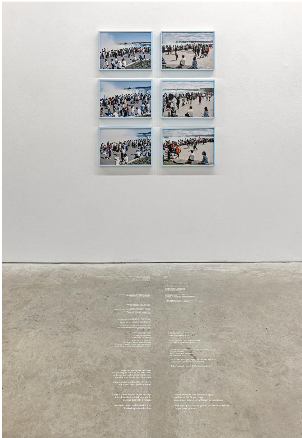
Zinnia Naqvi Another Desi with a camera, 1/3 2020 inkjet prints, adhesive vinyl 191.5 x 102 x 142 cm