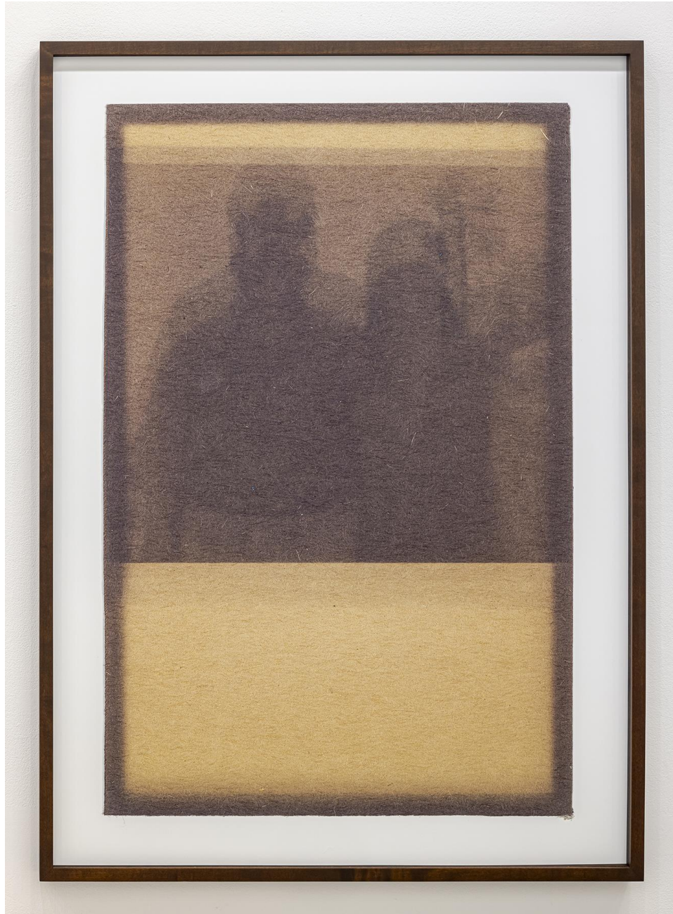
Zinnia Naqvi Solar Impression 1, 1/3 2024 inkjet print 146 x 105 cm