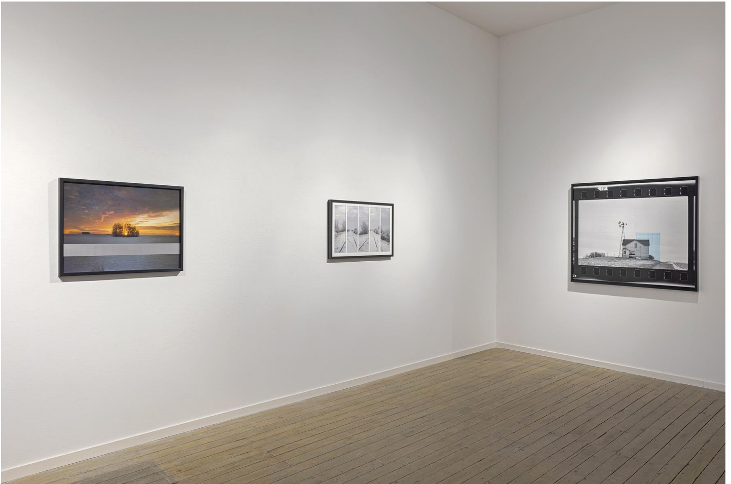
Althea Thauberger the pilgrim is always in danger of becoming a tourist installation view, 2024