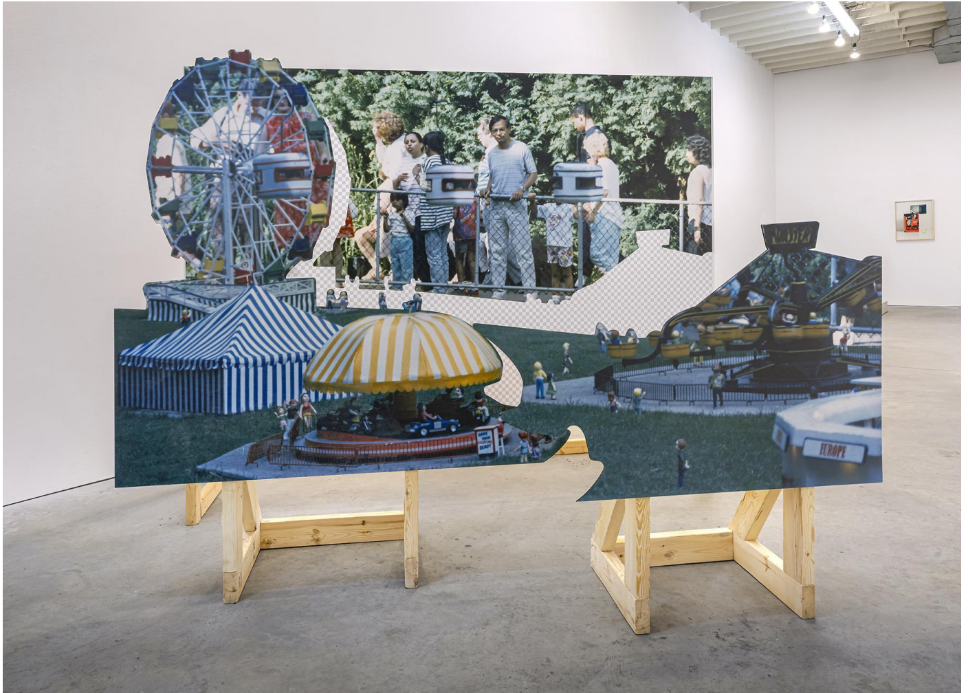
Zinnia Naqvi On Being Included , 2024 inkjet print mounted on plywood, UV prints, plywood 165.5 x 203 x 172.5 cm