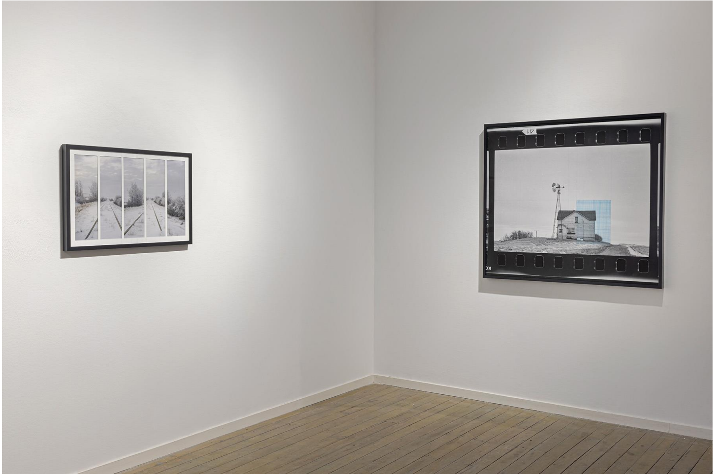
Althea Thauberger the pilgrim is always in danger of becoming a tourist installation view, 2024