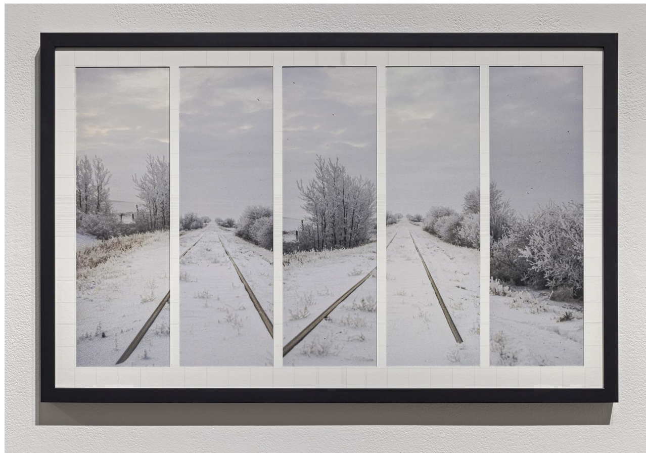
Althea Thauberger Railway crossing at the village of Holdfast, photographed by Althea and John Thauberger, December 1982., 1/5 2024 two collaged inkjet prints, pencil on matboard 49.5 x 77.5 cm