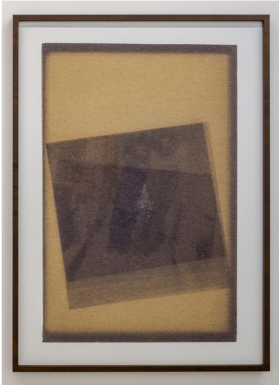
Zinnia Naqvi Solar Impression 2, 1/3 2024 inkjet print 146 x 105 cm