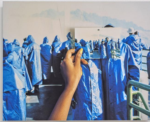
Zinnia Naqvi Continuous Journey , 1/5 2019 A Border Passage , 1/5 2019 inkjet prints mounted on Dibond 61 x 76 cm/each