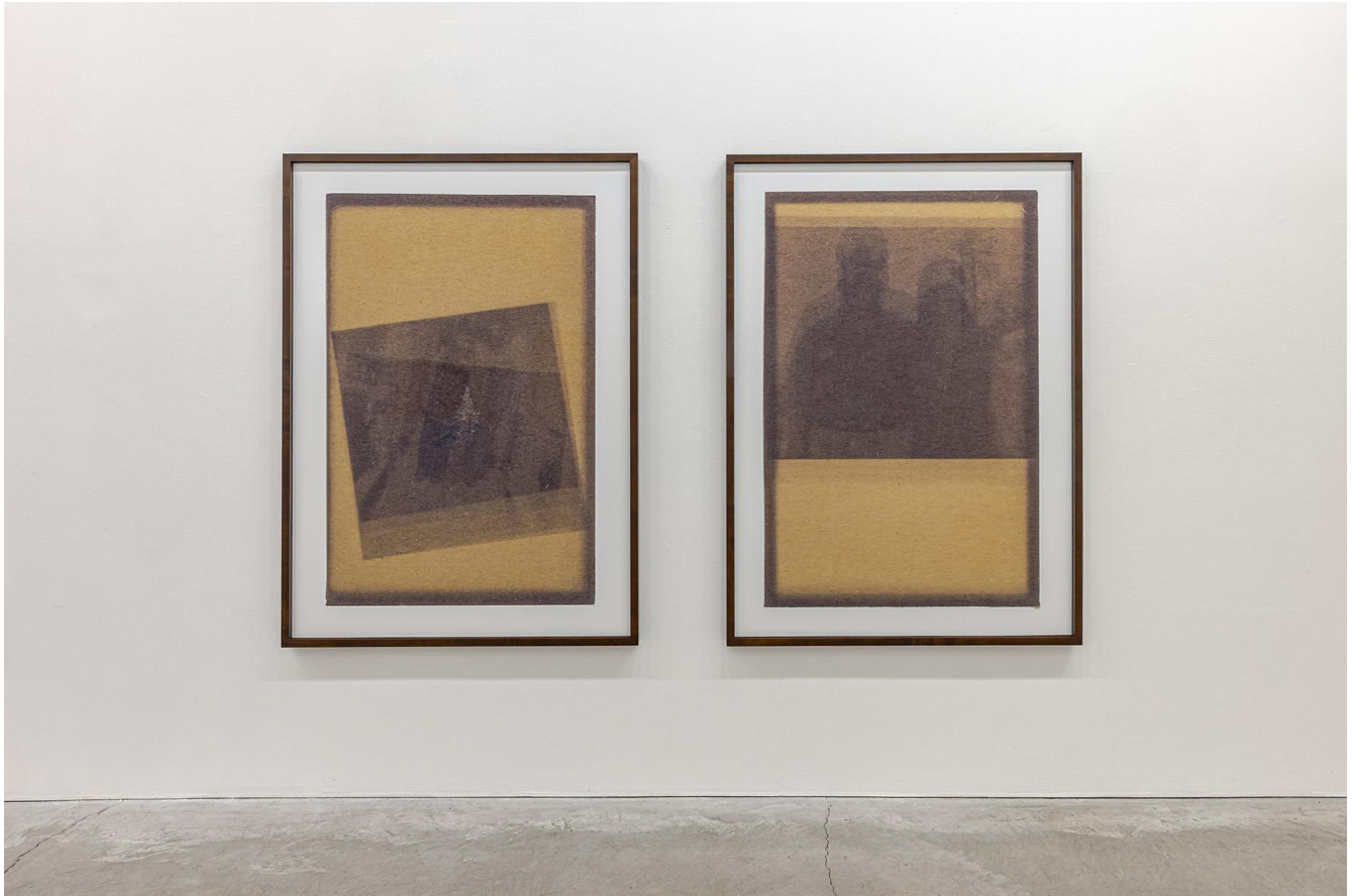
Zinnia Naqvi Solar Impression 2, 1/3 2024 Solar Impression 1, 1/3 2024 inkjet prints