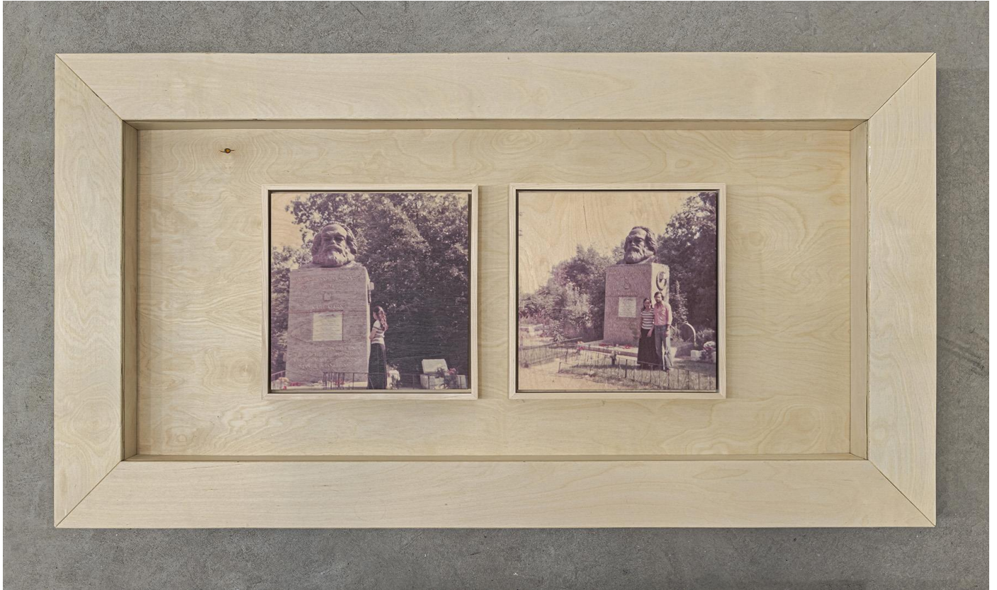
Zinnia Naqvi Qabar, 2024 inkjet prints on plywood, plywood 16 x 132 x 71 cm