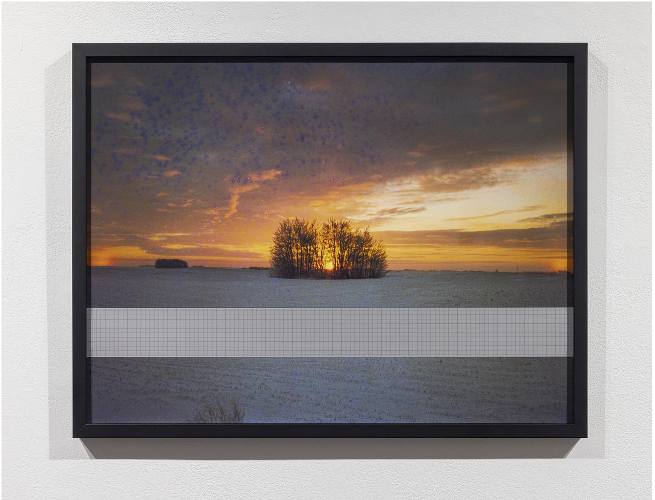
Althea Thauberger Sunrise in Field near the village of Holdfast, photographed by Althea Thauberger, while being instructed by John Thauberger, December 1982., 1/5 2024 two collaged inkjet prints 56 x 73.5 cm