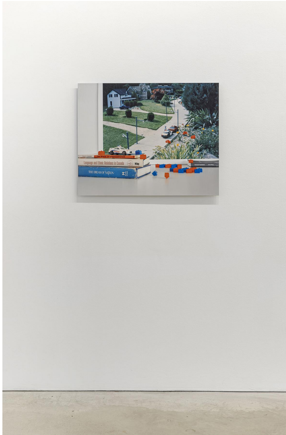
Zinnia Naqvi The Border Guards Were Friendly, 2/5 2019 inkjet print mounted on Dibond 61 x 76 cm