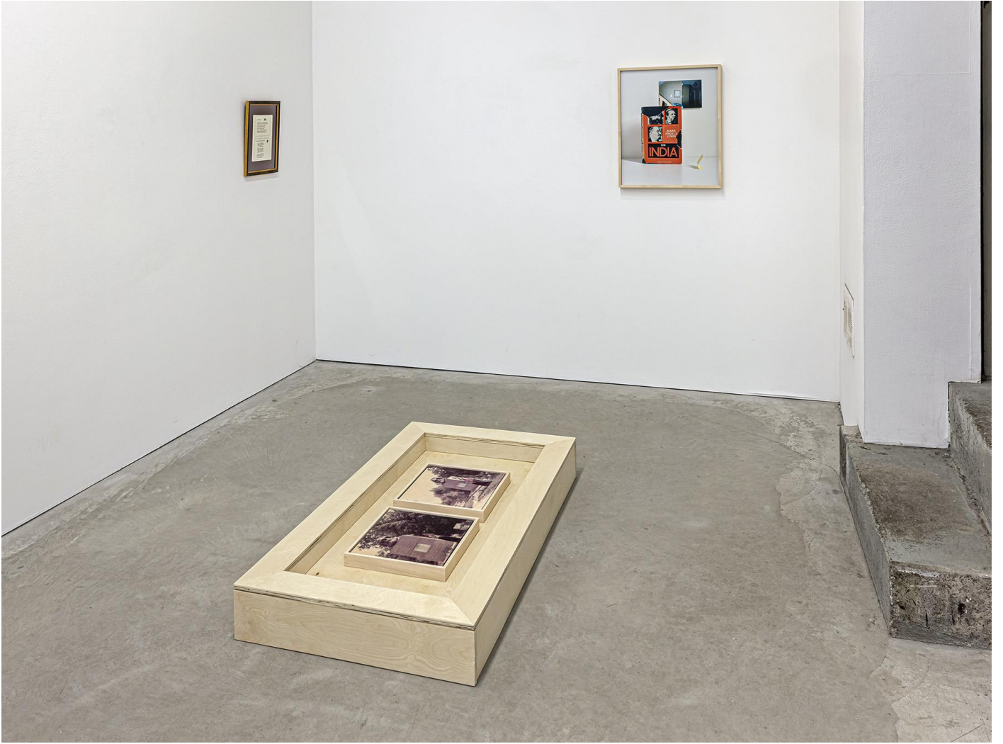
Zinnia Naqvi the pilgrim is always in danger of becoming a tourist installation view, 2024