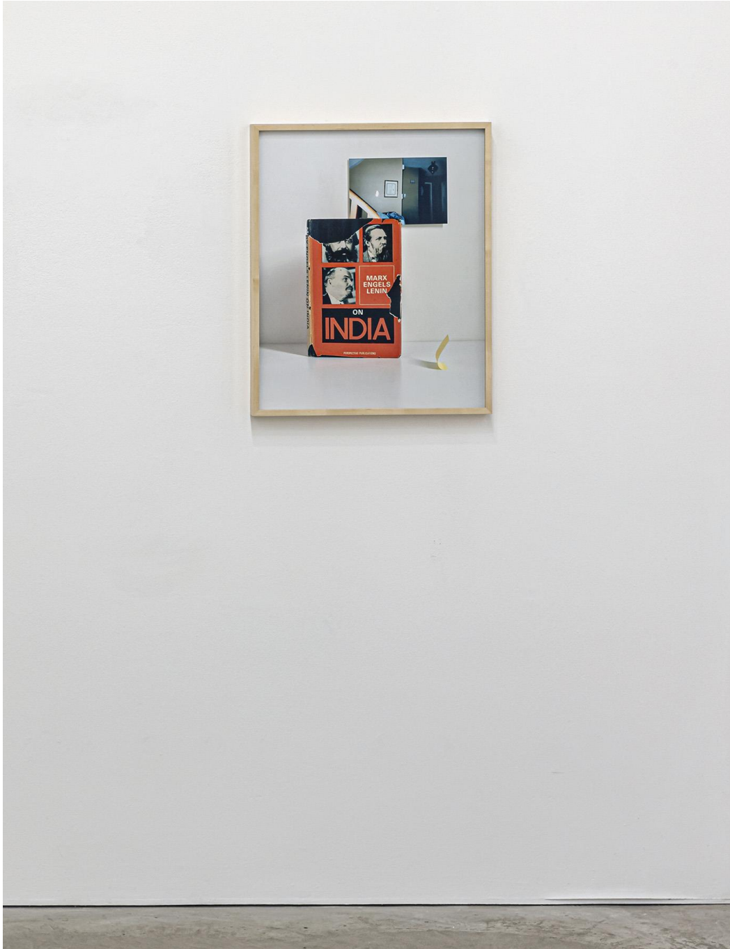
Zinnia Naqvi Marx, Engles, Lenin on India , 1/5 2024 inkjet print 62 x 52 cm