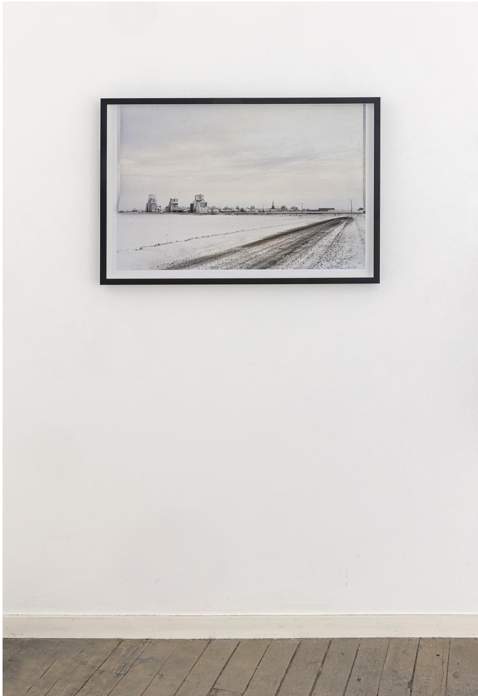
Althea Thauberg Village of Holdfast, view from the south, photographed by Althea and John Thauberg, December 1982., 1/5 2024 three collaged inkjet prints 56.5 x 85 cm