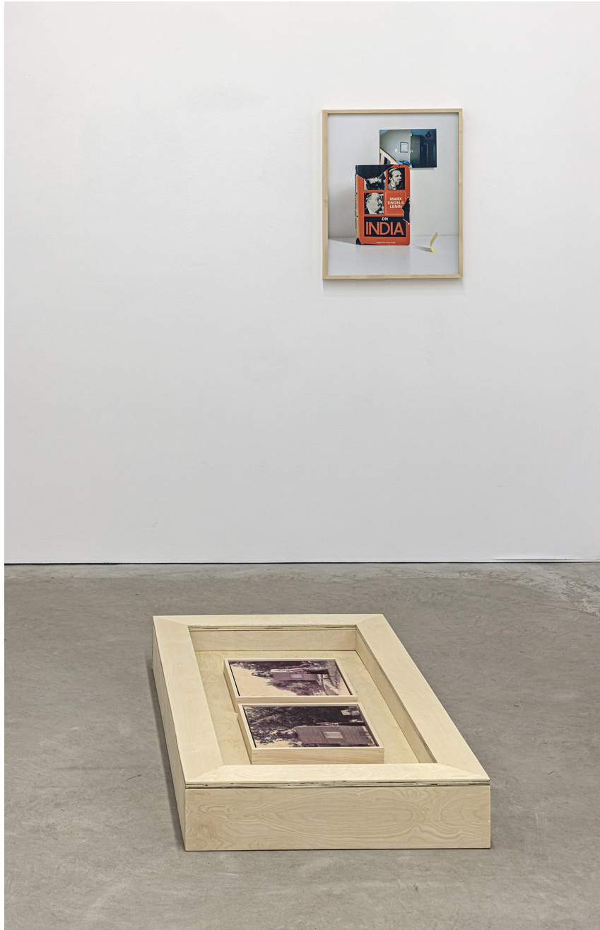
Zinnia Naqvi the pilgrim is always in danger of becoming a tourist installation view, 2024