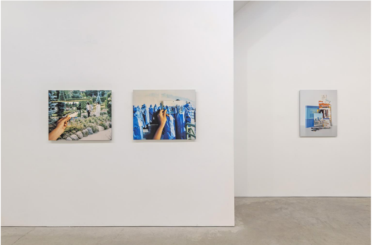
Zinnia Naqvi the pilgrim is always in danger of becoming a tourist installation view, 2024