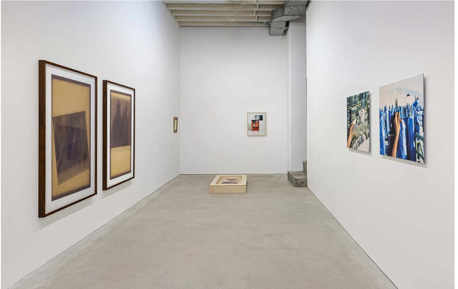
Zinnia Naqvi the pilgrim is always in danger of becoming a tourist installation view, 2024