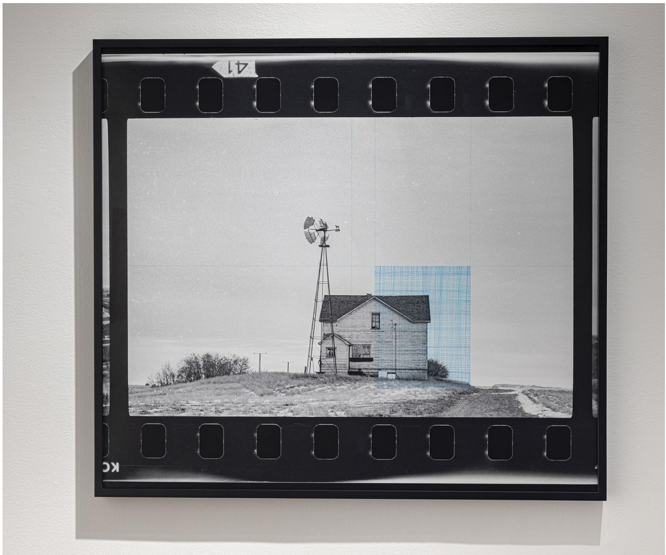
Althea Thauberg Thauberg farm house, December 1986., 1/5 2024 inkjet print, ink 104 x 117 cm