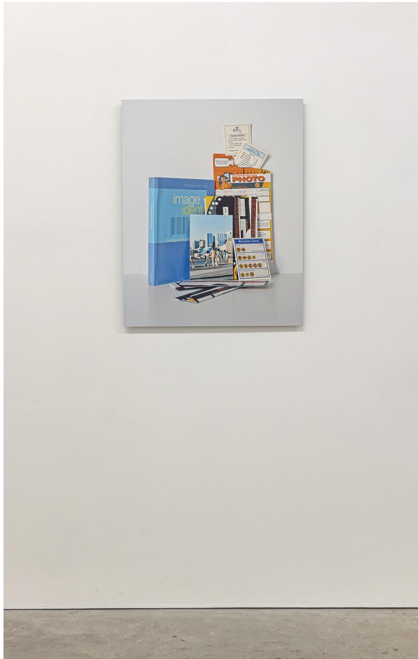
Zinnia Naqvi Staff Purchase, 1/5 2019 inkjet print mounted on Dibond 76 x 61 cm