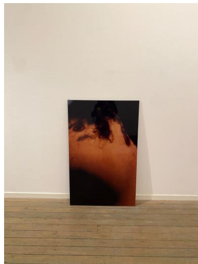
Rebecca Bair, Untitled (shadows) , 2022

adorned, the parts left bare. The parts reflected in the mirror that remain still during a guided breath, tracing the contour of the collarbone.