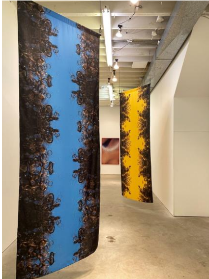
Together/Apart , Installation view, December 2022.