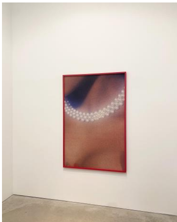
Karice Mitchell, Adorned I , 2022

It's like that feeling when a gust of wind hits the curls at the nape of my neck on a hot summer day as I walked between Rebecca Bair's two larger-than-life prints of Type 3 coils - the fabric dancing in the breeze carried by my stride. Placed against bright blue and yellow backgrounds respectively, each image acts as a textured and vibrant path guiding you through.