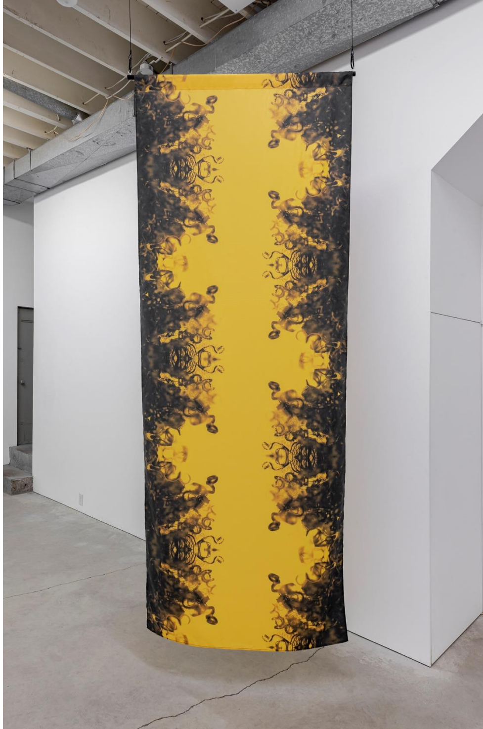
Rebecca Bair Portal (n.2) , 2022, edition of 3 digital print on Dacron 300 x 115 cm