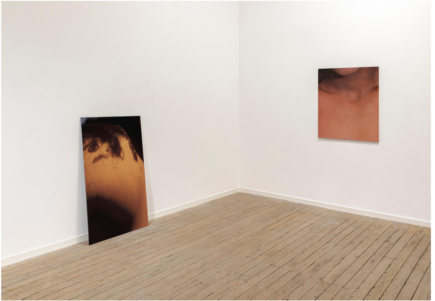
Together / Apart installation view, 2022