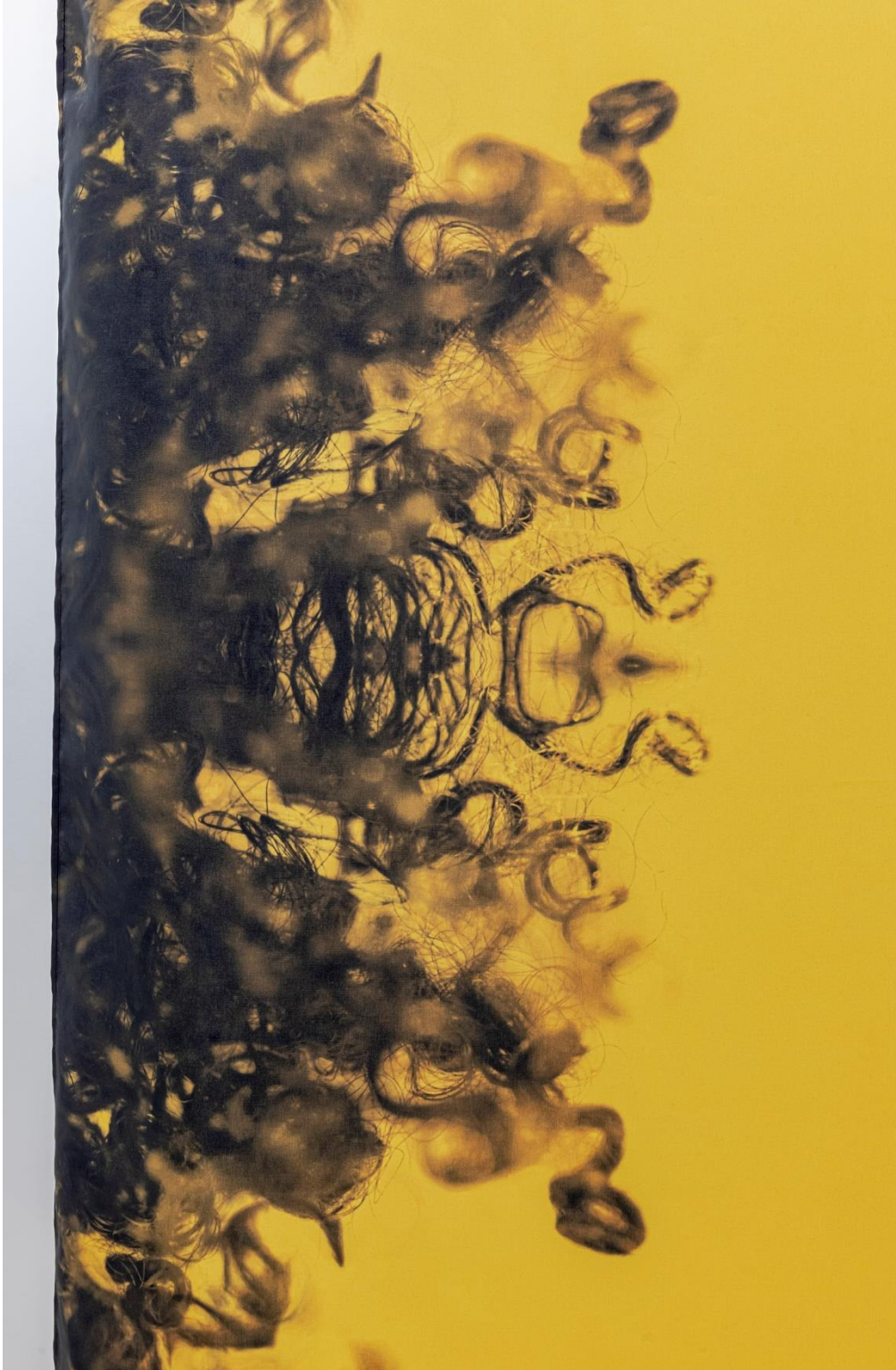
Rebecca Bair detail of Portal (n.2) , 2022, edition of 3