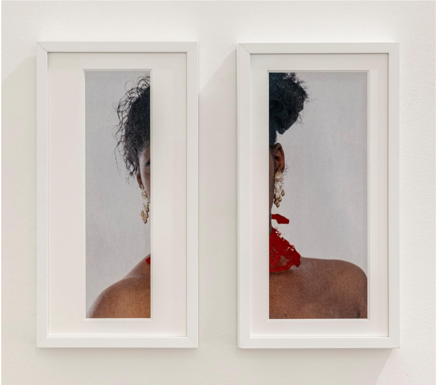
Karice Mitchell Untitled Diptych (Woman in Red) , 2022, edition of 3 archival inkjet print 43 x 22.5 cm (each)