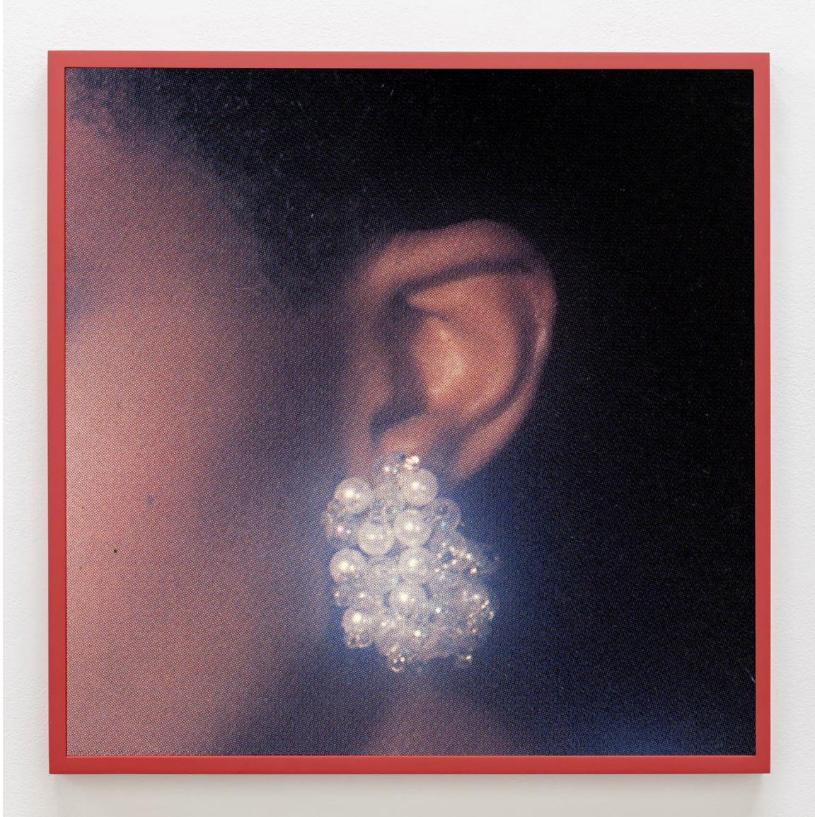
Karice Mitchell Adorned II , 2022, edition of 3 archival Giclée print on fibre rag paper 76 x 76 cm