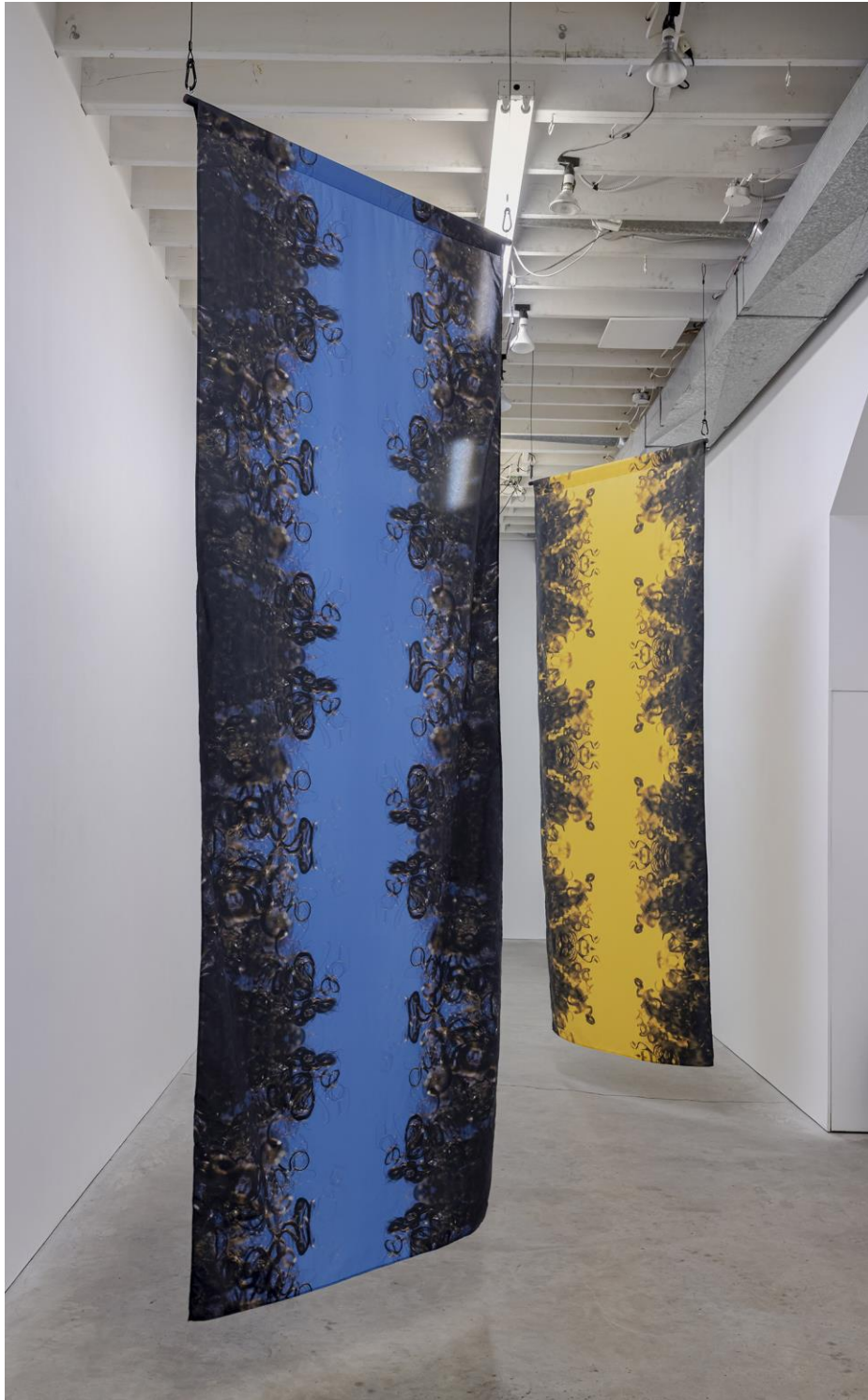
Rebecca Bair Portal (n.1) and (n.2) , 2022, edition of 3 digital print on Dacron 300 x 115 cm (each)