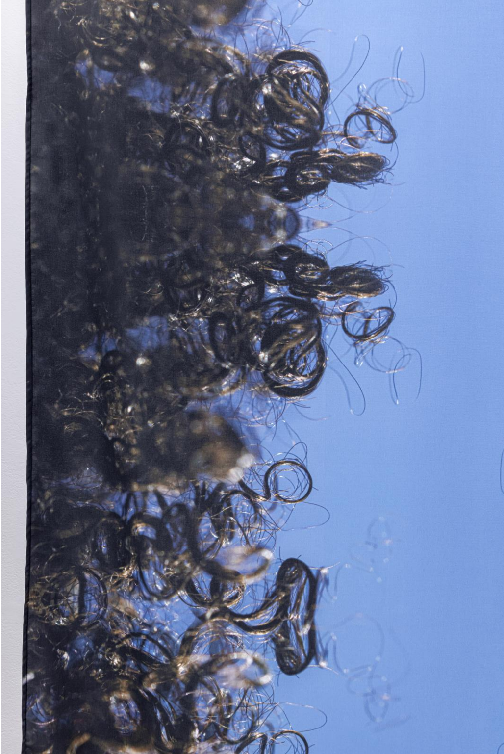
Rebecca Bair detail of Portal (n.1) , 2022, edition of 3