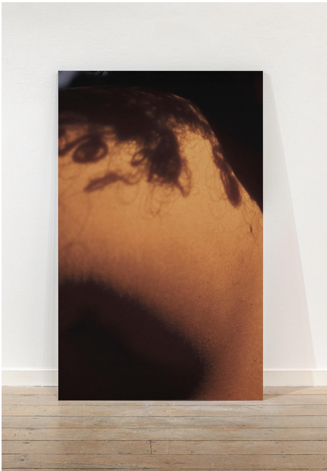
Rebecca Bair Untitled (Shadows) , 2022, edition of 3 archival inkjet print mounted on plexiglass 121 x 75.5 cm