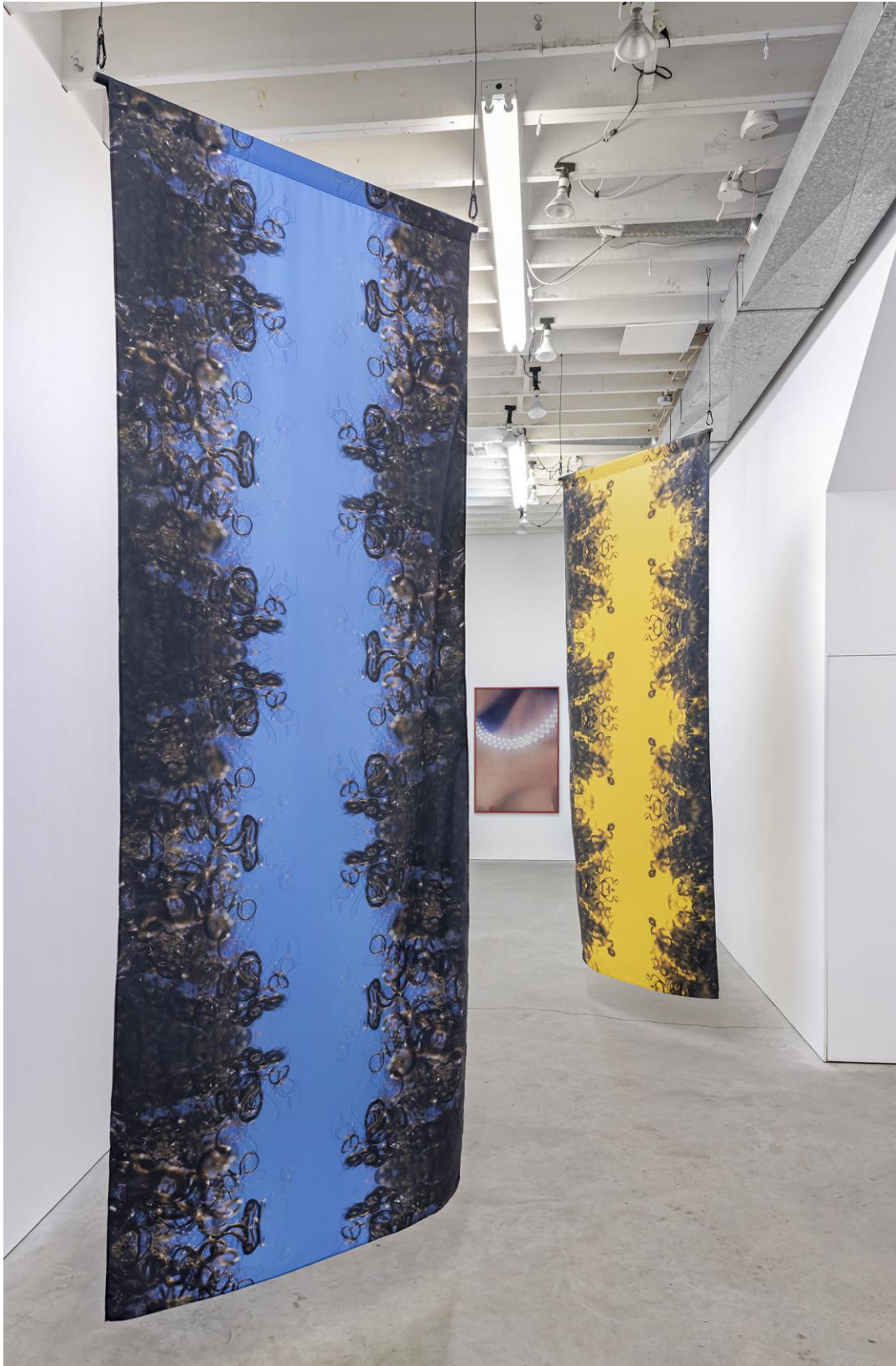
Together / Apart installation view, 2022