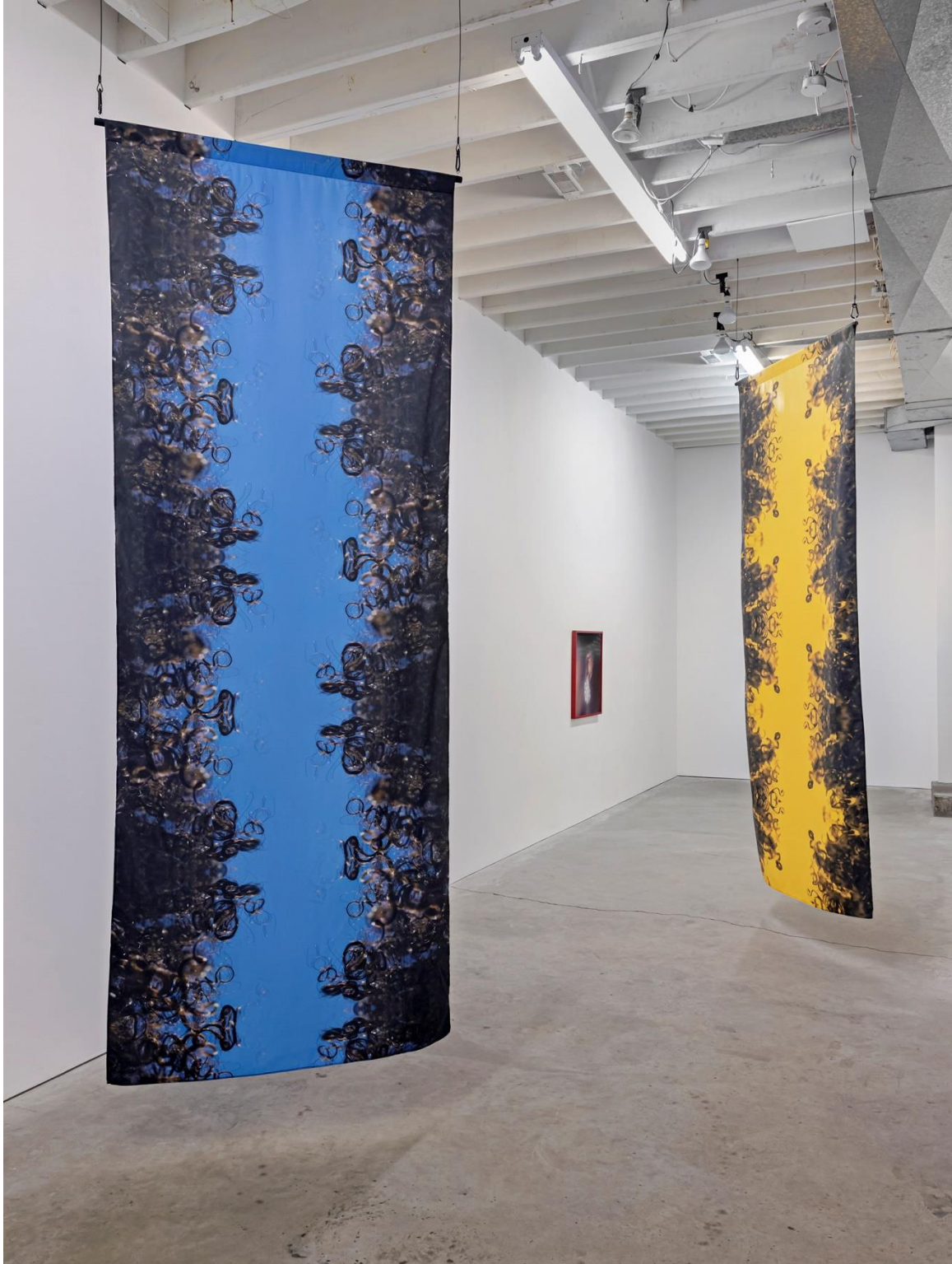
Together / Apart installation view, 2022