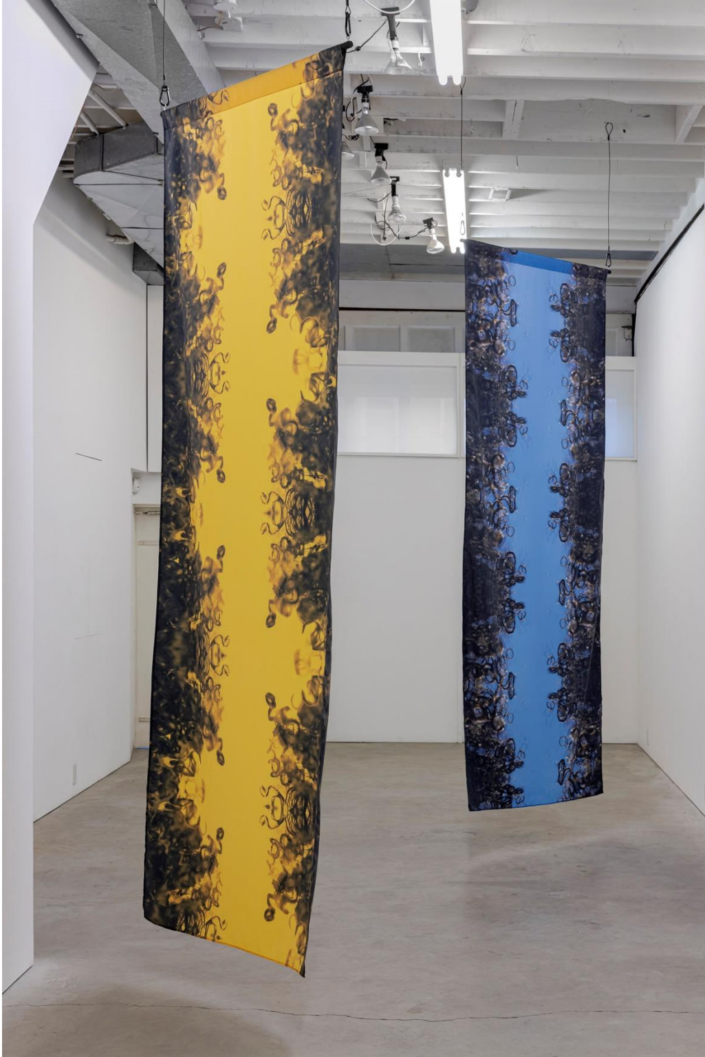
Rebecca Bair rear installation view of Portal (n.1) and (n.2) , 2022, edition of 3