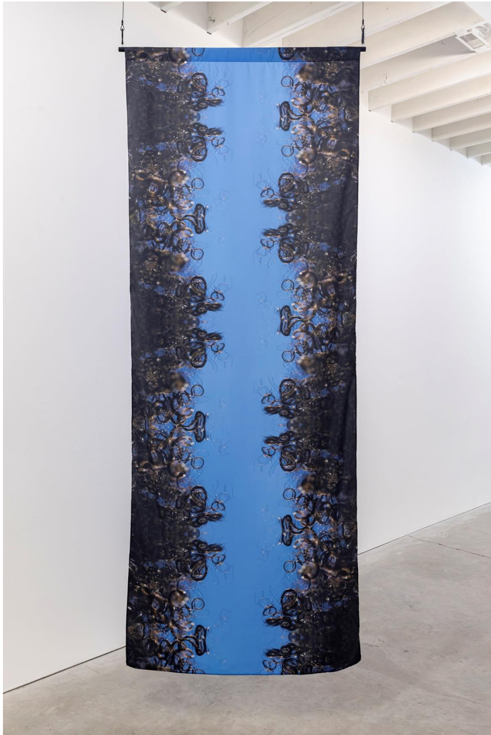
Rebecca Bair Portal (n.1) , 2022, edition of 3 digital print on Dacron 300 x 115 cm