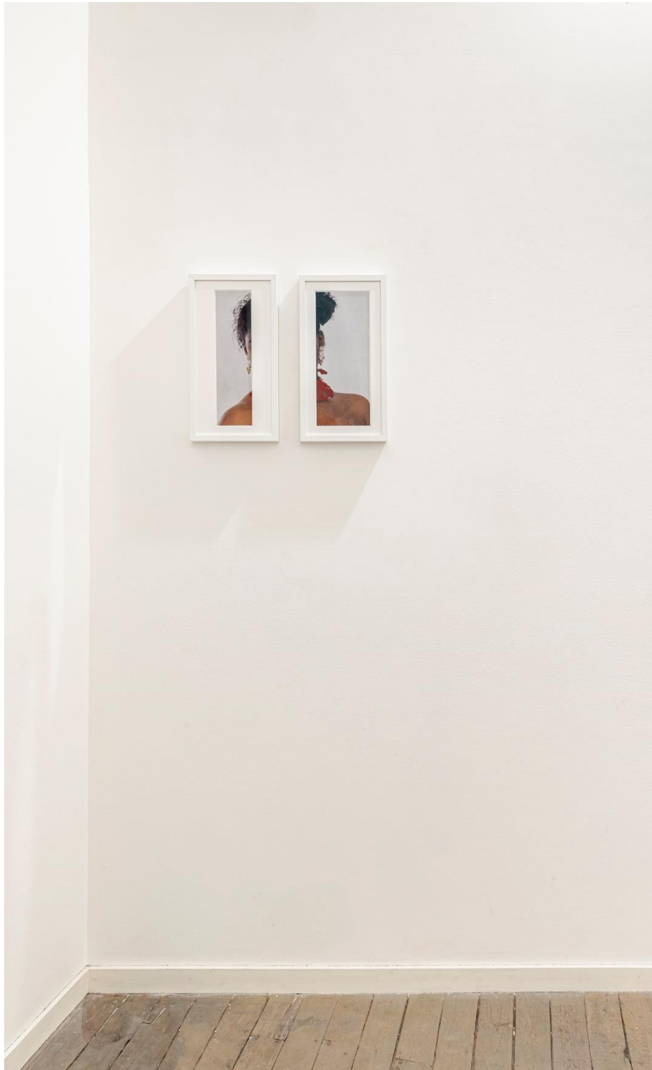
Karice Mitchell installation view of Untitled Diptych (Woman in Red) , 2022, edition of 3