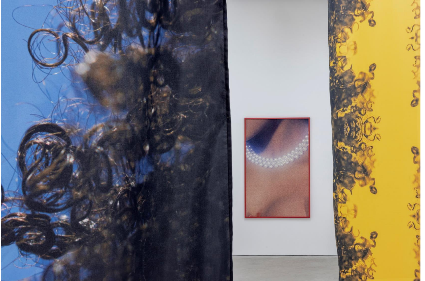
Together / Apart installation view, 2022