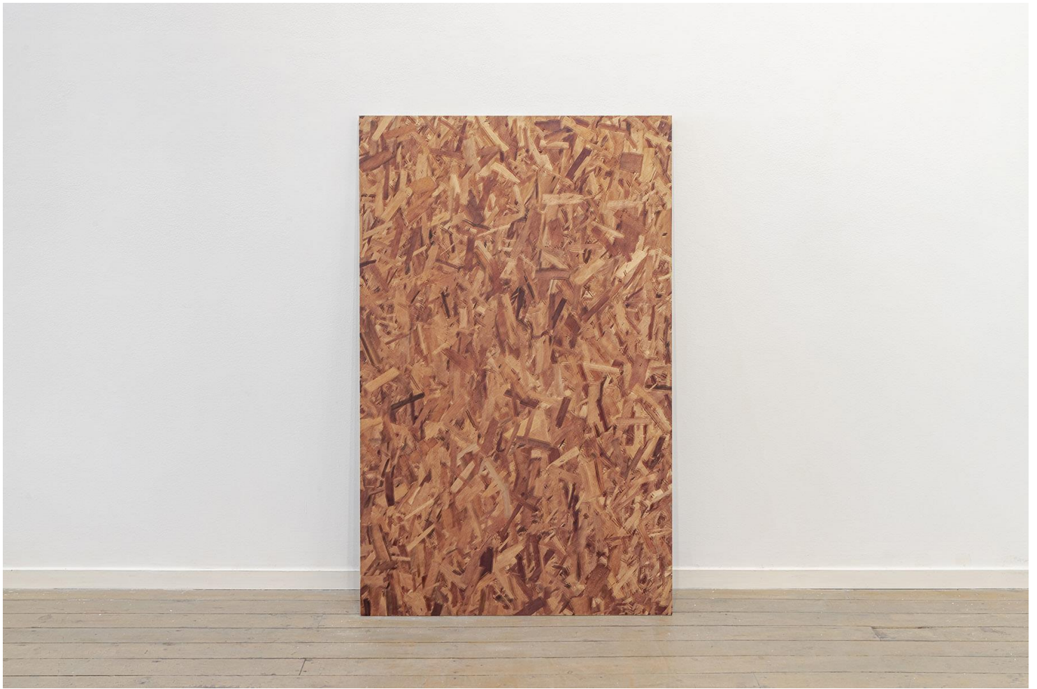
Jacob Kassay Red Dead Redemption , 2020 UV print on OSB and aluminum 150.5 x 94.5 cm