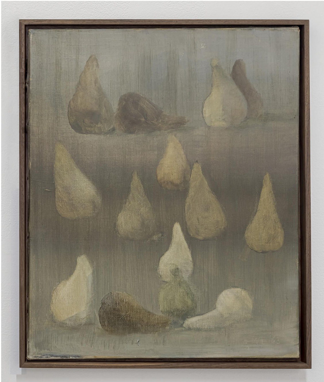
Norman McLaren Untitled, 1963 oil on canvas 68 x 54 cm