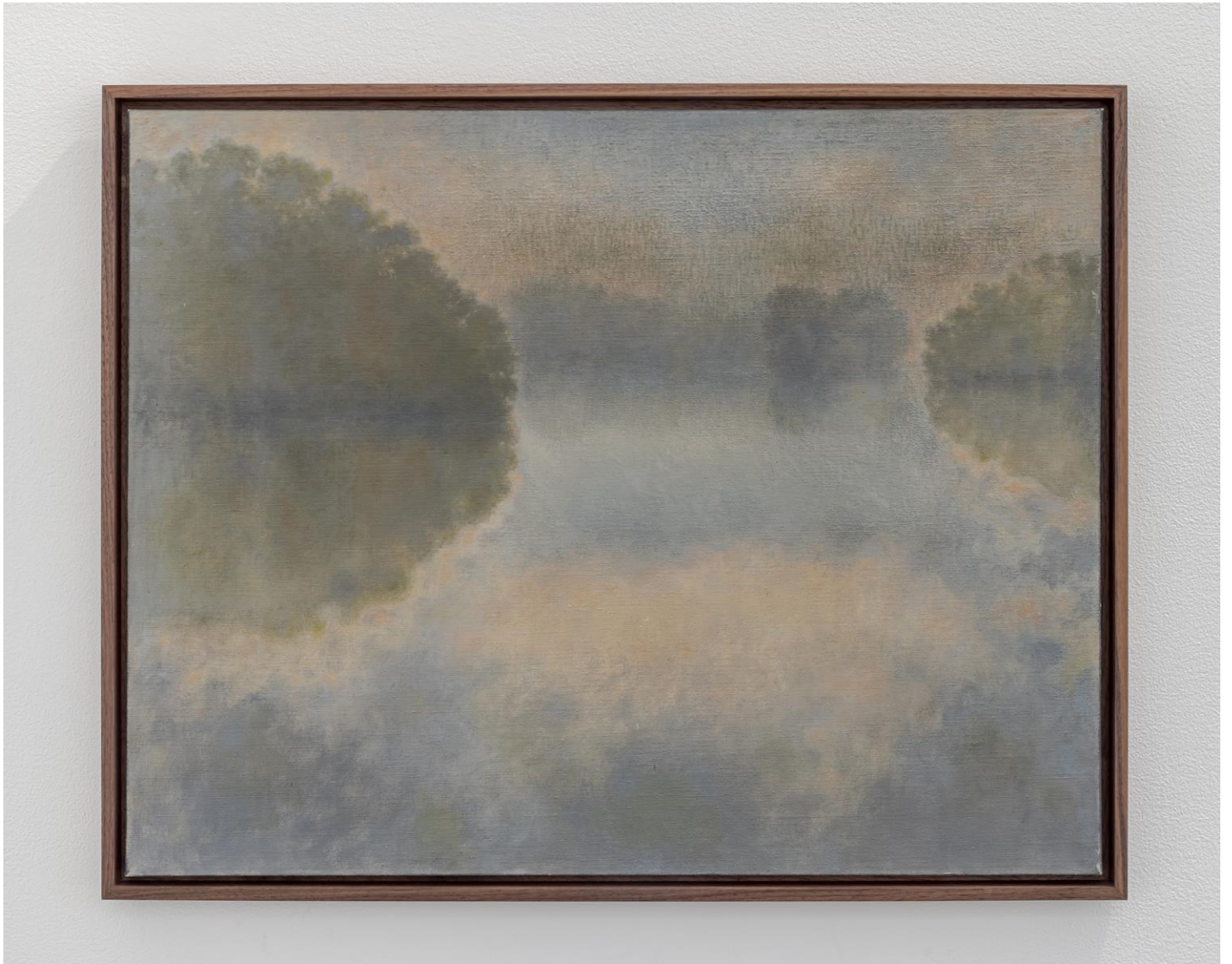
A Johnson Untitled , 1963 oil on canvas 59 x 74 cm