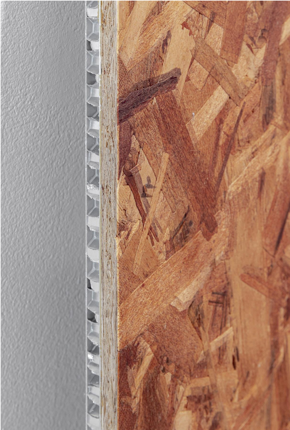
Jacob Kassay detail of Red Dead Redemption , 2020