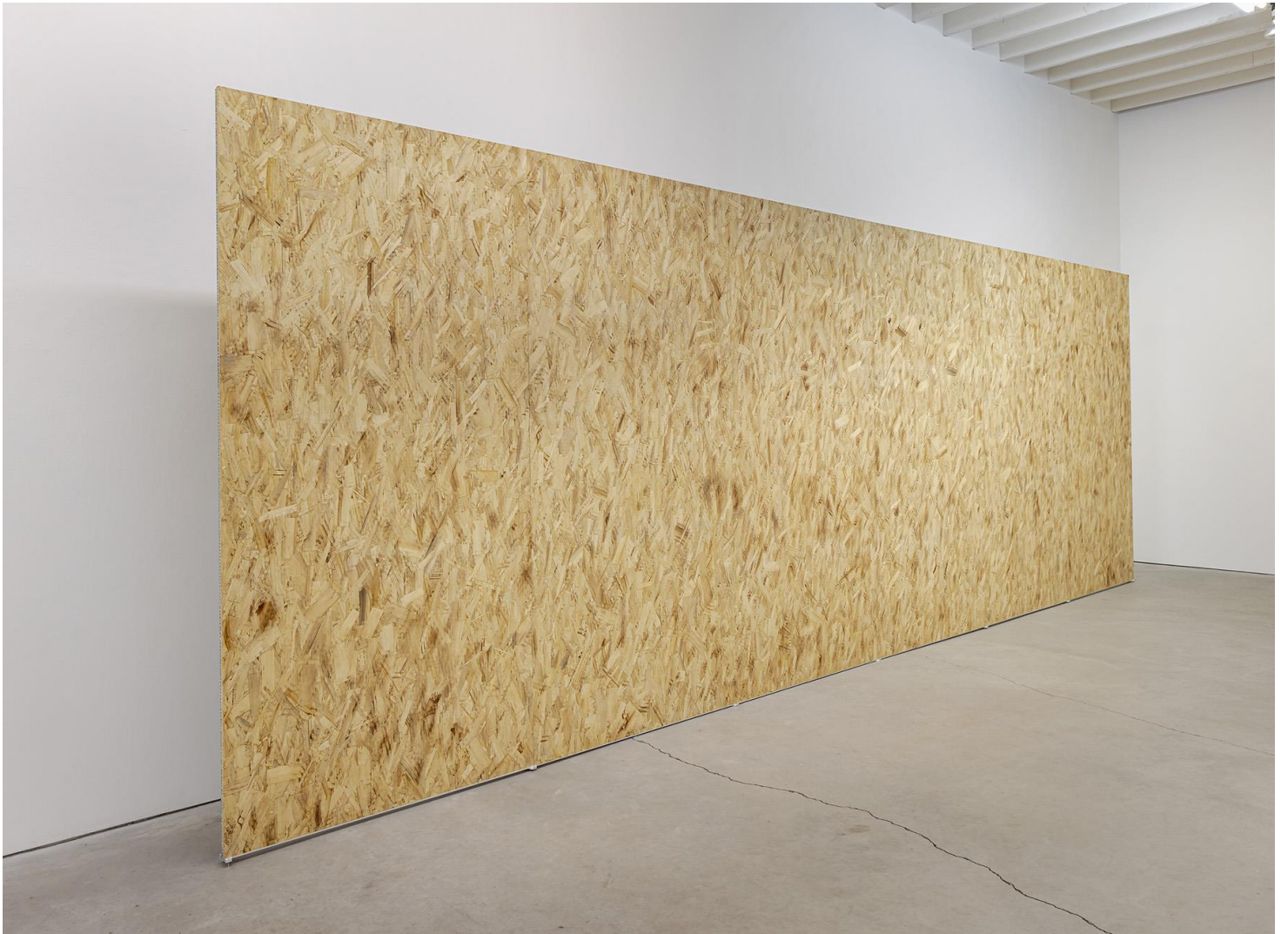
Jacob Kassay Days of Heaven , 2020 UV print on OSB and aluminum, various hardware 244 x 731.5 x 49.5 cm