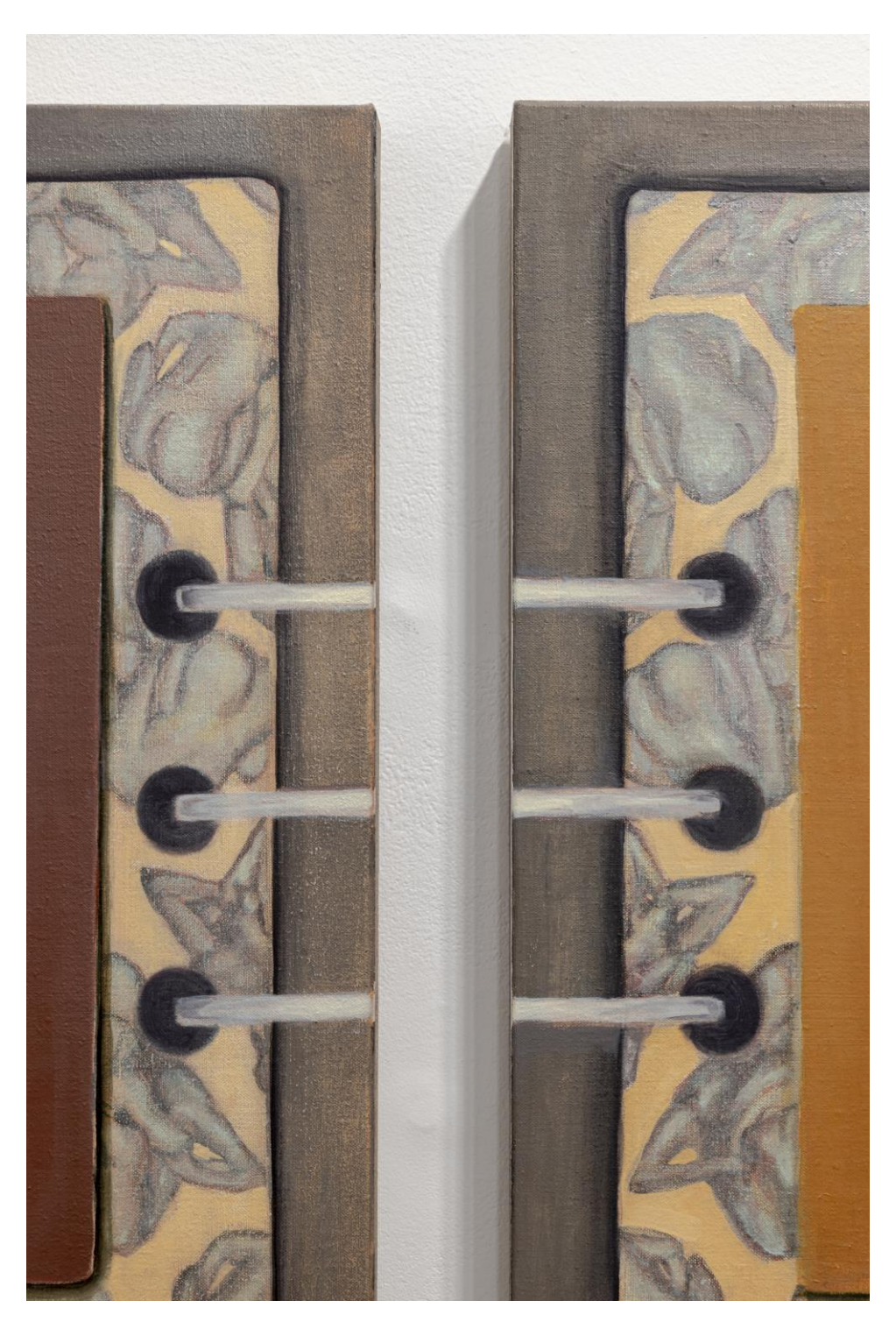
Beth Stuart detail of Problem Three , 2022