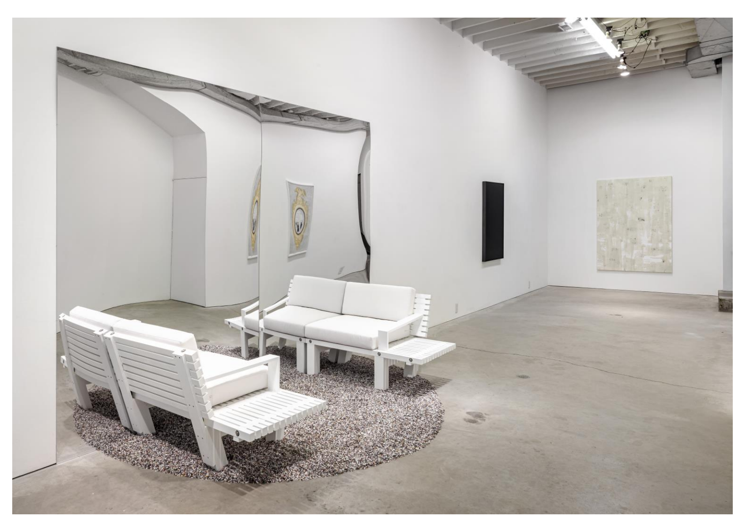
A Viewing Room v.5 installation view, 2022