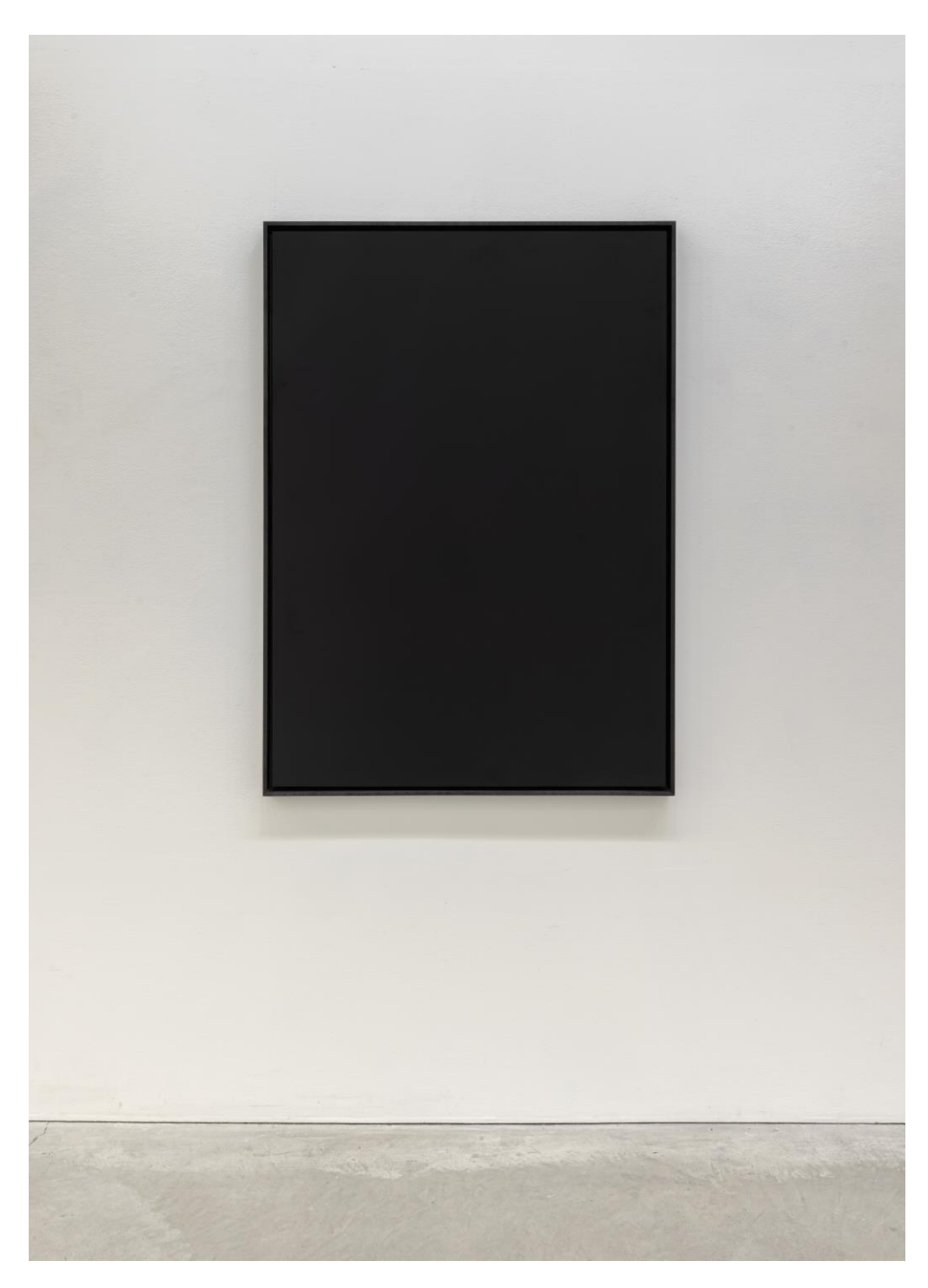
Scott Lyall Black Glass, 2013 ink on glass 124 x 89 cm