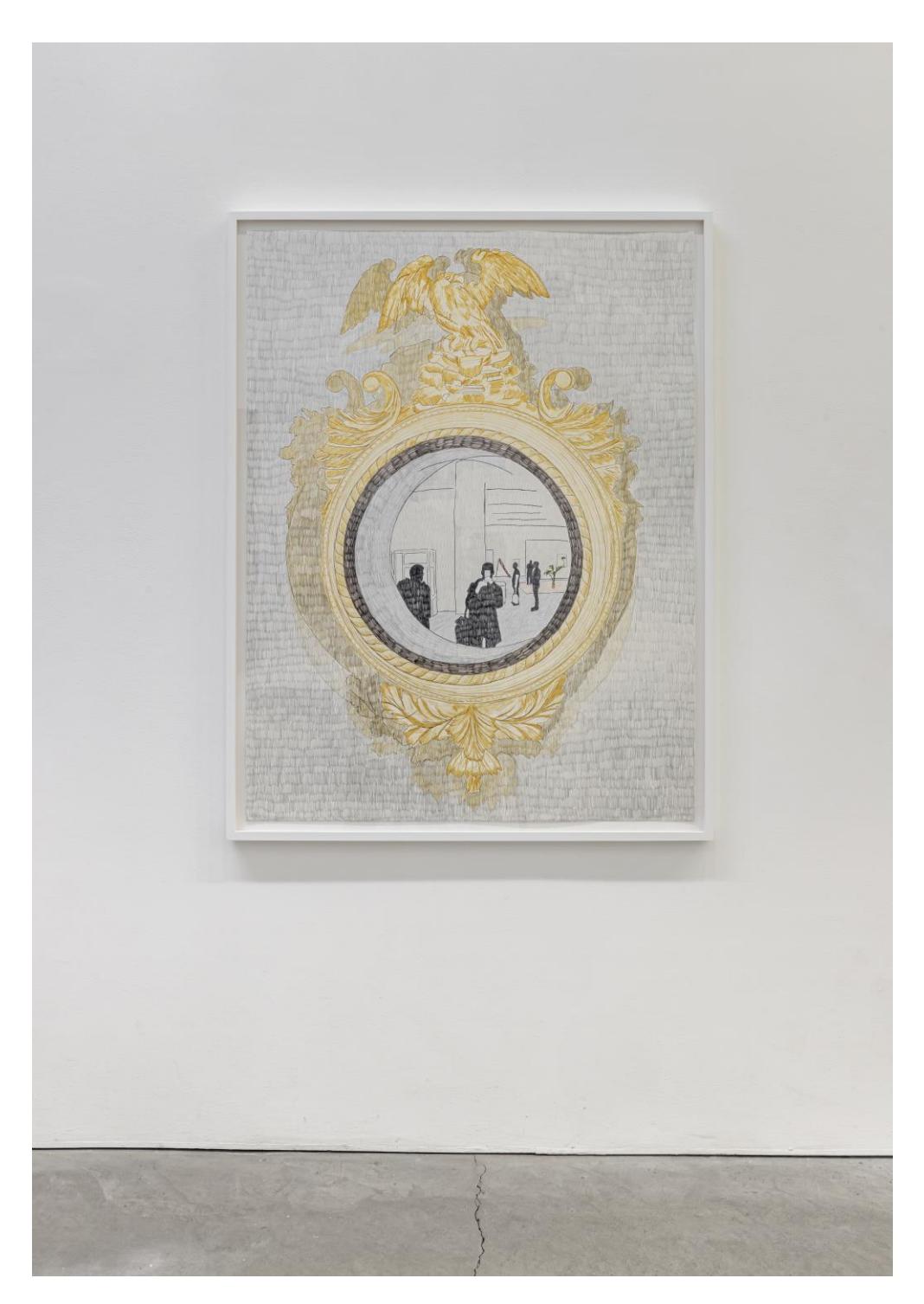
Derek Sullivan #120, The time machine, 2017 coloured pencil on paper 133 x 102 cm