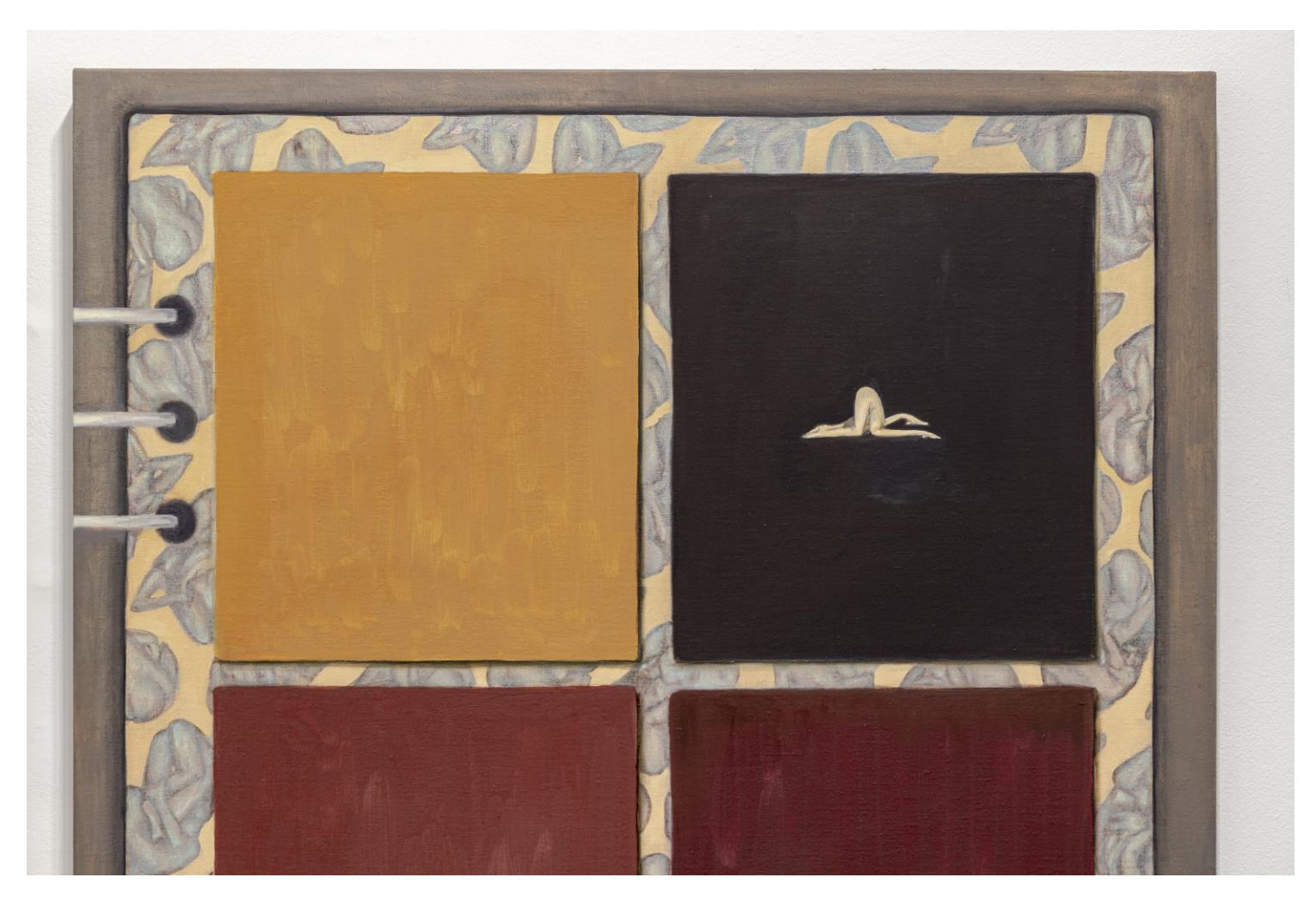
Beth Stuart detail of Problem Three , 2022