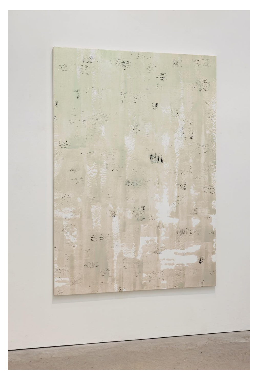
Shirley Wiitasalo Green Black, 2007 acrylic on canvas 173 x 122 cm