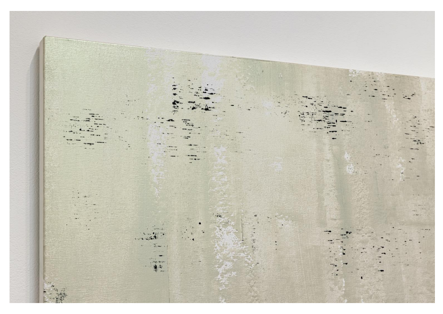
Shirley Wiitasalo detail of Green Black , 2007