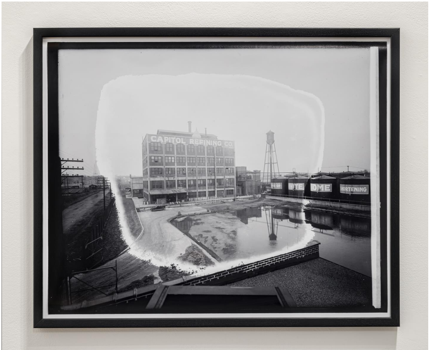
Meech Boakye Relee Oil , 2022 Epson Premium luster photo paper 260gsm 61 x 76.2 cm