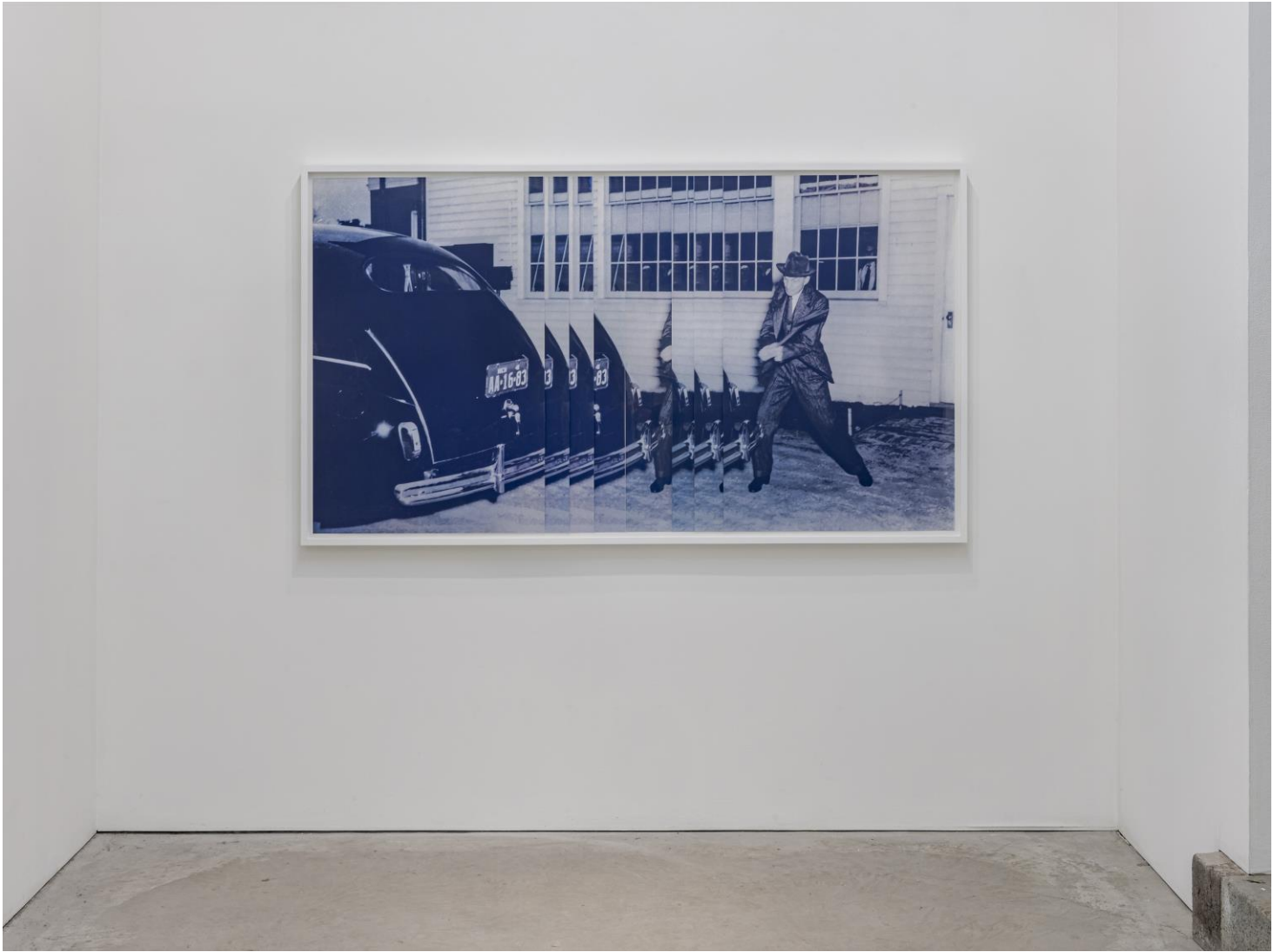
Gareth Long Ford, 2022 3 colour silk-screen on Coventry Rag Vellum 290gsm paper 108 x 189.2 cm