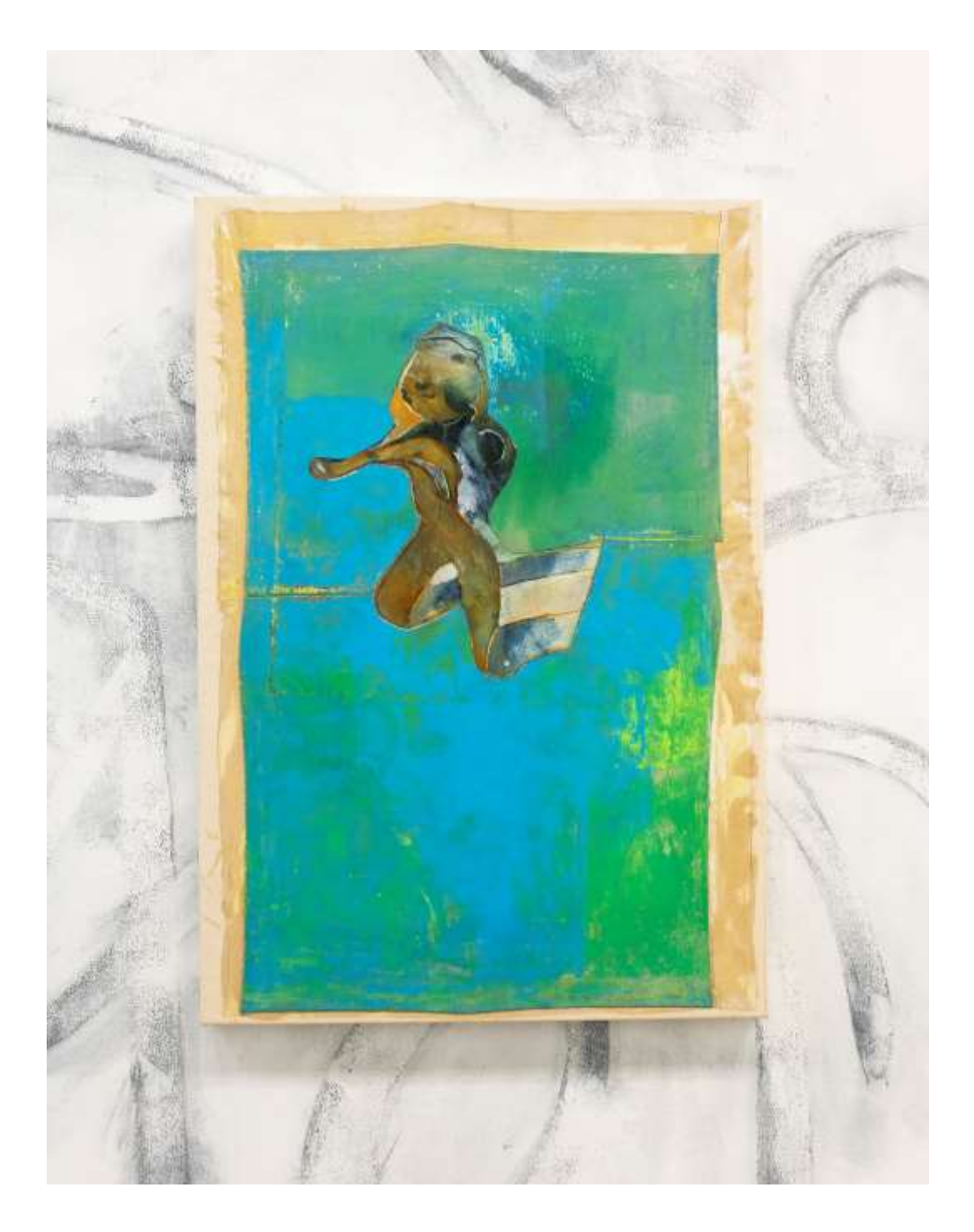
Katie Lyle Soap and shadow, 2020 oil, pencil crayon and pastel on canvas, mounted with wax on canvas 101.5 x 70 cm