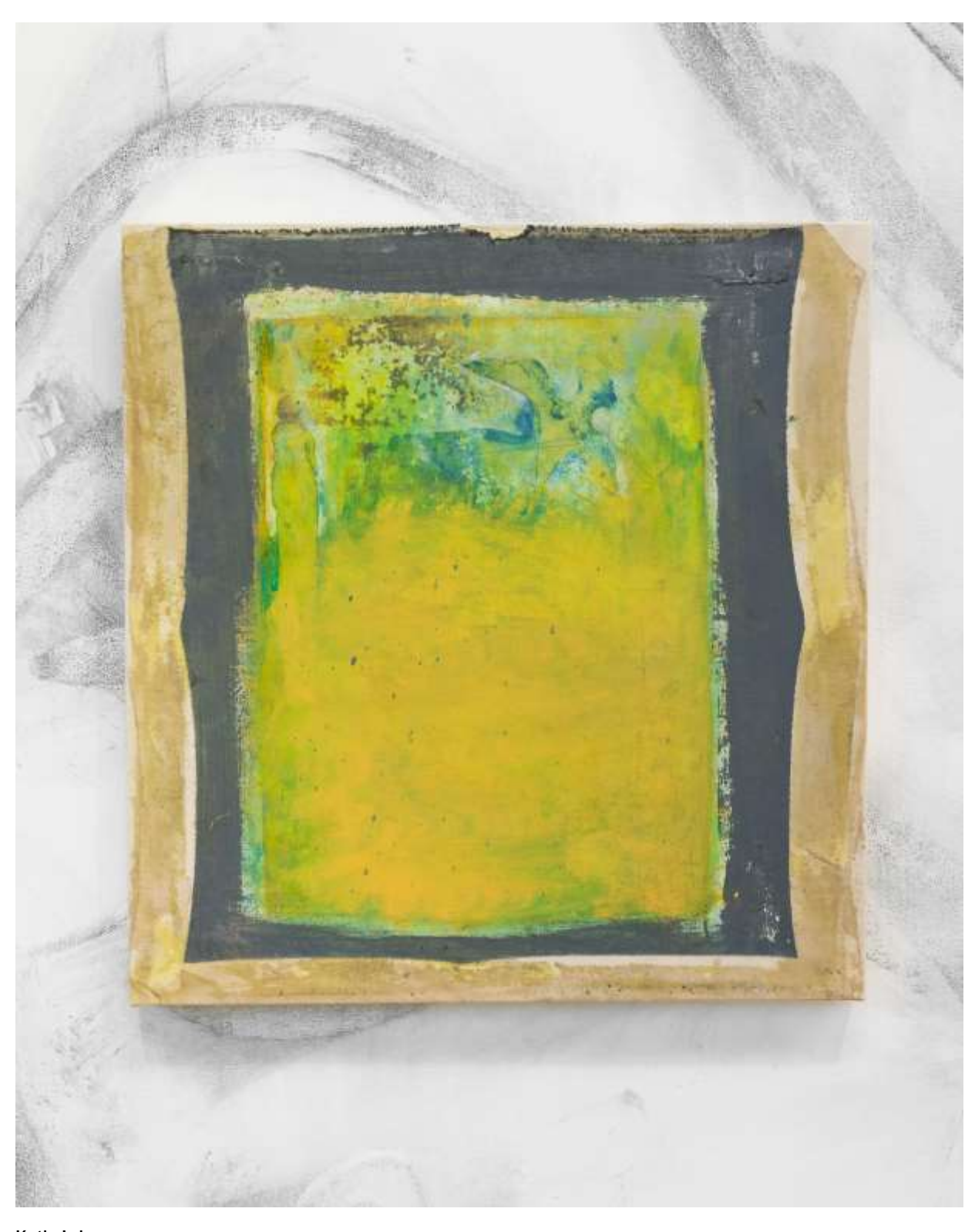
Katie Lyle Sea change, 2020 oil, pencil crayon and pastel on canvas, mounted with wax and adhesive on canvas 80\ x\ 76\ cm