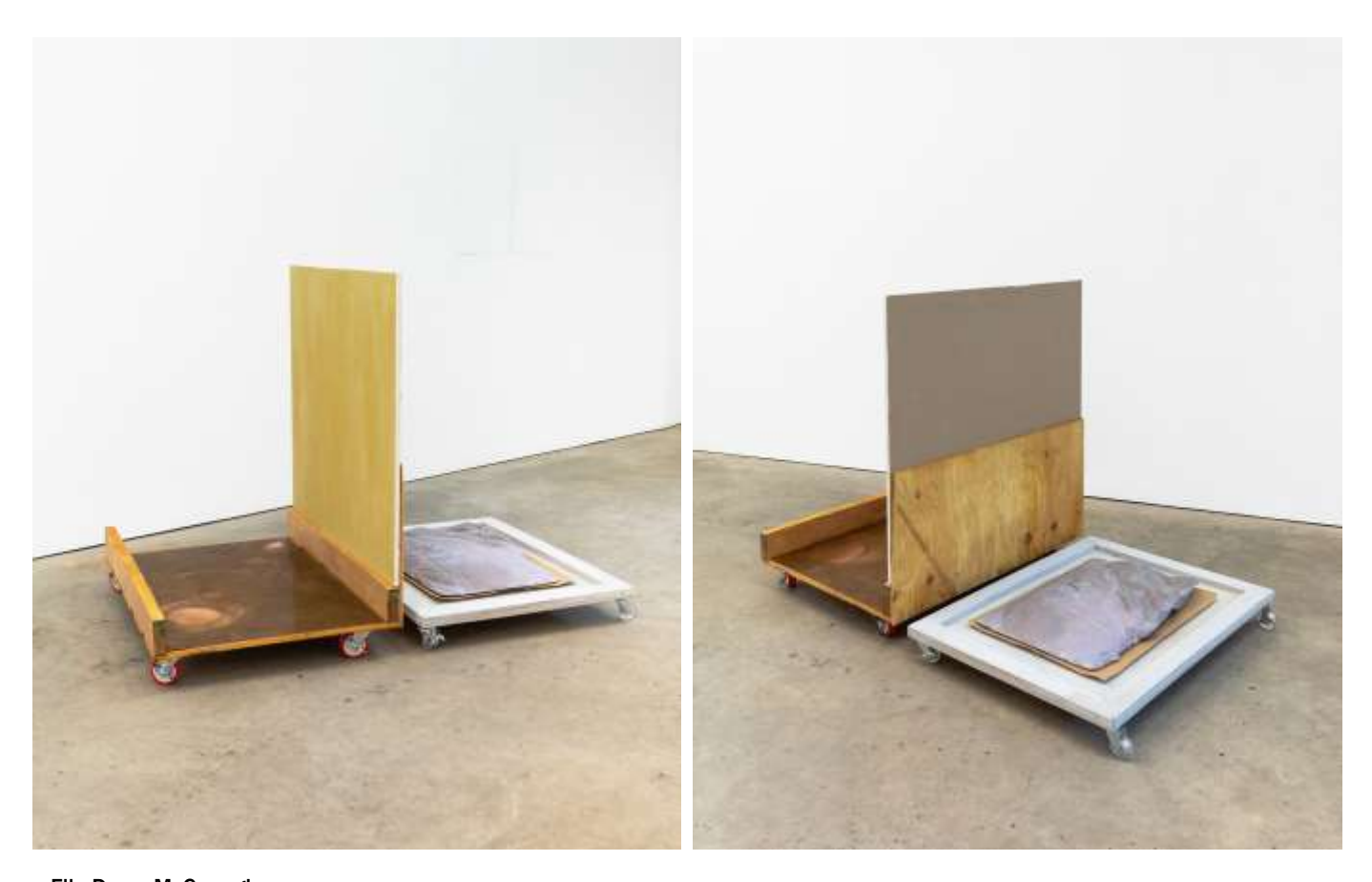
Ella Dawn McGeough space~form_summer, 2020 copper, microcrystalline wax, found wood, drywall, orange wax, casters 102 x 89 x 65 cm

space~form_mouse, 2020 soy, beeswax, found wood, milk paint, casters 15 x 87 x 66.5 cm