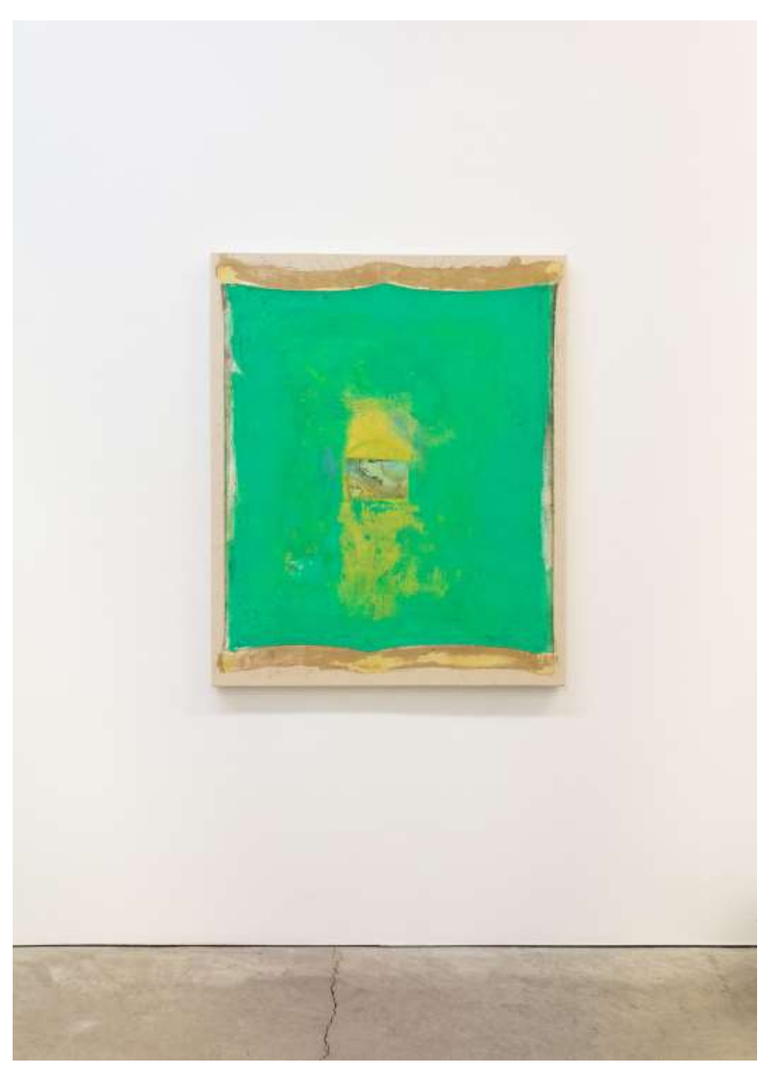
Katie Lyle The Hare, 2020 oil, pencil crayon and pastel on canvas, mounted with wax and adhesive on canvas 122 x 100.5 cm