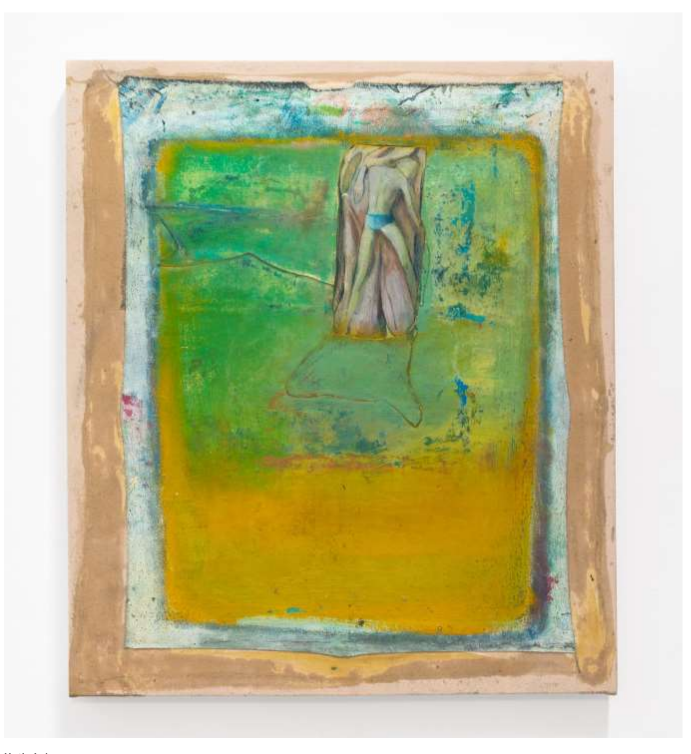
Katie Lyle The Mentor, 2020 oil, pencil crayon, pastel and paper on canvas, mounted with wax and adhesive on canvas 82.5 x 71 cm \,