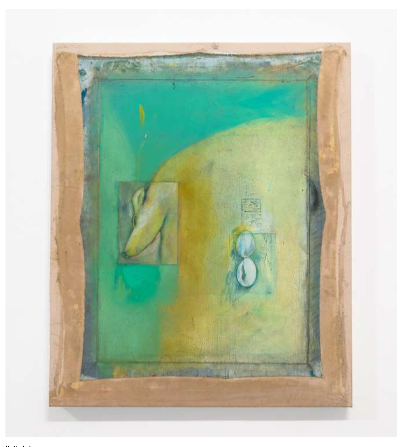
Katie Lyle Theatre, 2020 oil, pencil crayon, pastel \, and collage on canvas, mounted with wax and adhesive on canvas 102 x 84 cm