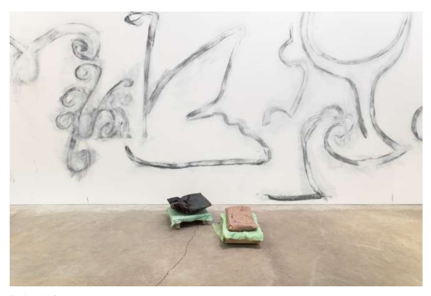
Ella Dawn McGeough dream~form_grape, 2020 soy, beeswax, mixed media, found wood, cotton, reclaimed copper ink, castors 29 x 33 x 43 cm

\label{eq:continuous} \emph{dream-form\_smoke}, 2020\\ soy, beeswax, charcoal, found wood, silk, reclaimed copper ink, soy wax, castors 24 x 40.5 x 48 cm