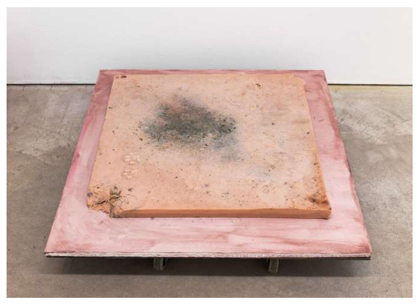
Ella Dawn McGeough site~form_Charlie i, 2020 soy, beeswax, mixed media, found wood, drywall, hibiscus ink, casters 12.5 x 61 x 61 cm