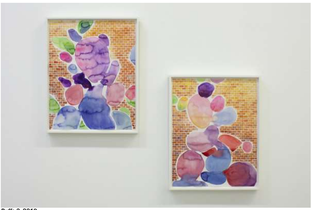
Puffs 2, 2019 Puffs 1, 2019 watercolour on paper