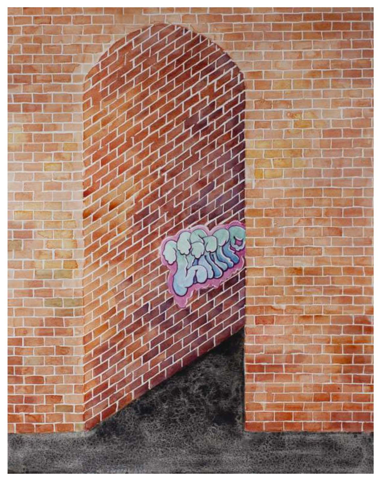
Rhonda Weppler and Trevor Mahovsky Limmp , 2019 watercolour on paper