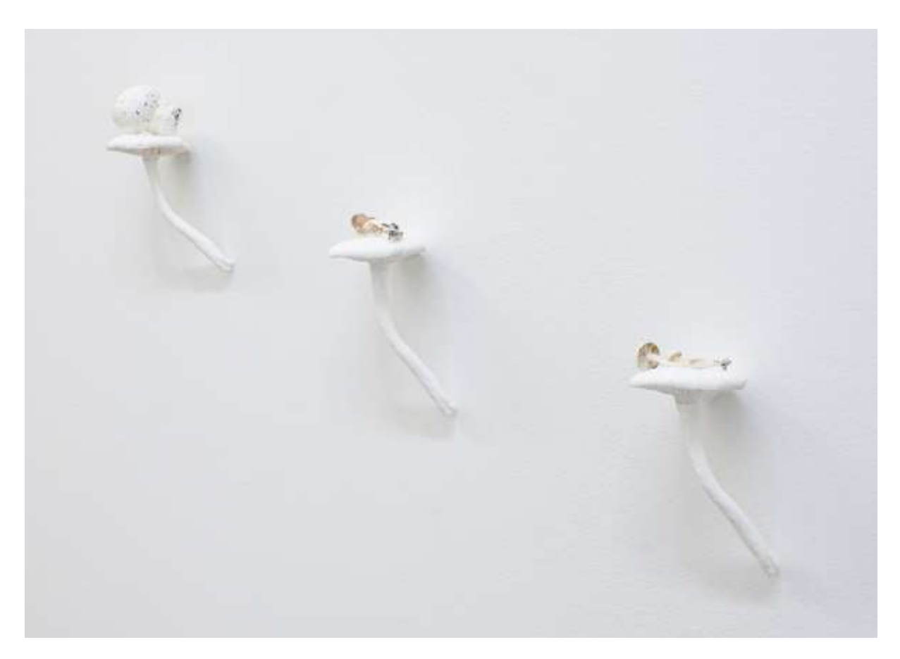
Rhonda Weppler and Trevor Mahovsky Soft Landing 1, 2019 Soft Landing 2, 2019 Soft Landing 3, 2019 plastic, embedded residue of decomposed mushroom