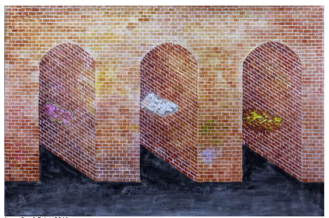
Leep, Pewf, Zelut, 2019 watercolour on paper