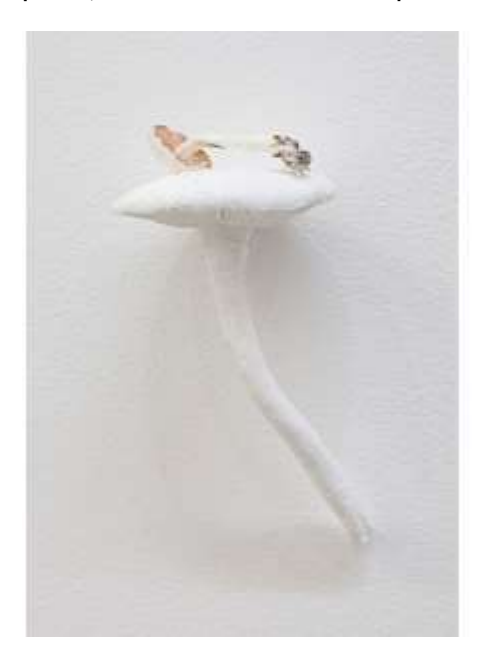
Soft Landing 3, 2019