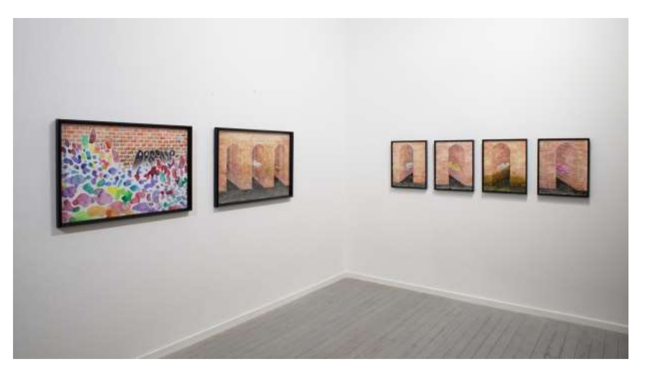
Rhonda Weppler and Trevor Mahovsky Installation View – second floor