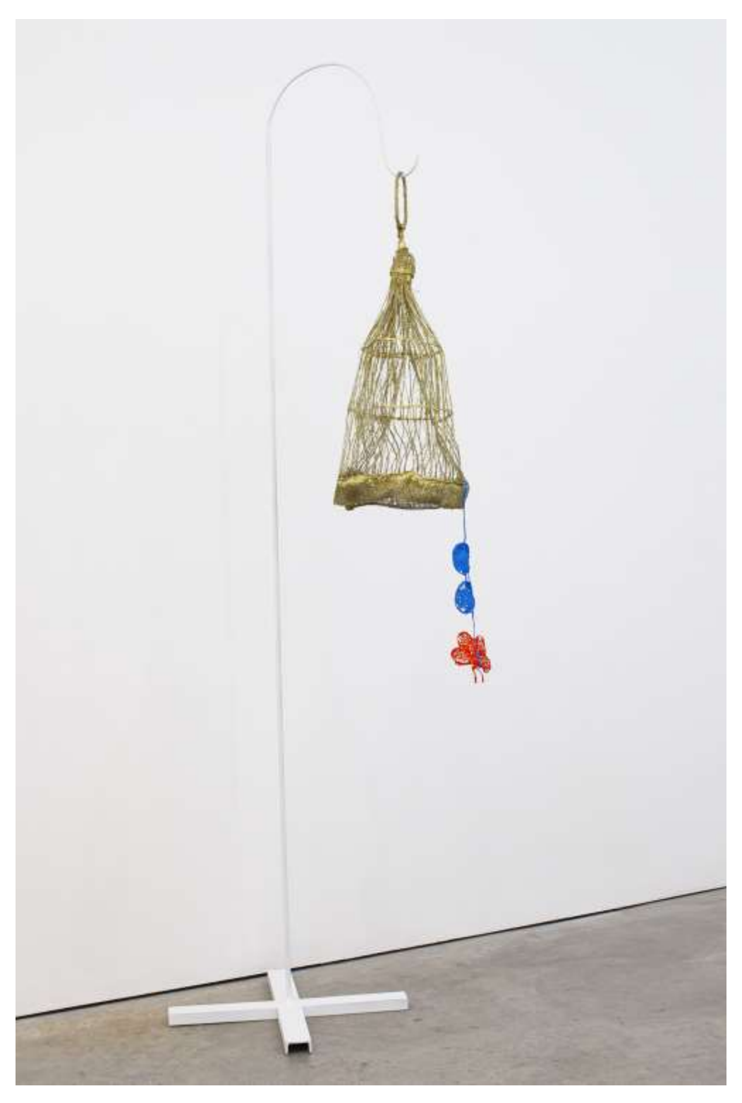
Rhonda Weppler and Trevor Mahovsky Endless Flight, 2016 sisal, burlap, epoxy, enamel, spray paint, steel