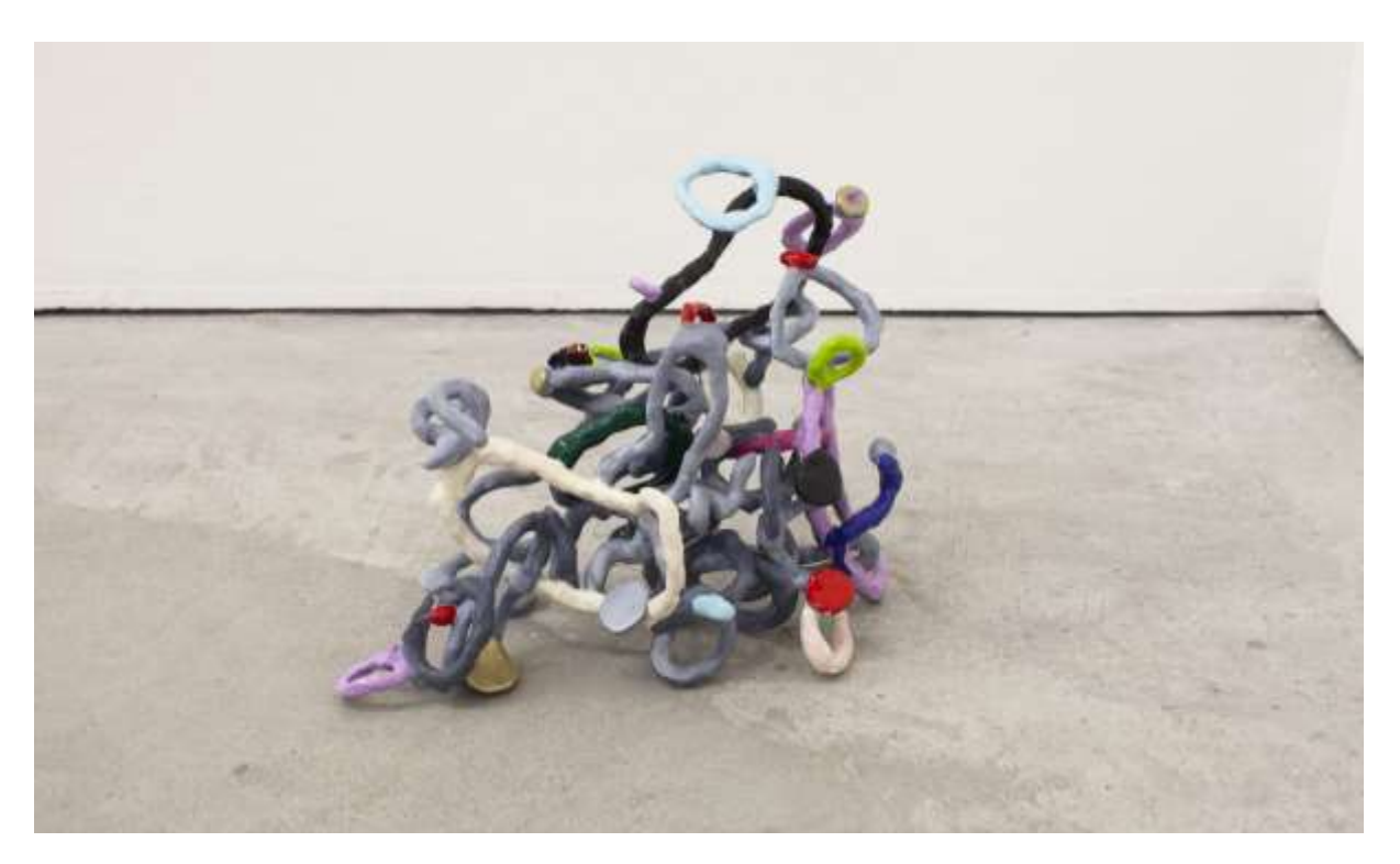
Rhonda Weppler and Trevor Mahovsky Slight Buzz, 2019 epoxy putty, polymerized gypsum, wire, pigment, enamel