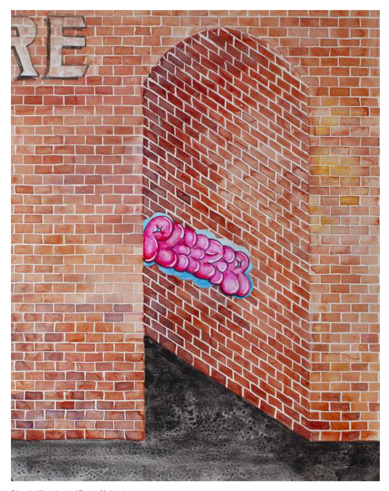
Rhonda Weppler and Trevor Mahovsky Pleezer 2019 watercolour on paper