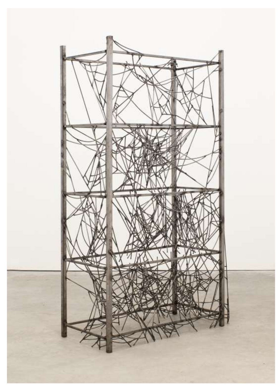
Rhonda Weppler and Trevor Mahovsky Heavy Spiders, 2019 steel, linseed oil