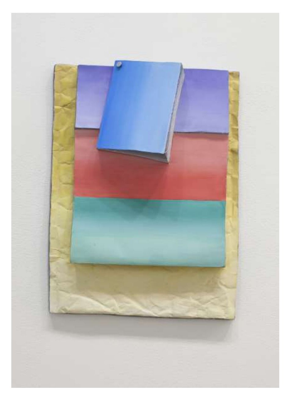
Rhonda Weppler and Trevor Mahovsky Good News, 2019 polymerized gypsum, fibreglass, enamel, oil, acrylic