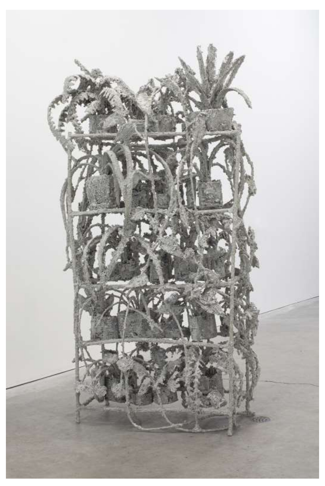
Rhonda Weppler and Trevor Mahovsky Evening, 2019 epoxy putty, steel