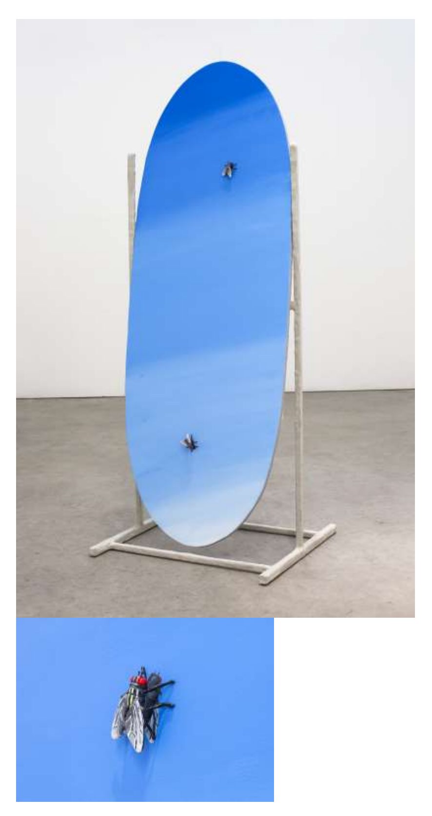
Rhonda Weppler and Trevor Mahovsky A Closer Look (Double Self-Portrait), 2019 epoxy putty, steel, polymerized gypsum, foam, burlap, paint