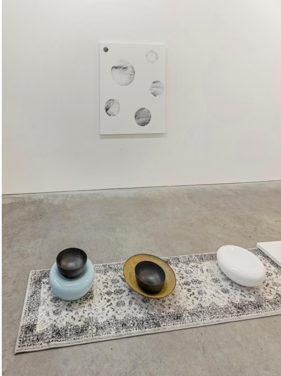
A Viewing Room v.3 installation view, 2018