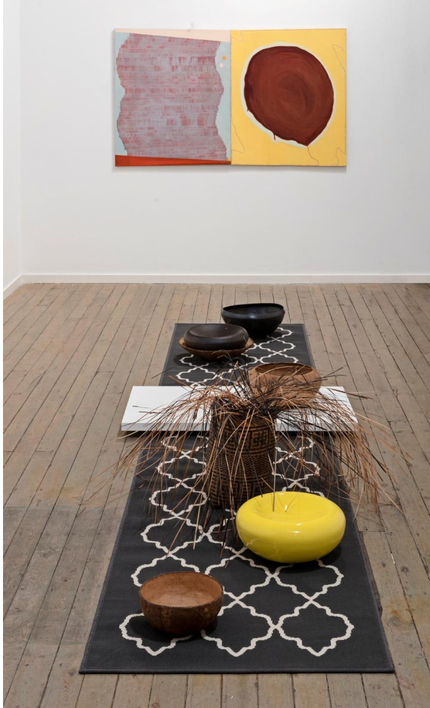
A Viewing Room v.3 installation view, 2018