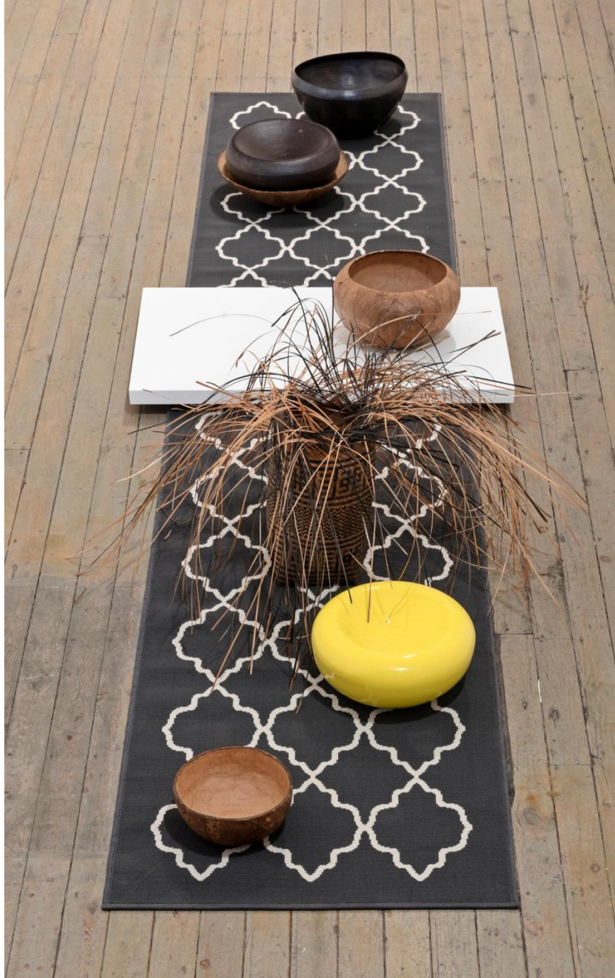
A Viewing Room v.3 installation view, 2018