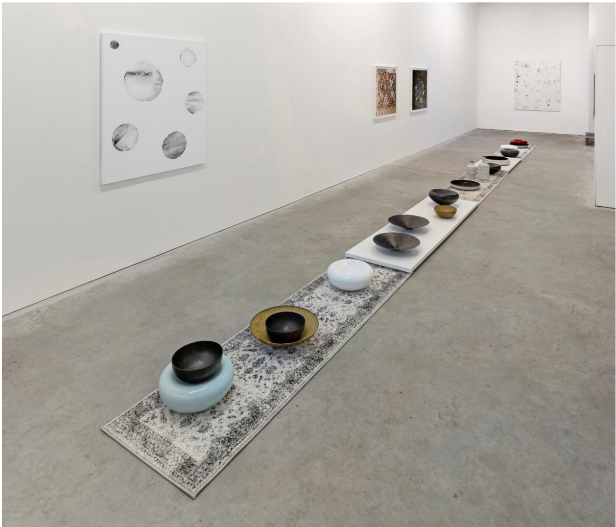
A Viewing Room v.3 installation view, 2018