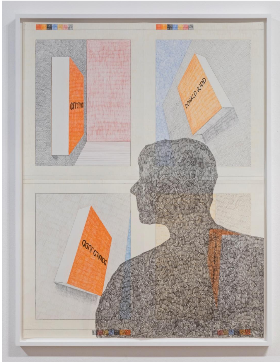
Derek Sullivan #133 Paper Architecture Press Approval, 2018 coloured pencil on paper