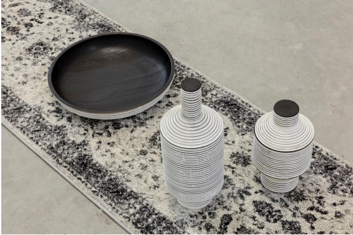
A Viewing Room v.3 installation view, 2018