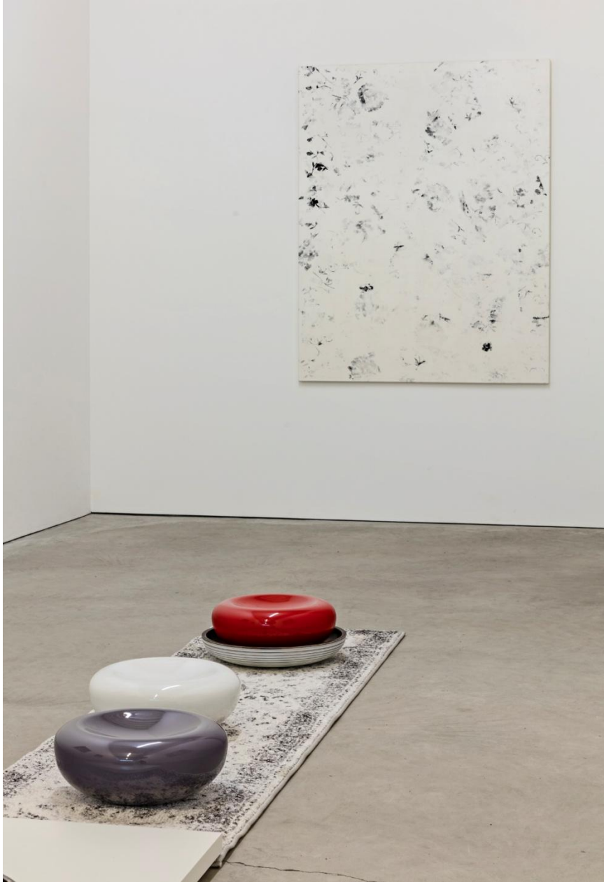
A Viewing Room v.3 installation view, 2018