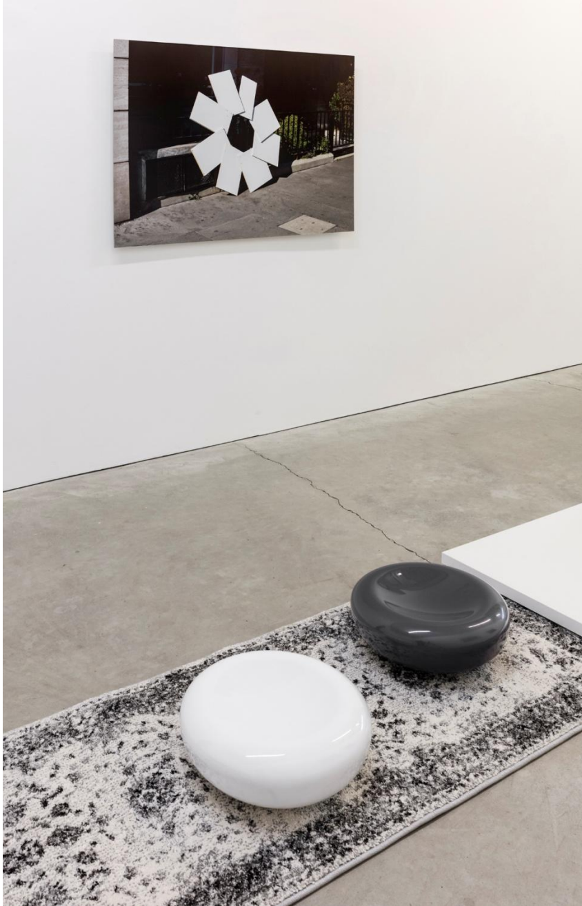
A Viewing Room v.3 installation view, 2018