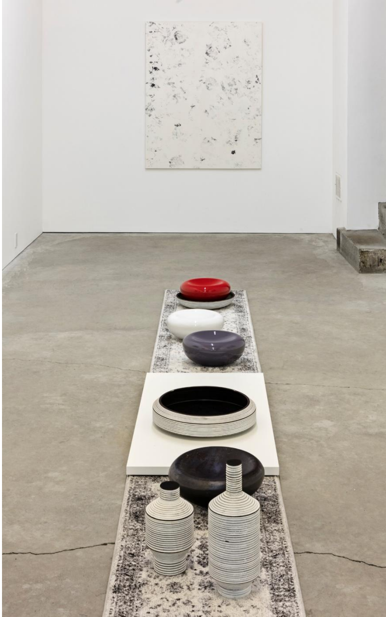
A Viewing Room v.3 installation view, 2018