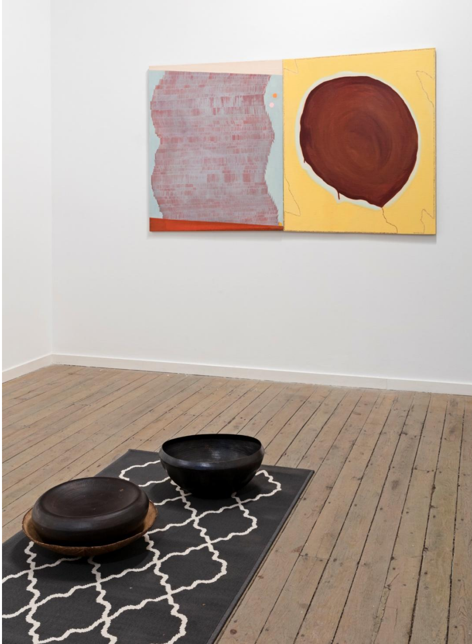
A Viewing Room v.3 installation view, 2018