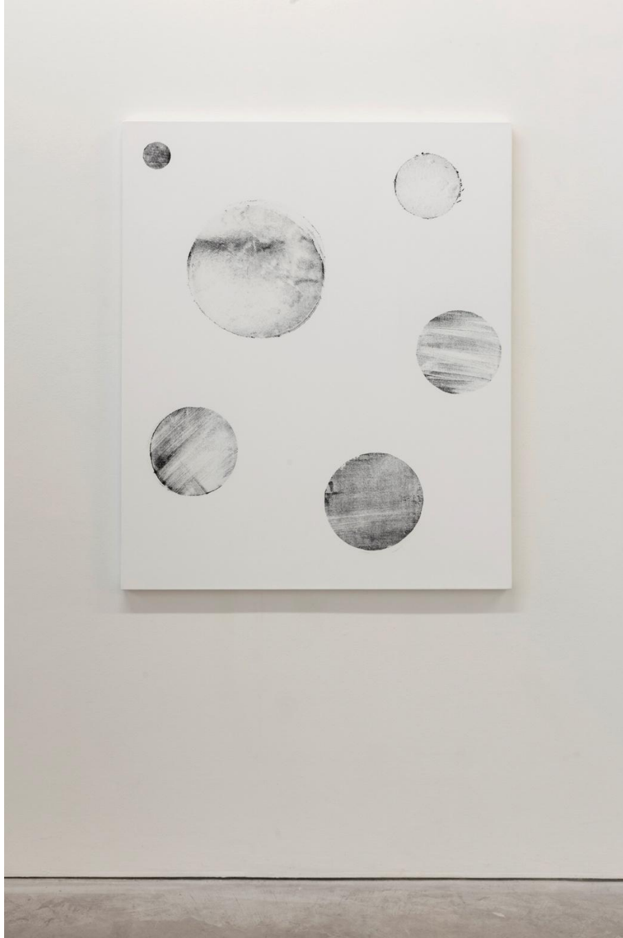
Shirley Wiitasalo Distant - Black, 2017 acrylic on canvas