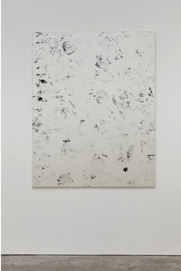
Shirley Wiitasalo Pearl , 2009 acrylic on canvas