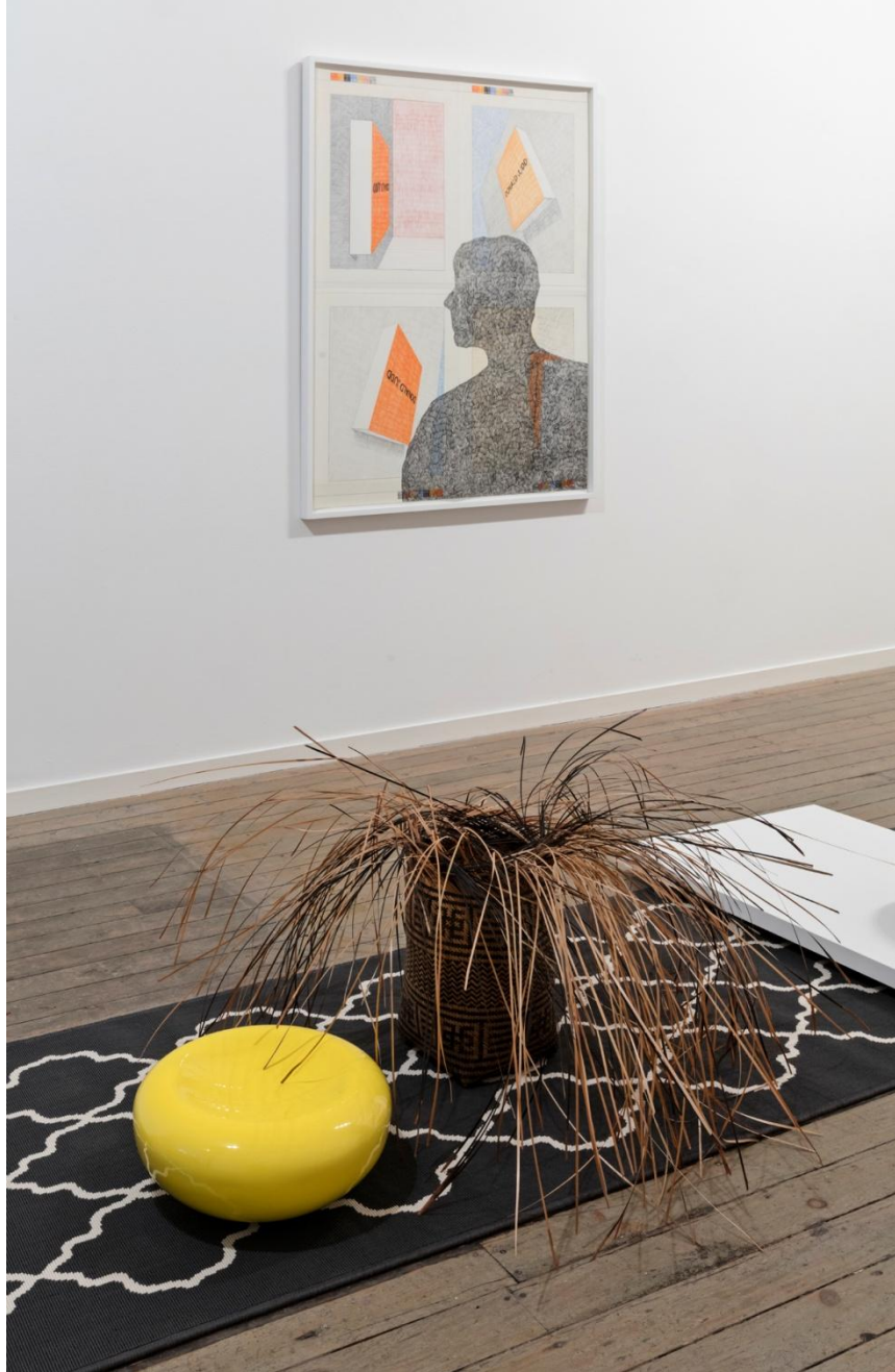
A Viewing Room v.3 installation view, 2018