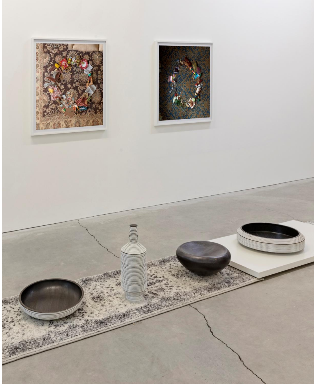
A Viewing Room v.3 installation view, 2018