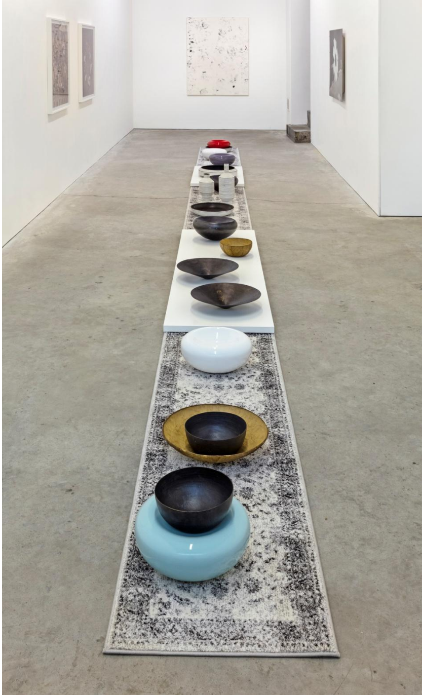
A Viewing Room v.3 installation view, 2018