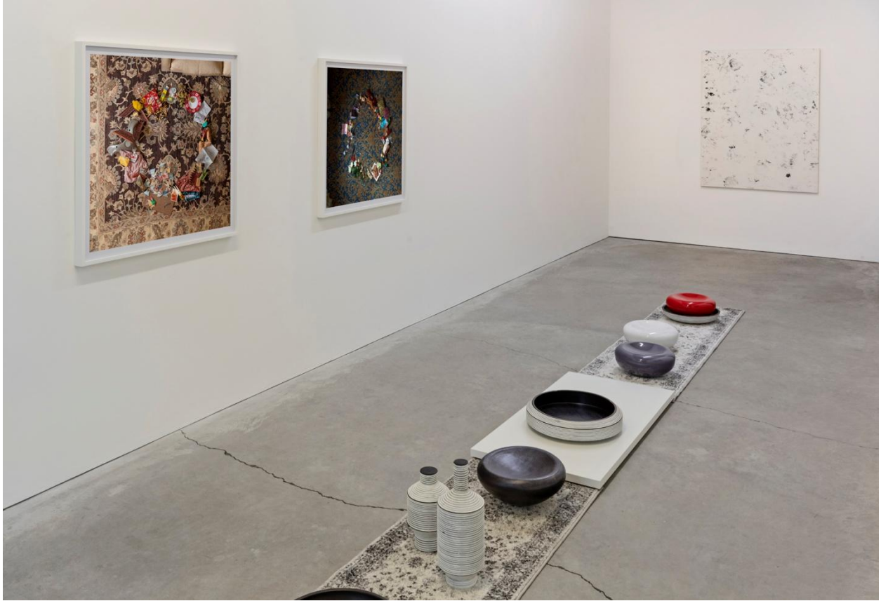
A Viewing Room v.3 installation view, 2018