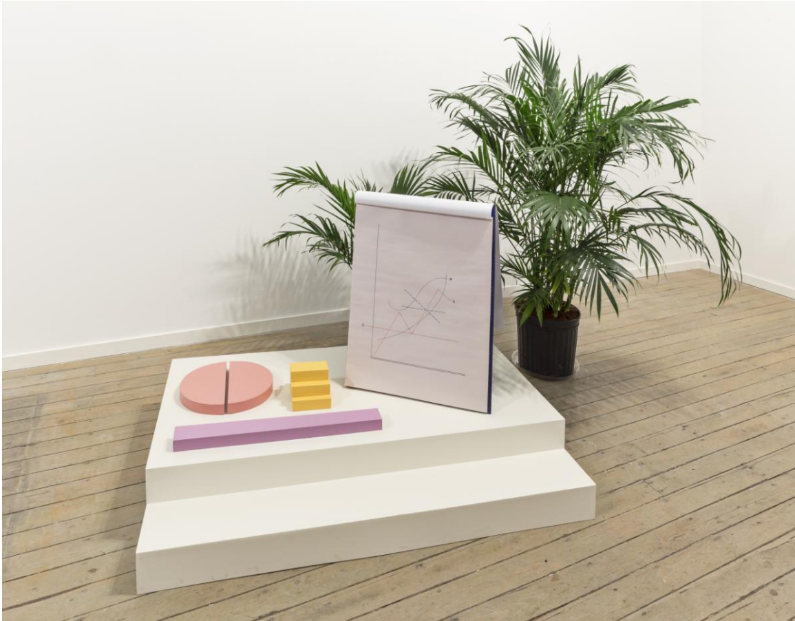
Krista Buecking MATTERS OF FACT (equivalent forms, manipulatives) , 2015 MDF, wood, presentation pad and easel, tropical standard foliage 66 x 317.5 cm