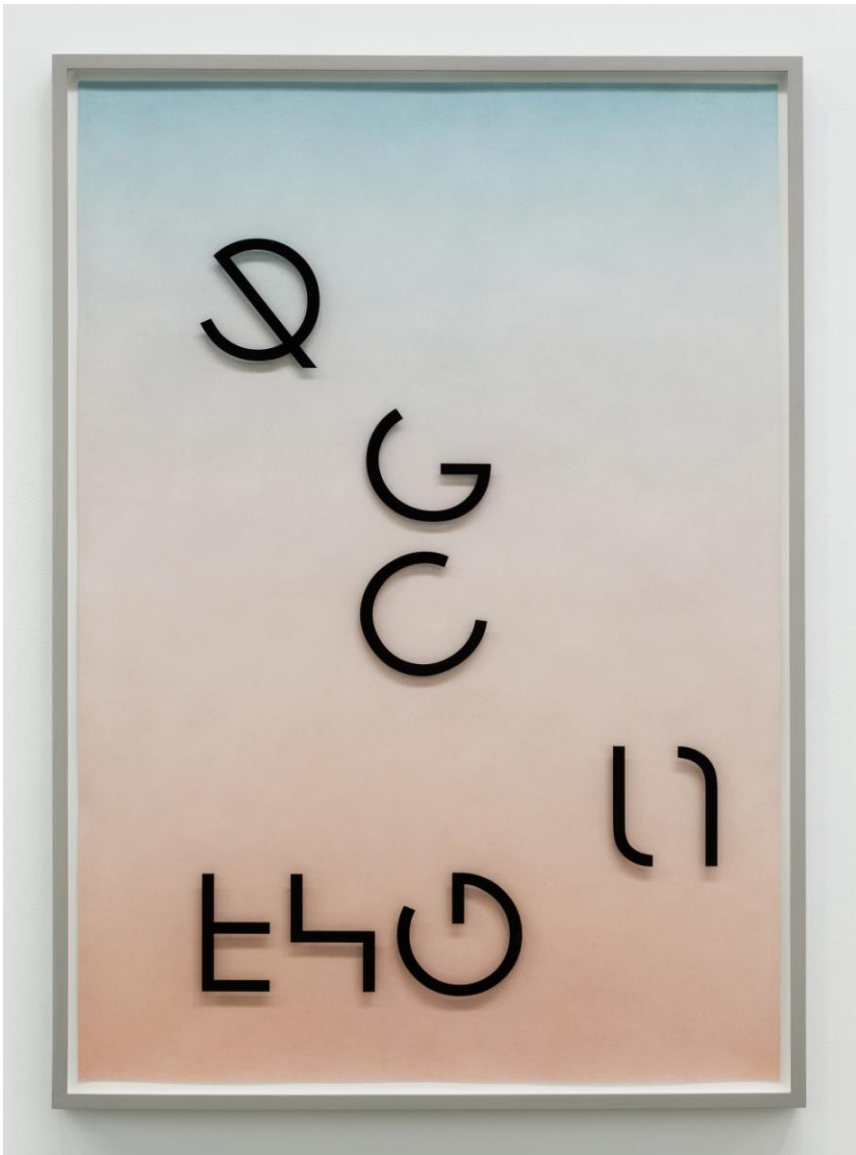
Krista Buecking MATTERS OF FACT (codified form B) , 2015 coloured pencil on paper, acrylic on Plexiglas, audio soundtrack 127.5 x 89.5 cm