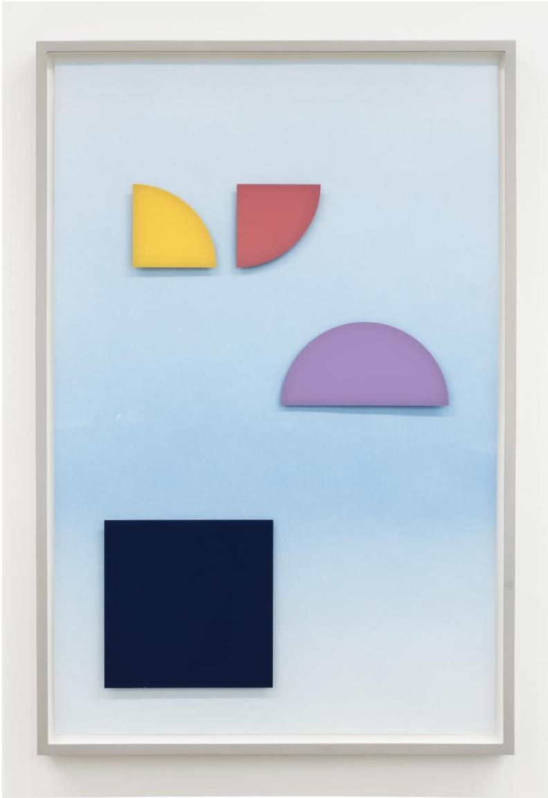
Krista Buecking MATTERS OF FACT (codified form F) , 2015 coloured pencil on paper, acrylic on Plexiglas, audio soundtrack 120 x 79.5 cm