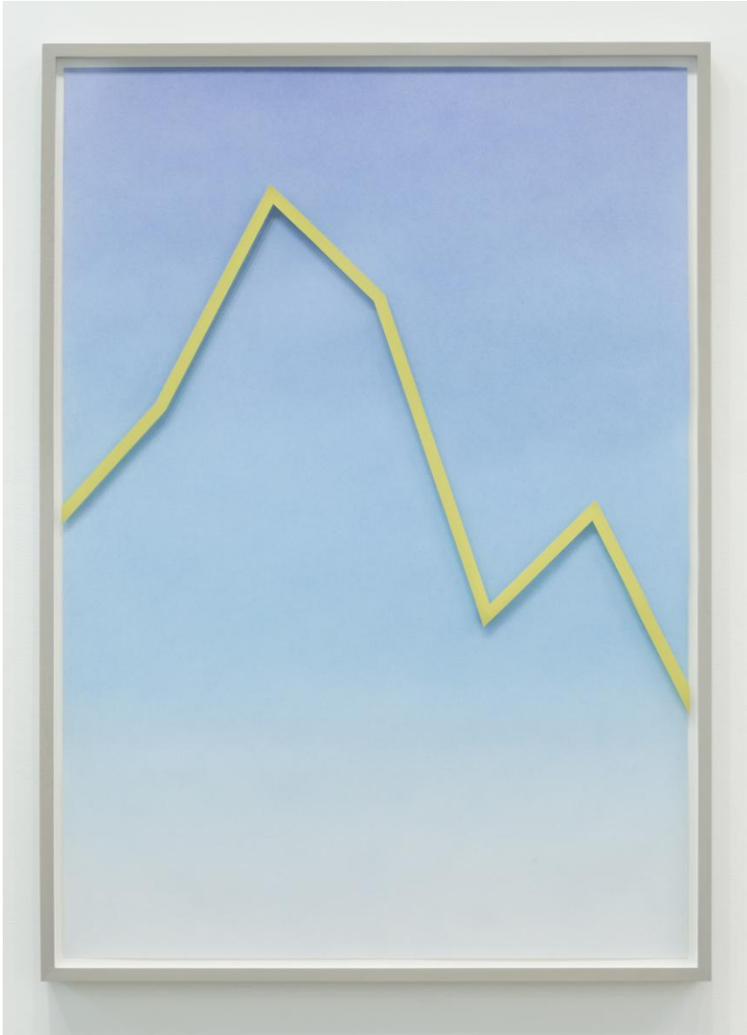
Krista Buecking MATTERS OF FACT (codified form A) , 2015 coloured pencil on paper, acrylic on Plexiglas, audio soundtrack 127.5 x 89.5 cm