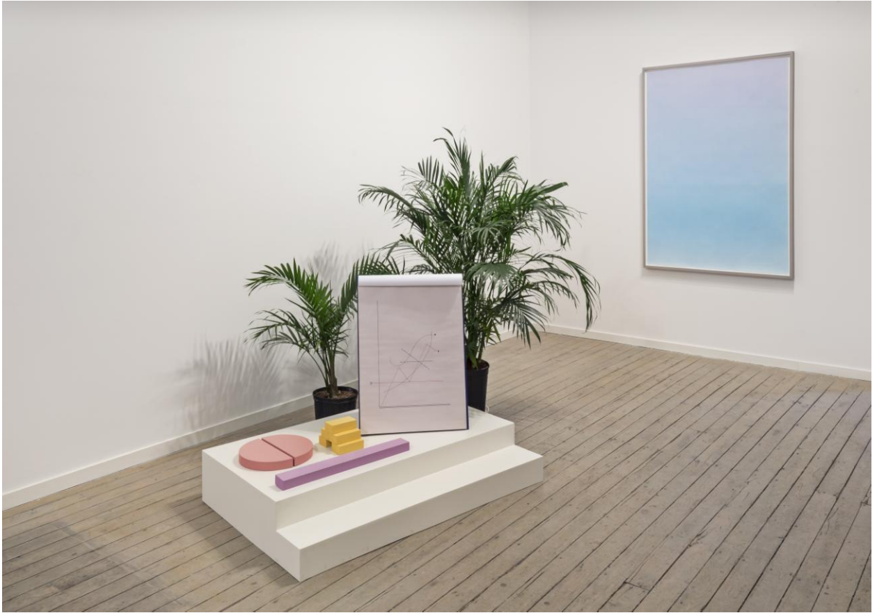
Krista Buecking Installation view second floor, 2015