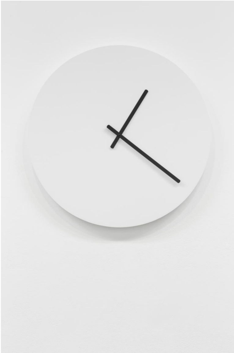
Krista Buecking MATTERS OF FACT (all things being equal) , 2015 MDF, tin, clock movement 61 x 61 cm