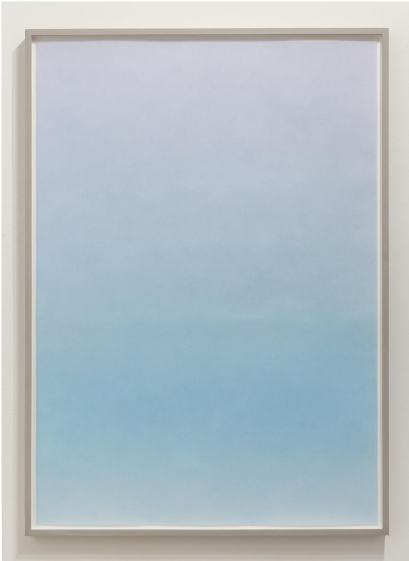
Krista Buecking MATTERS OF FACT (codified form G) , 2015 coloured pencil on paper 148 x 105 cm