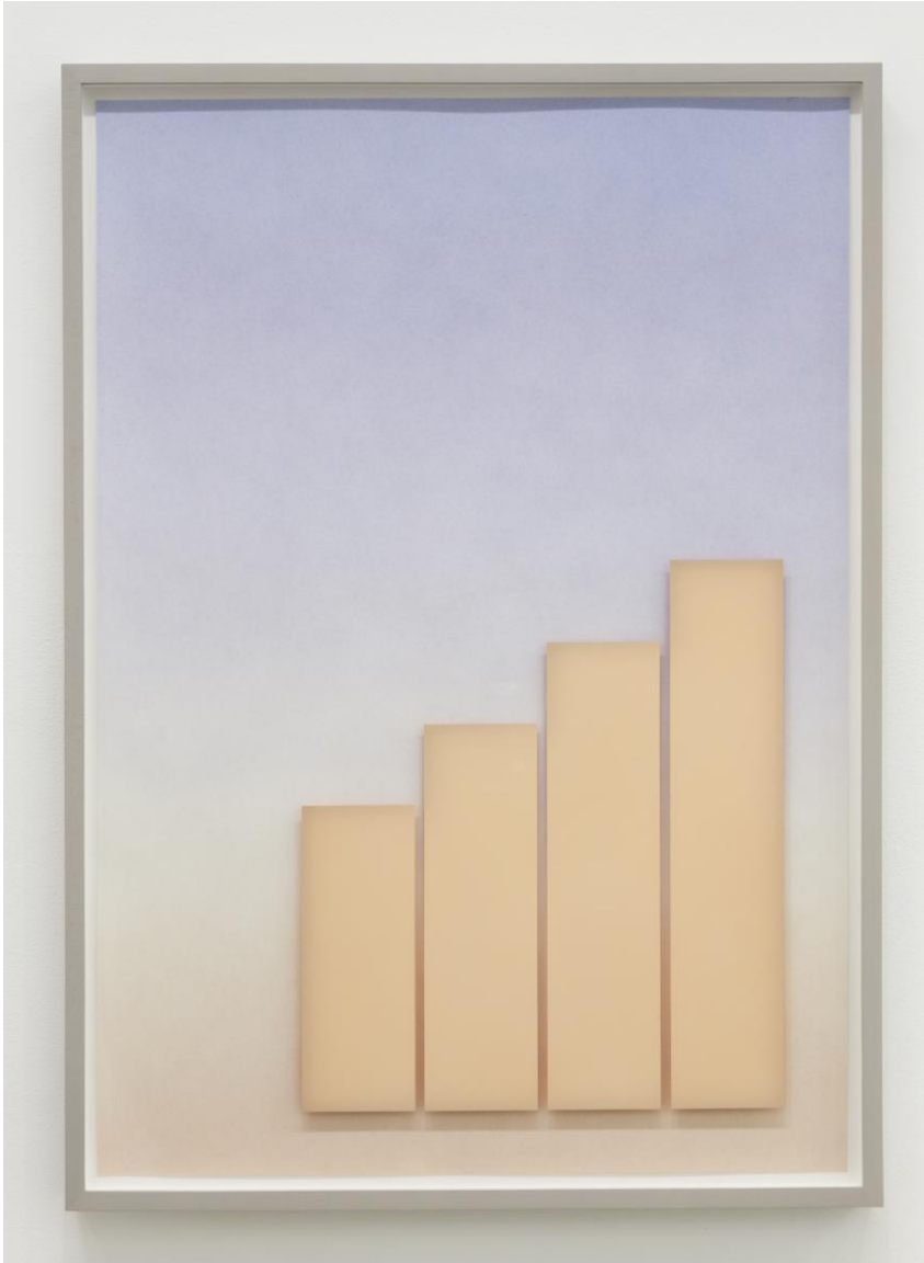
Krista Buecking MATTERS OF FACT (codified form E) , 2015 coloured pencil on paper, acrylic on Plexiglas, audio soundtrack 105 x 74.5 cm