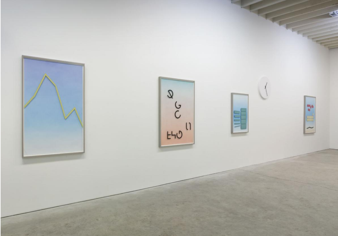
Krista Buecking MATTERS OF FACT Installation view, 2015